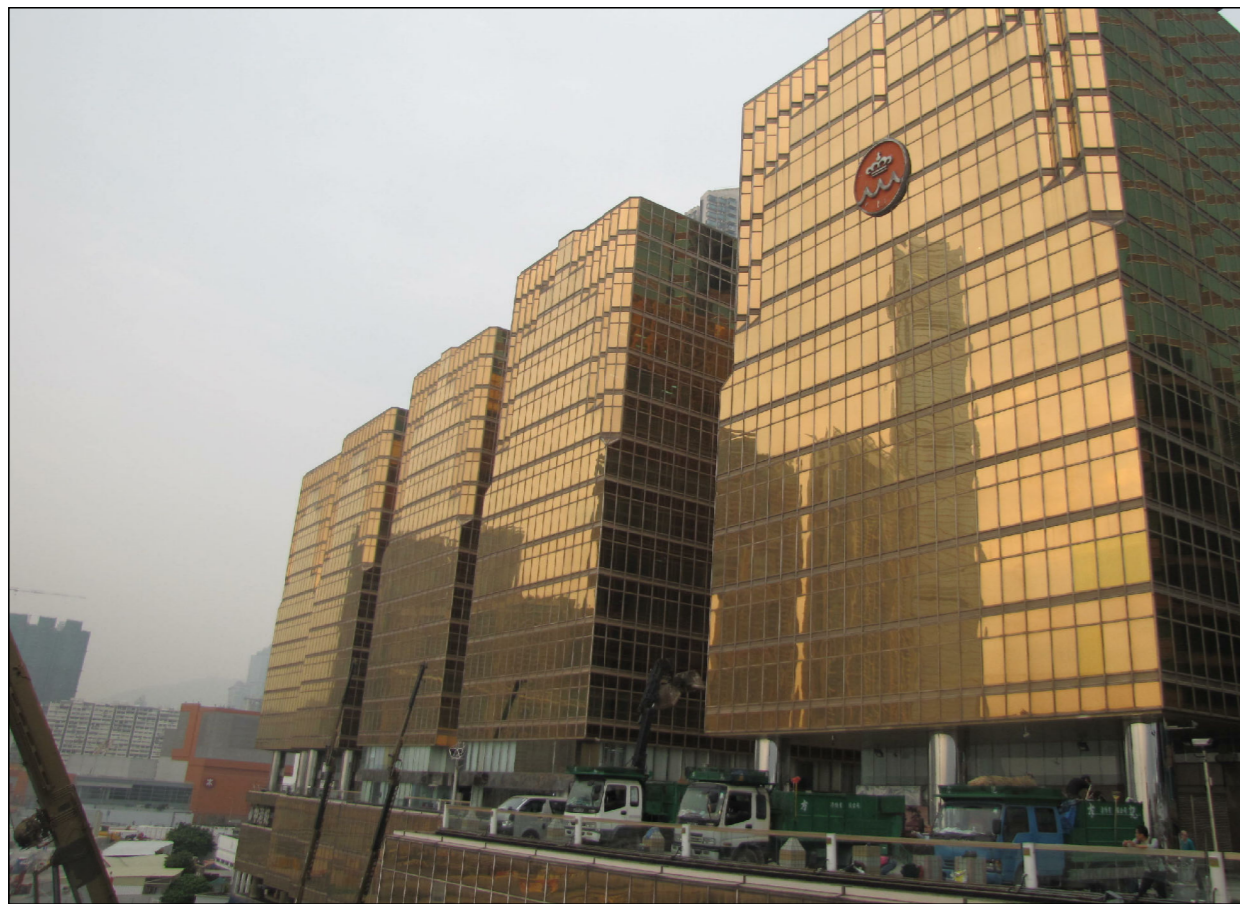
VSR 12 China Hong Kong City