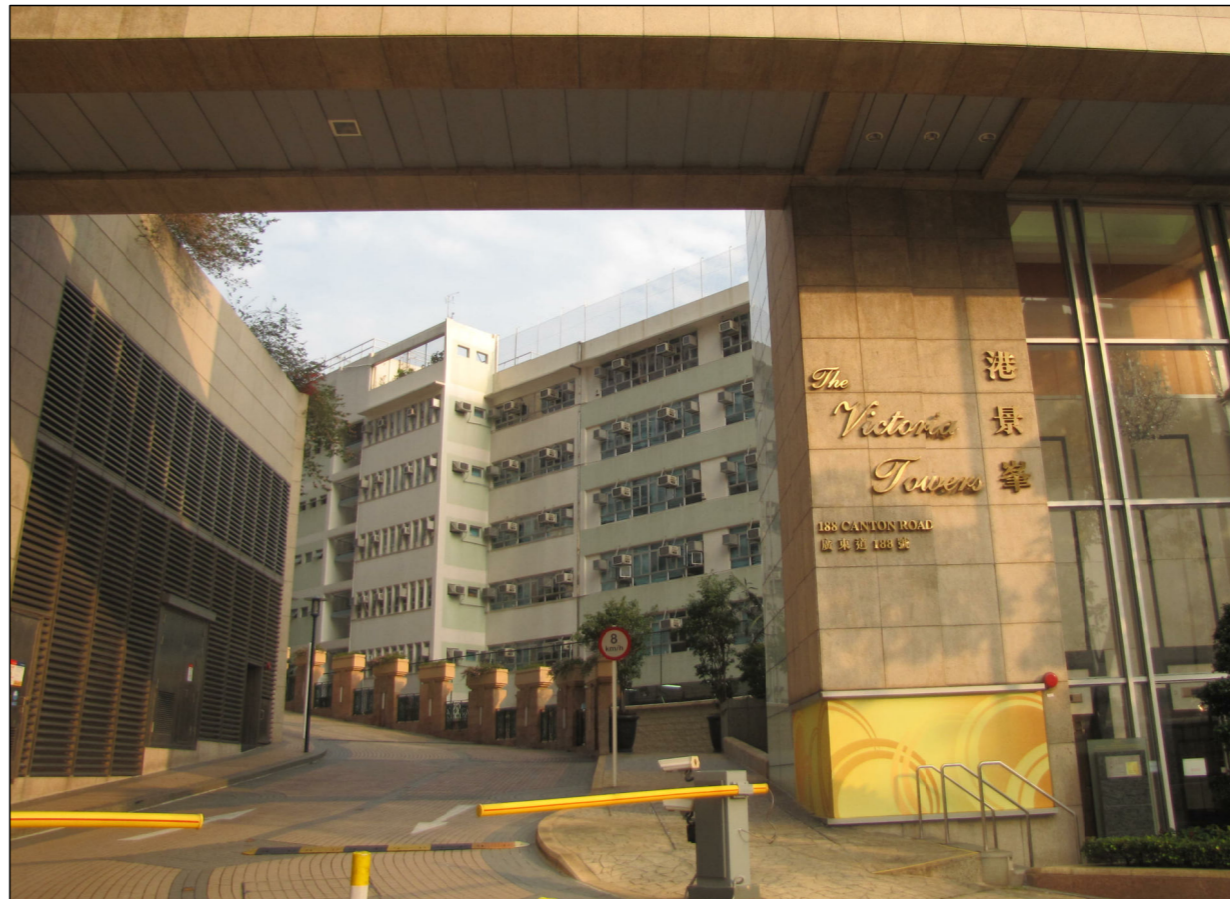
VSR 11 Victoria Tower