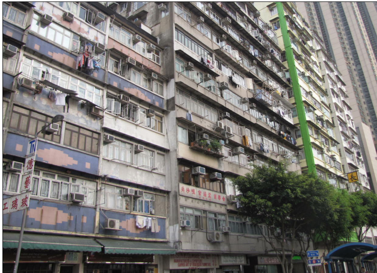
VSR 10 Wai Hang Building