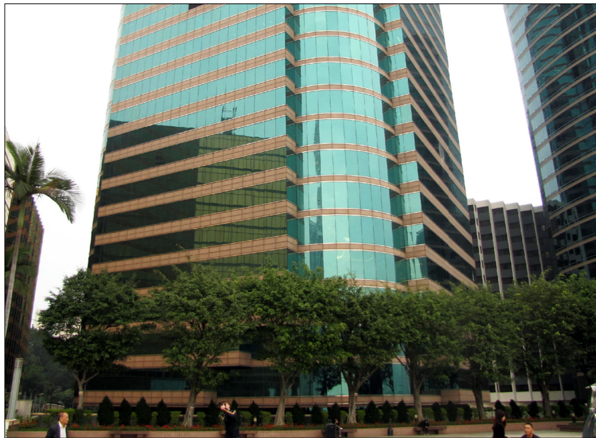
VSR 13 Royal Pacific Hotel and Towers