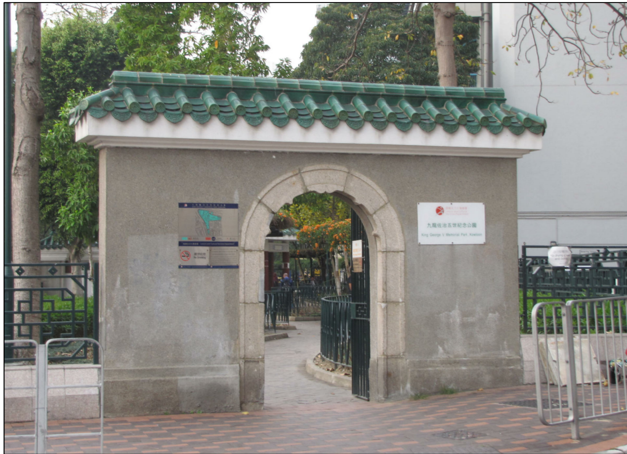
VSR 18 King George V Memorial Park, Kowloon