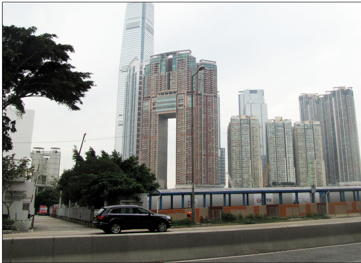
VSR 20 Travellers along Canton Road