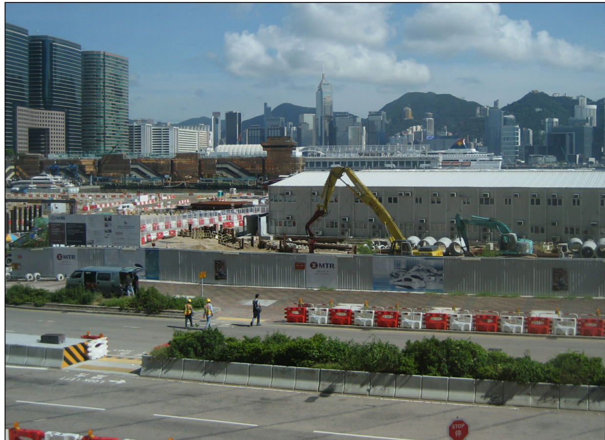
VSR 19 Travellers along Austin Road West