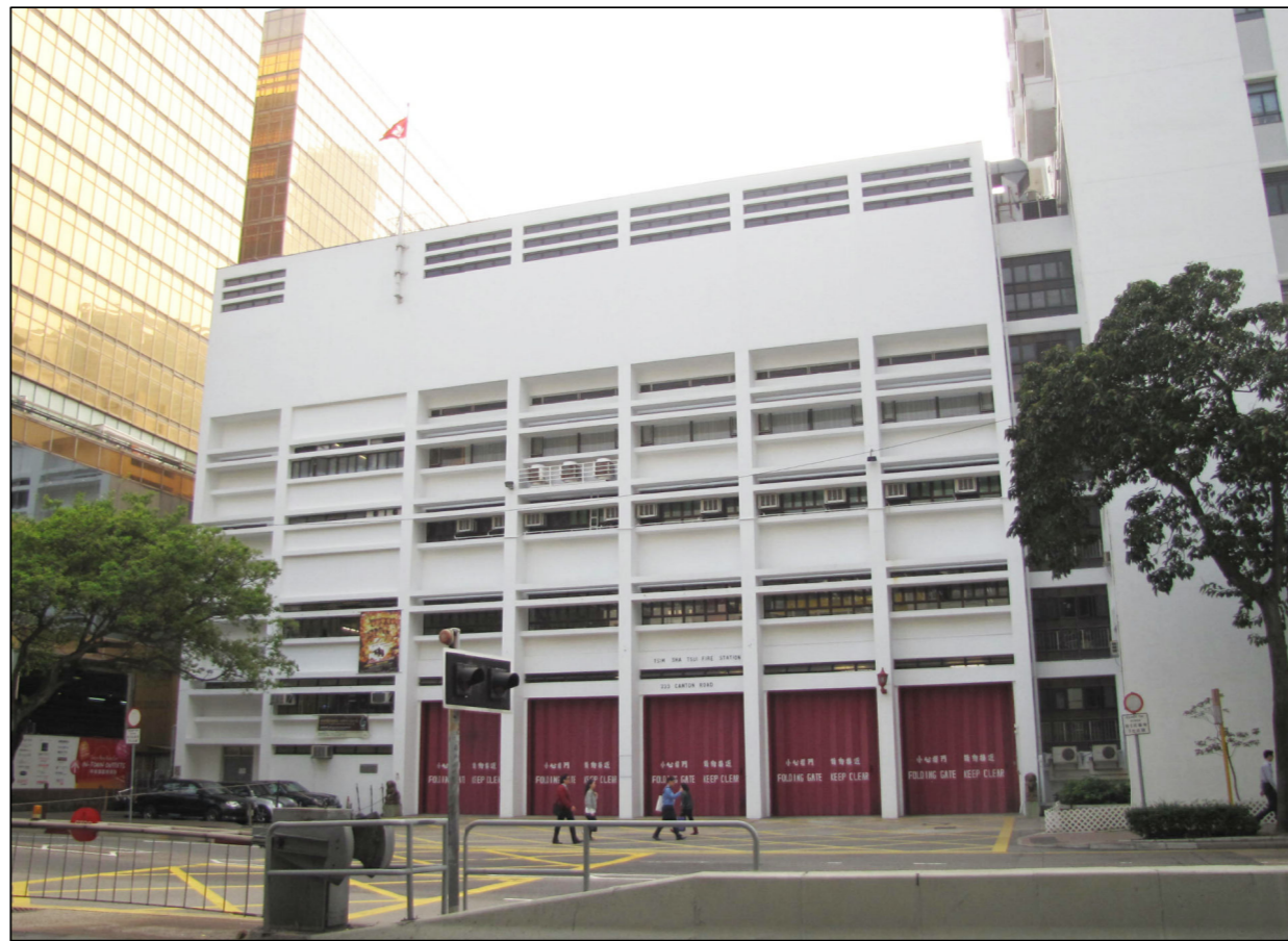
VSR 21 Tsim Sha Tsui Fire Station