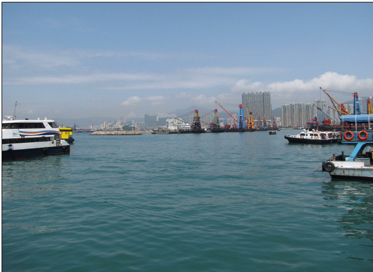
VSR 7 Travellers at Yau Ma Tei Typhoon Shelter