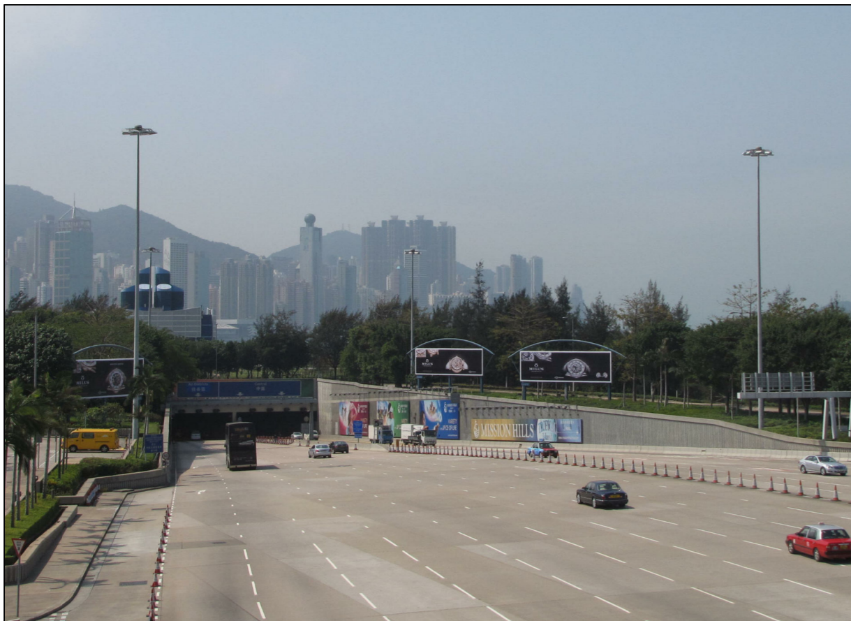
VSR 5 Travellers Arriving at West Harbour Crossing Toll Plaza