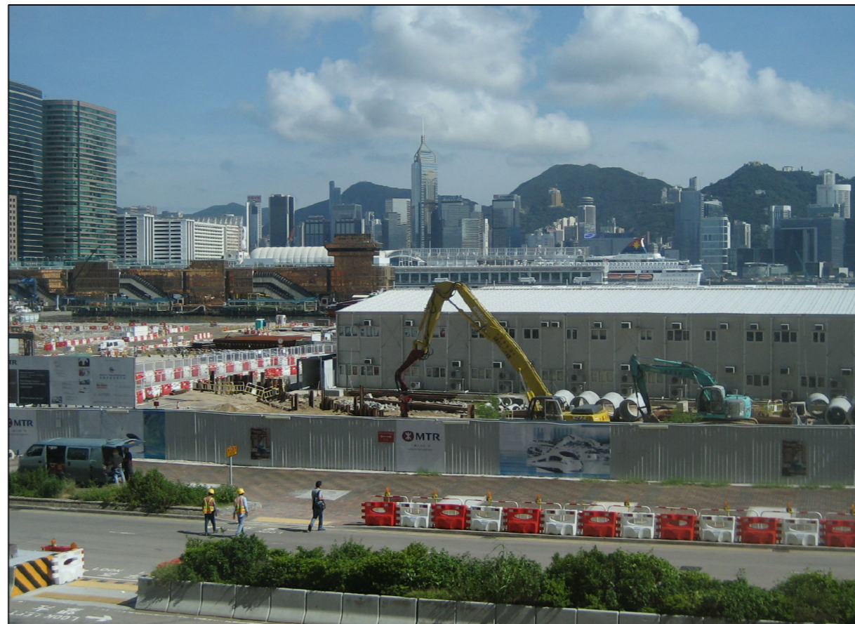
VSR 8 Travellers along Austin Road West