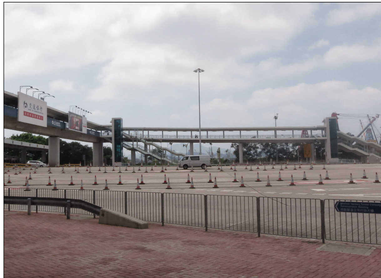
VSR 6 Travellers at the Footbridge Crossing West Harbour Crossing Toll Plaza