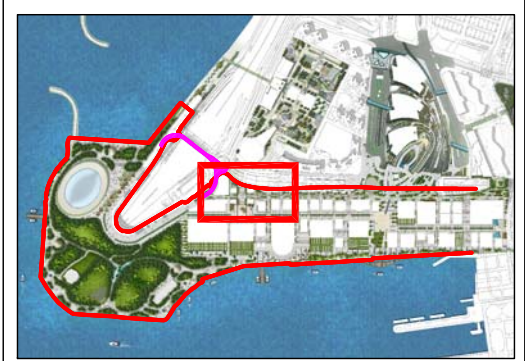
KEYPLAN 1:25,000M @A3