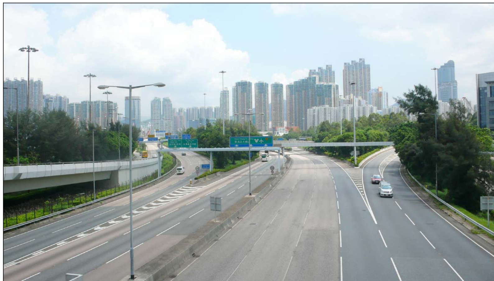
LR2.26 Trees along West Kowloon Highway Photo 2