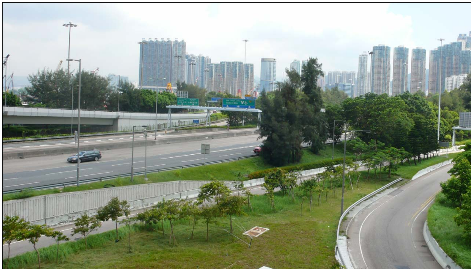
LR2.26 Trees along West Kowloon Highway Photo 1