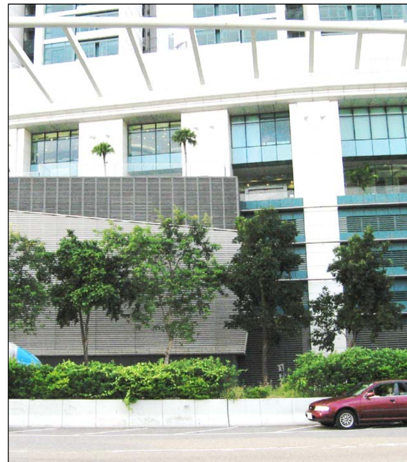
LR2.29 Roadside Plantation along Austin Road West Photo 3