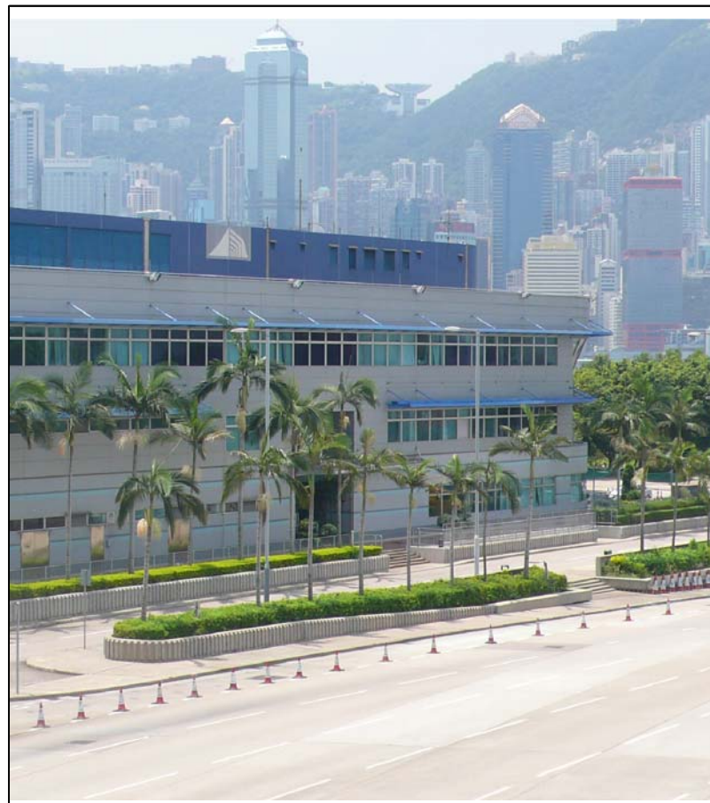
LR2.30 Roadside Plantation next to Western Harbour Tunnel Administration Photo 1