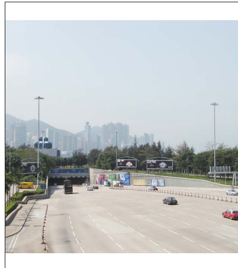
LR2.31 Tree Buffering Western Harbour Tunnel Entrance Photo 1