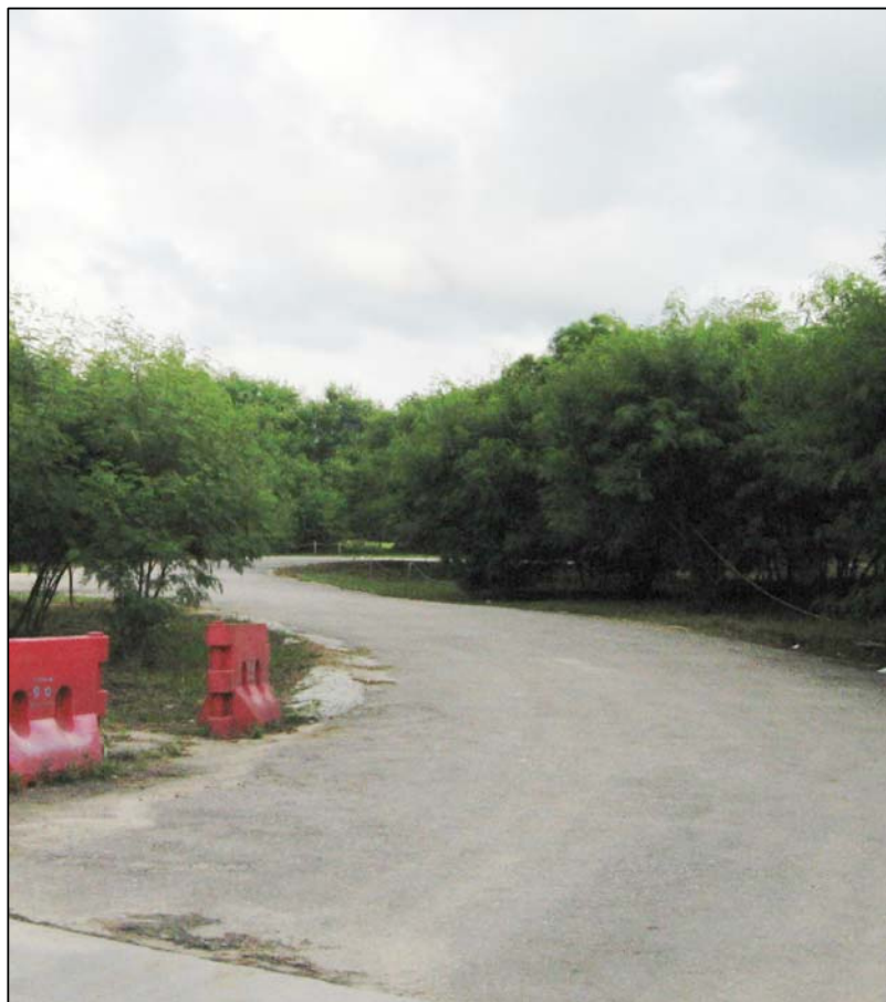
LR2.35 Tree Cluster in the Western Part within the Site Boundary Photo 2