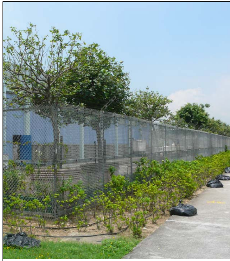
LR2.34 Amenity Planting within Salt Water Pumping Station Photo 1