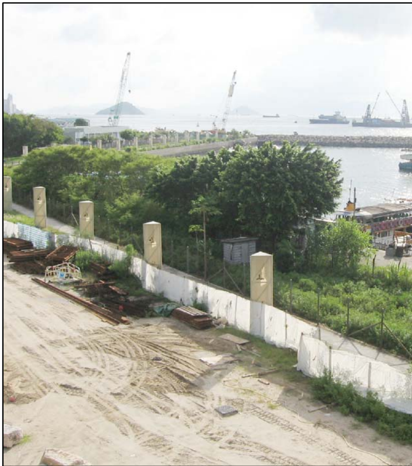
LR2.33 Trees along New Yau Ma Tei Typhoon Shelter Pier Photo 1