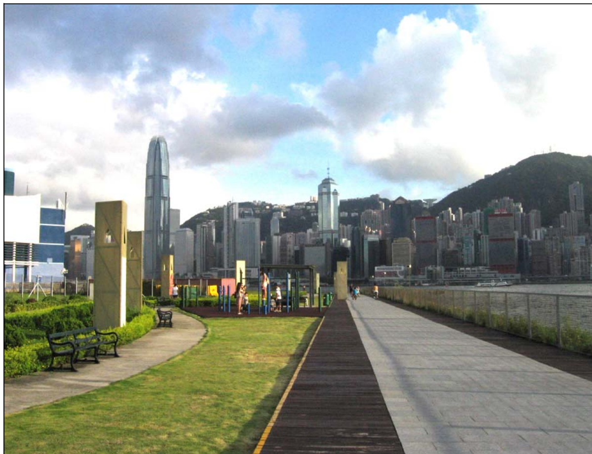
Photo VC05 (LCA03) West Kowloon Cultural District Temporary Waterfront Promenade