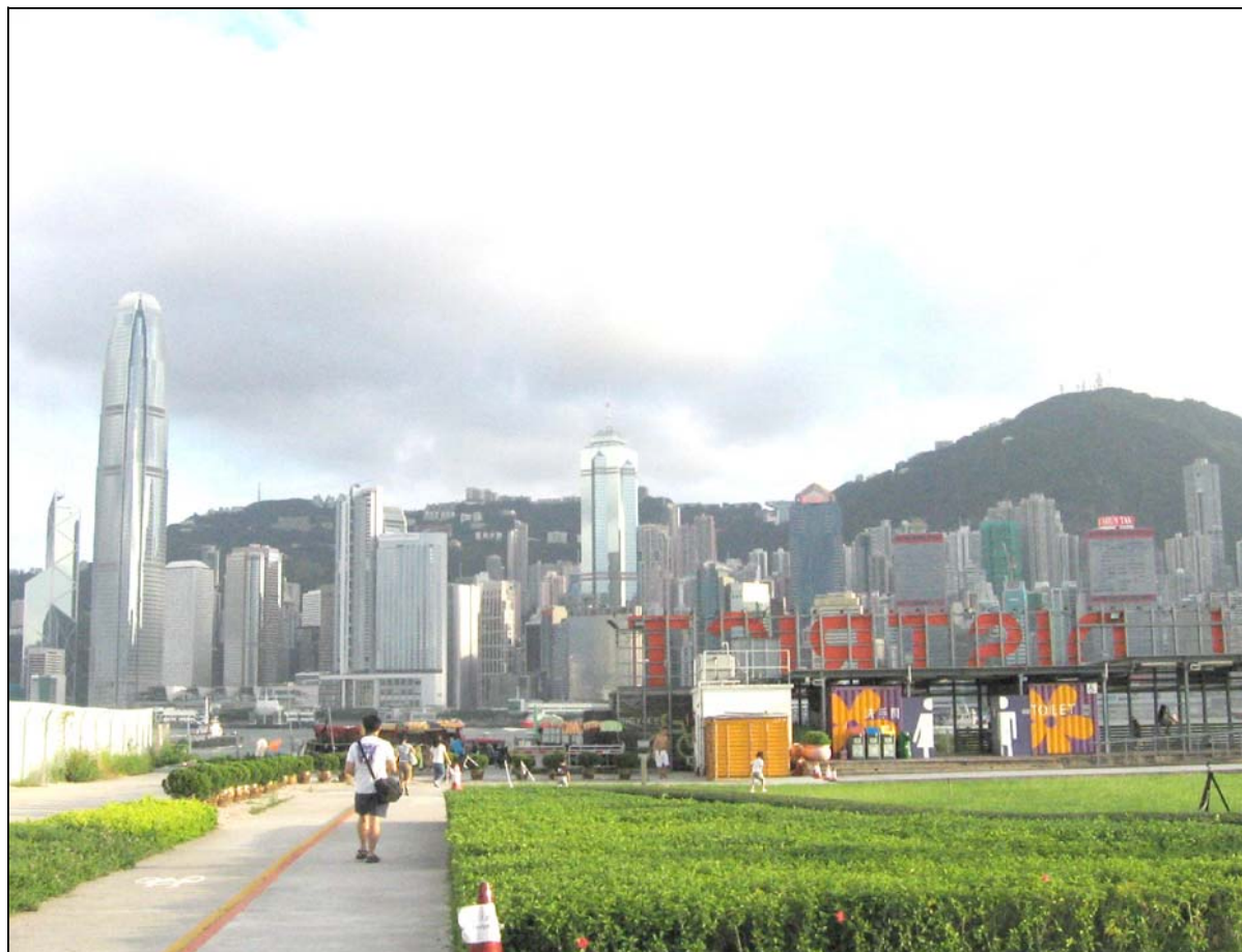
Photo VC07 (LCA03) West Kowloon Cultural District Temporary Waterfront Promenade