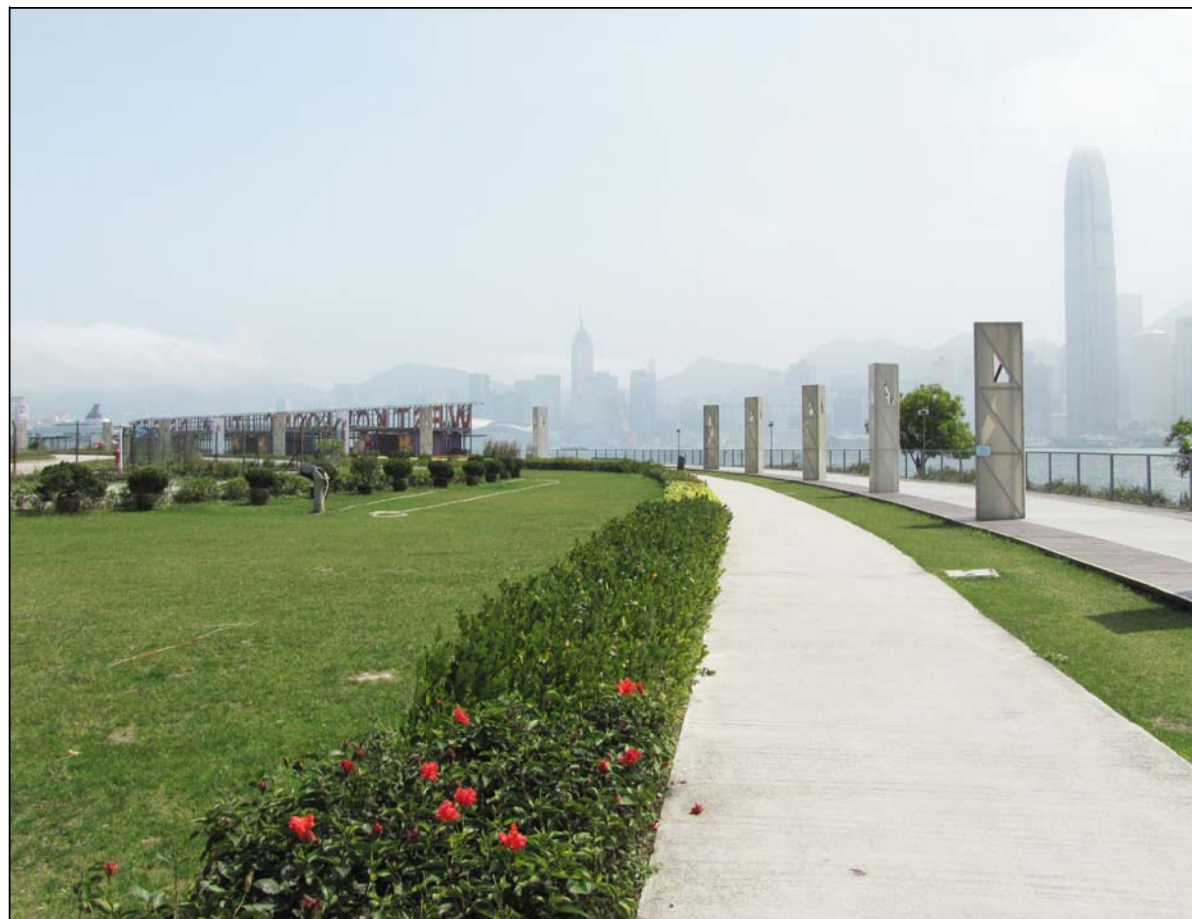
Photo VC08 (LCA03) West Kowloon Cultural District Temporary Waterfront Promenade