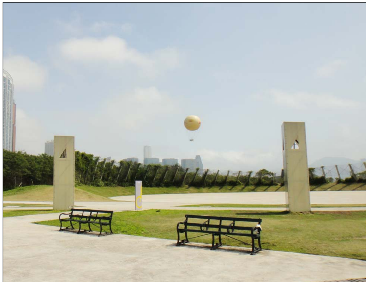
Photo VC06 (LCA03) West Kowloon Cultural District Temporary Waterfront Promenade