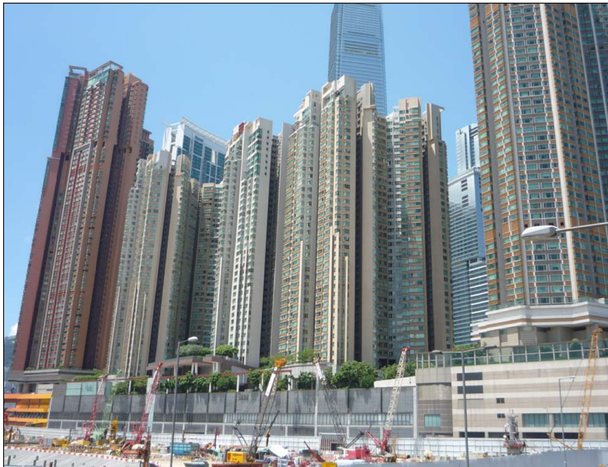
Photo VC18 (LCA09) Tsim Sha Tsui Late 20C/Early 21C Commercial/Residential Complex Landscape