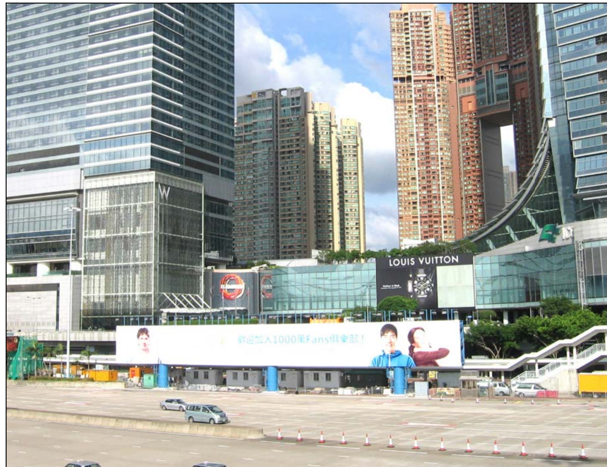
Photo VC17A (LCA09) Tsim Sha Tsui Late 20C/Early 21C Commercial/Residential Complex Landscape