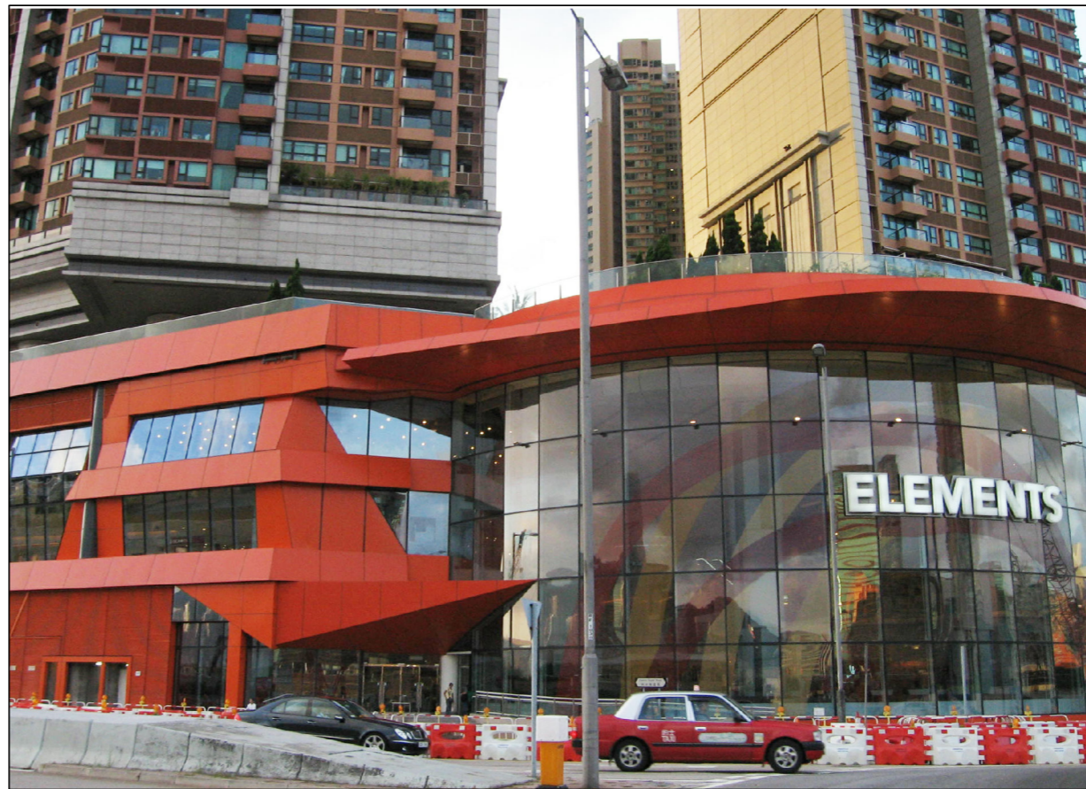
VSR 2 The Elements