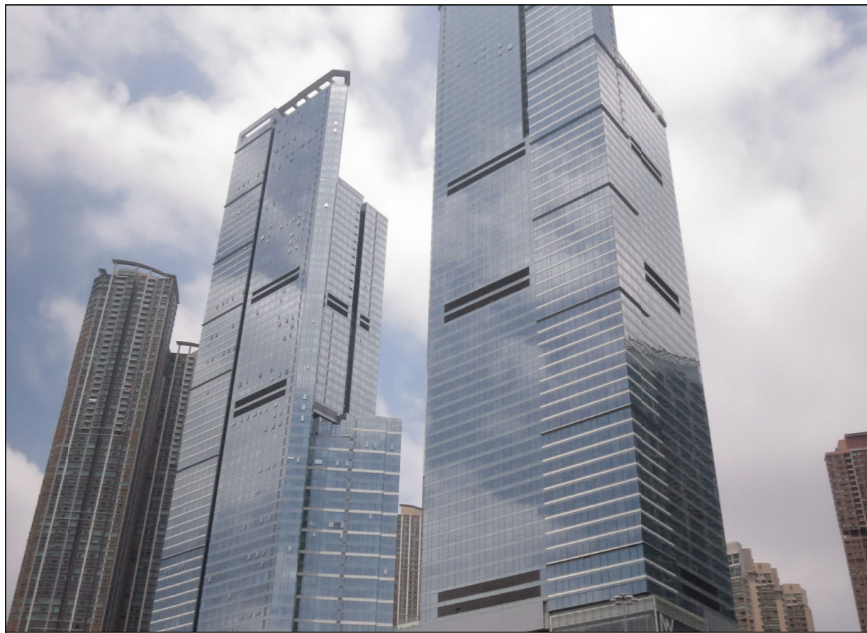
VSR 3 The Cullinun