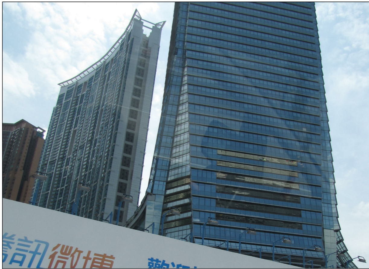
VSR 1 International Commerce Centre (ICC)