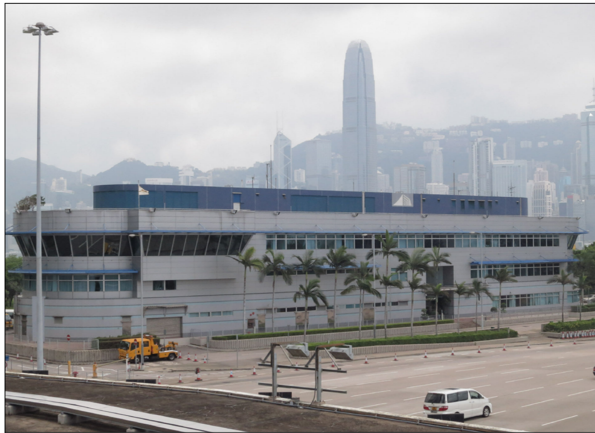
VSR 4 Administration Building at West Harbour Crossing