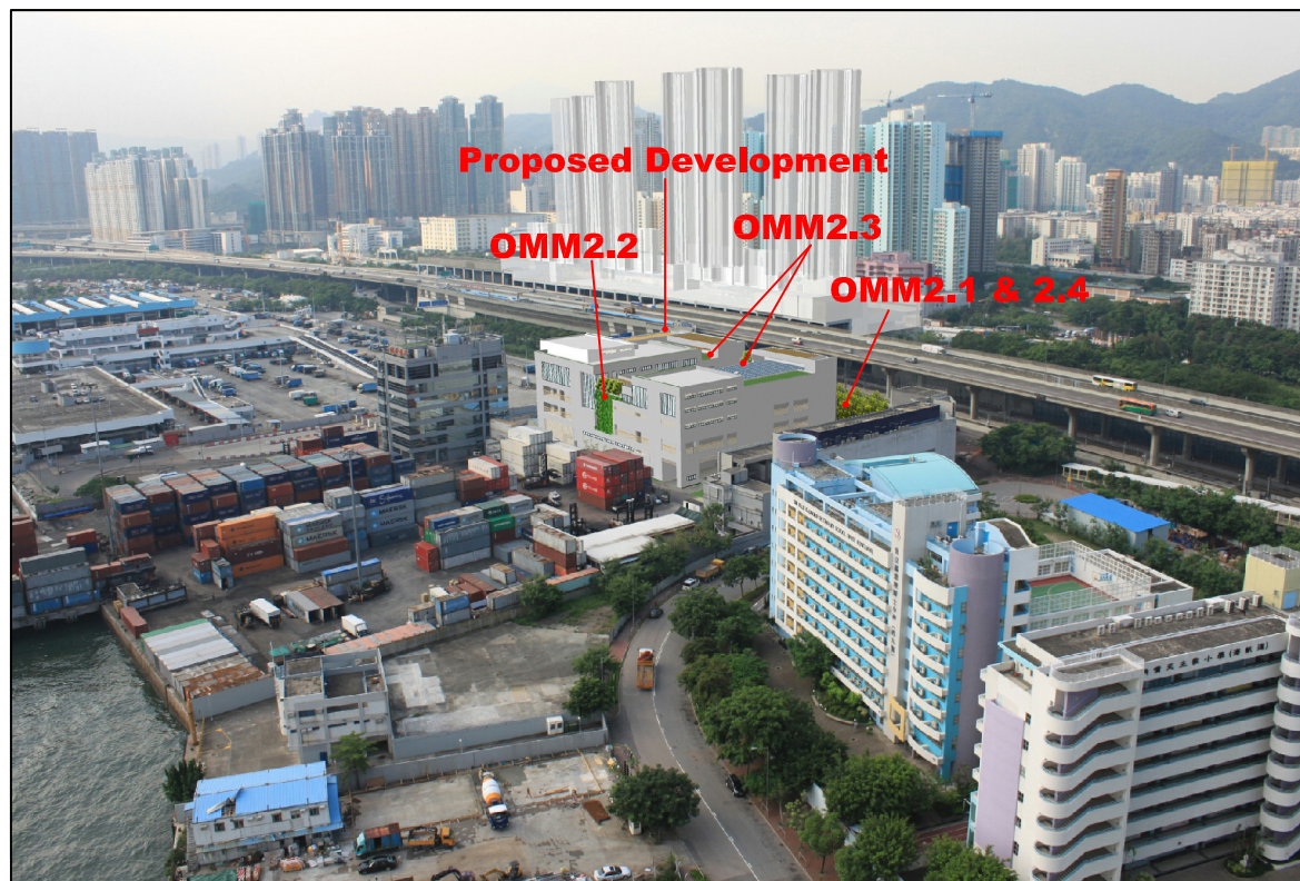
VP3 Hampton Place, Middle Level, Year 10 with Mitigation Measures