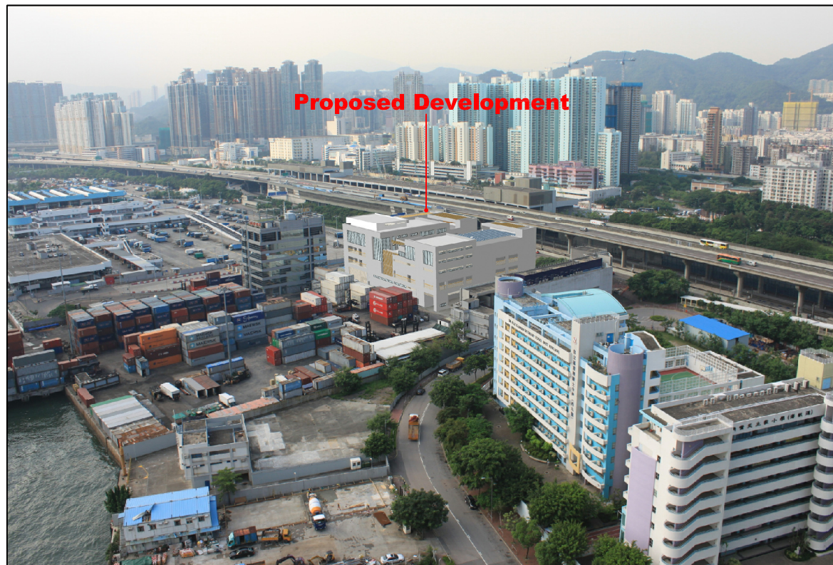
VP3 Hampton Place, Middle Level, Unmitigated