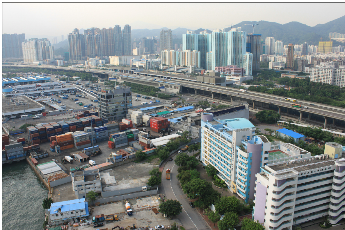
VP3 Hampton Place, Middle Level, Existing