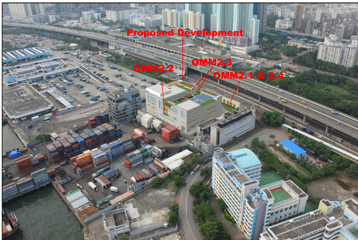
VP3 Hampton Place, Top Level, Day 1 with Mitigation Measures