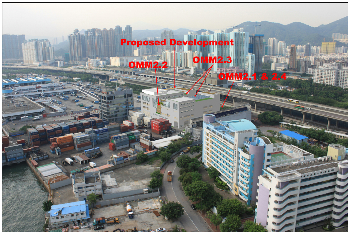
VP3 Hampton Place, Middle Level, Day 1 with Mitigation Measures