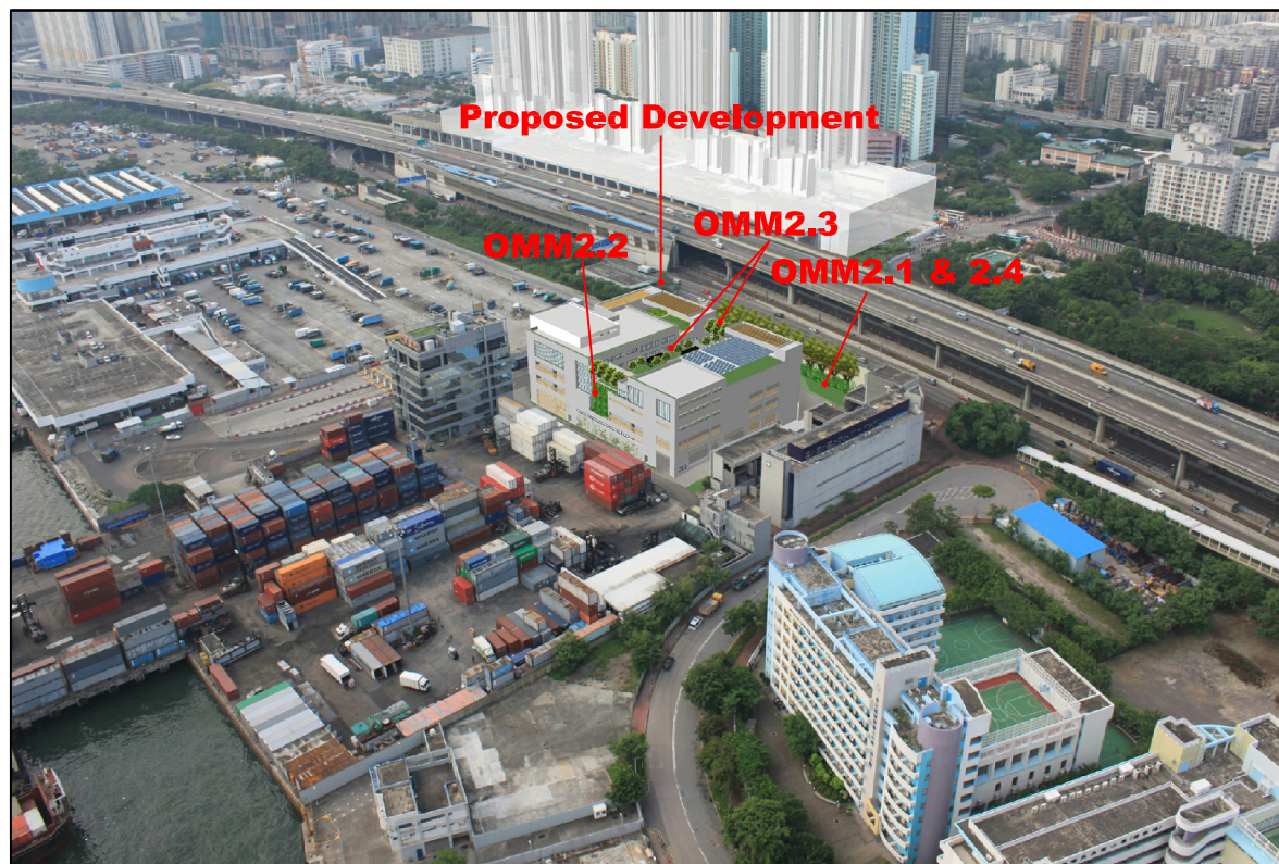
VP3 Hampton Place, Top Level, Year 10 with Mitigation Measures