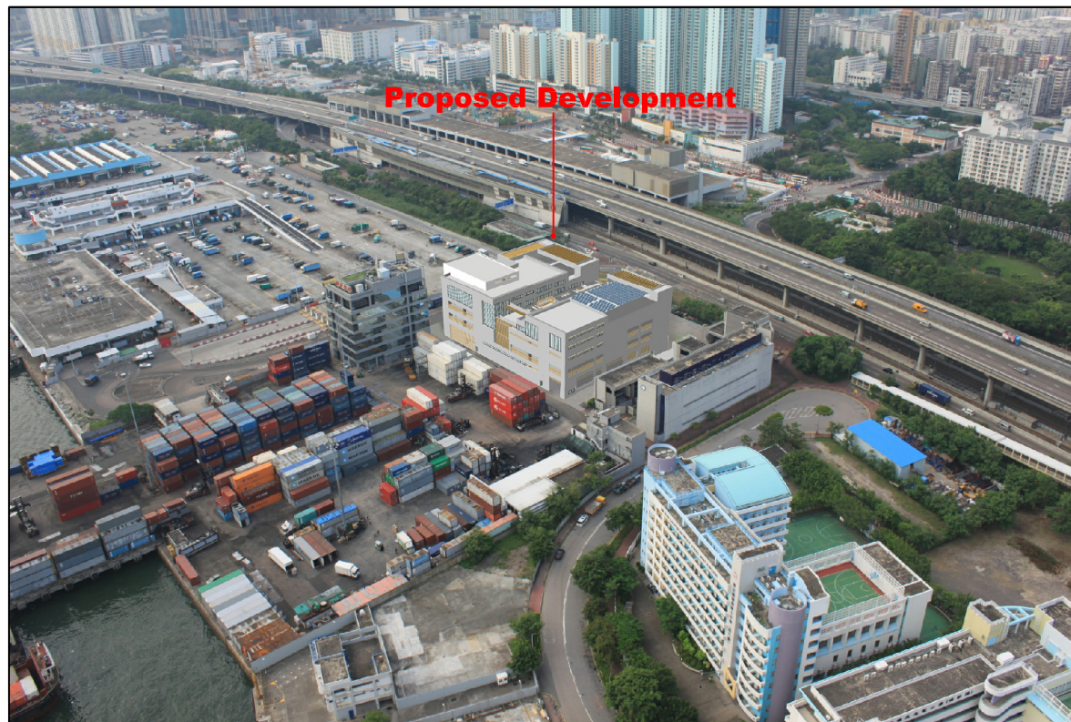
VP3 Hampton Place, Top Level, Unmitigated