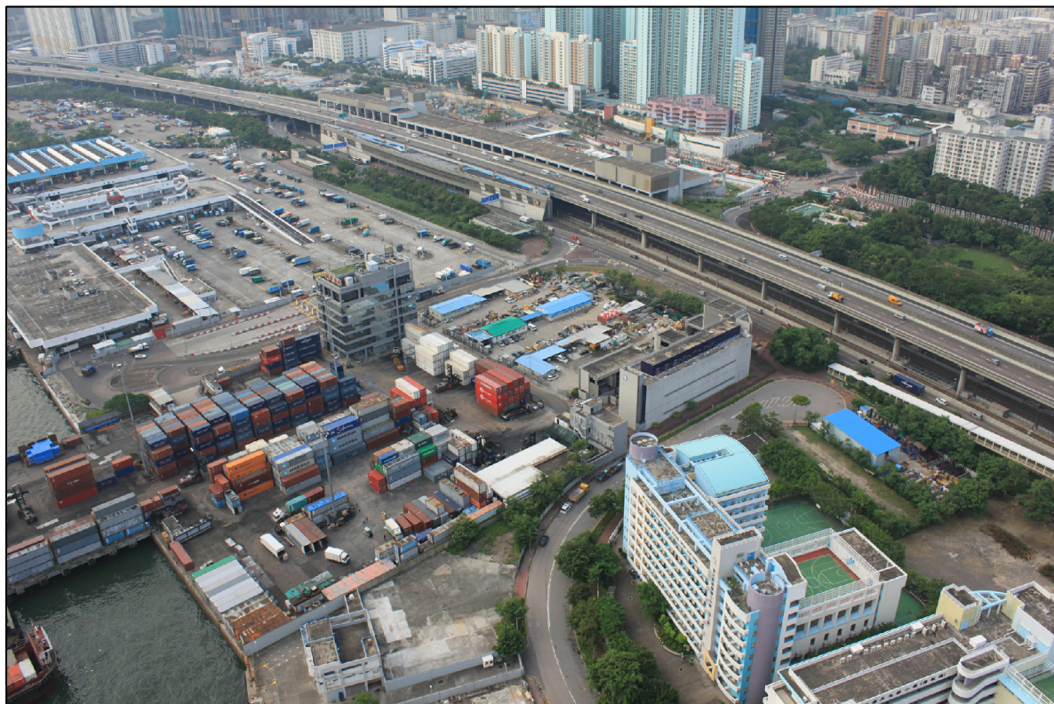
VP3 Hampton Place, Top Level, Existing