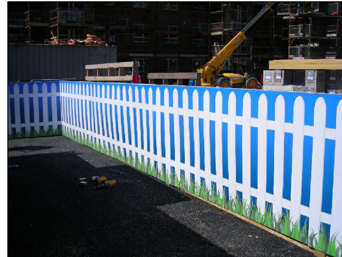
AN OVERSEA EXAMPLE