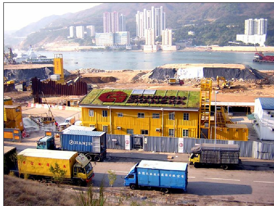
SITE OFFICE OF A LOCAL CONTRACTOR IN A CONSTRUCTION SITE IN TSING YI