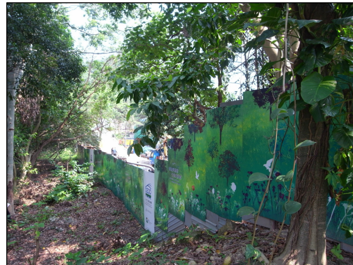
A CONSTRUCTION SITE OF CEDD AT BRAEMAR HILL ROAD, HONG KONG