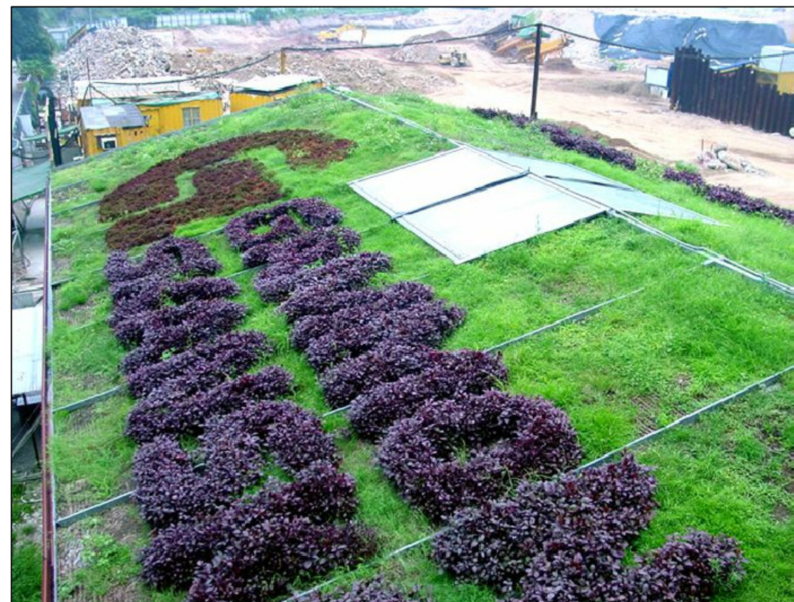
A CLOSE-UP OF GREEN ROOF