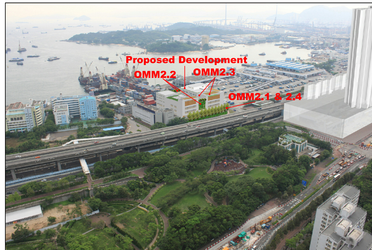
VP2 Metro Harbour View, Top Level, Year 10 with Mitigation Measures