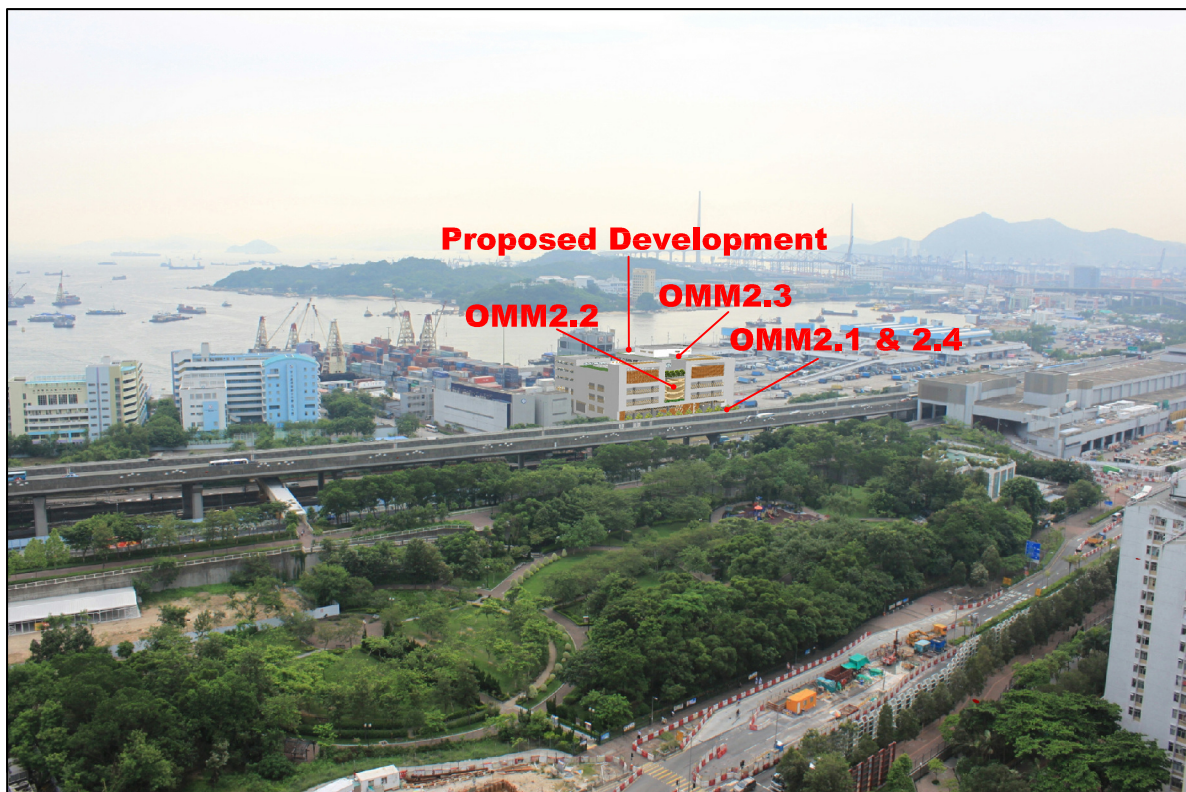
VP2 Metro Harbour View, Middle Level, Day 1 with Mitigation Measures