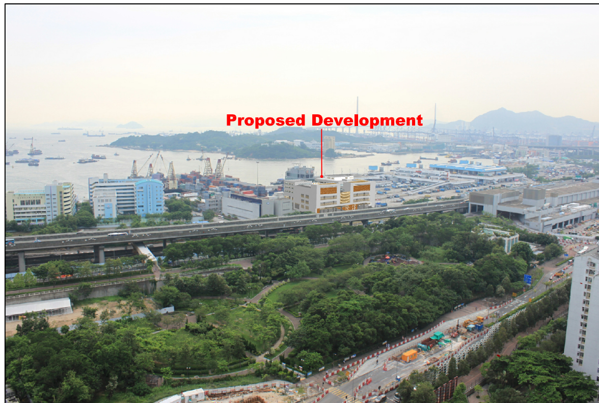
VP2 Metro Harbour View, Middle Level, Unmitigated