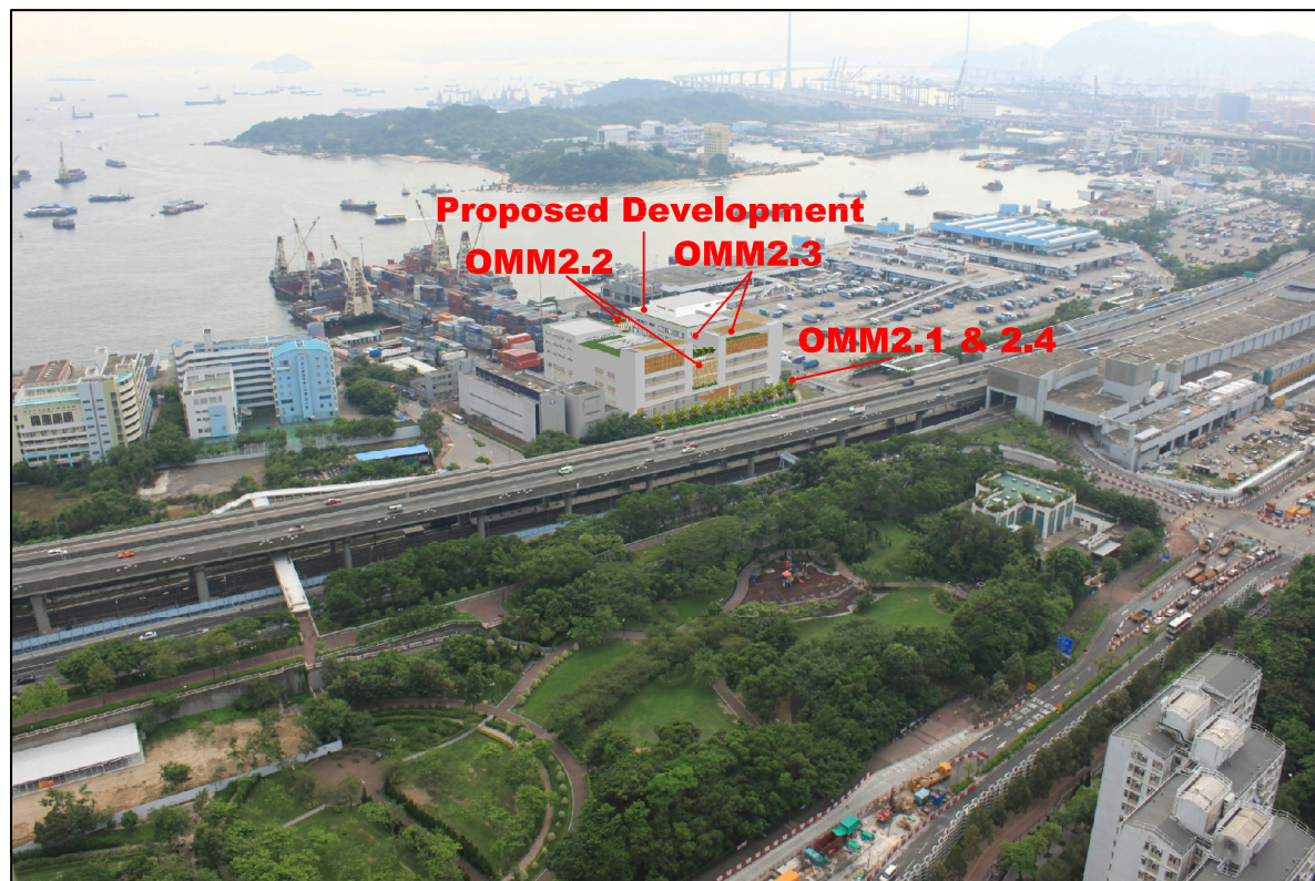
VP2 Metro Harbour View, Top Level, Day 1 with Mitigation Measures