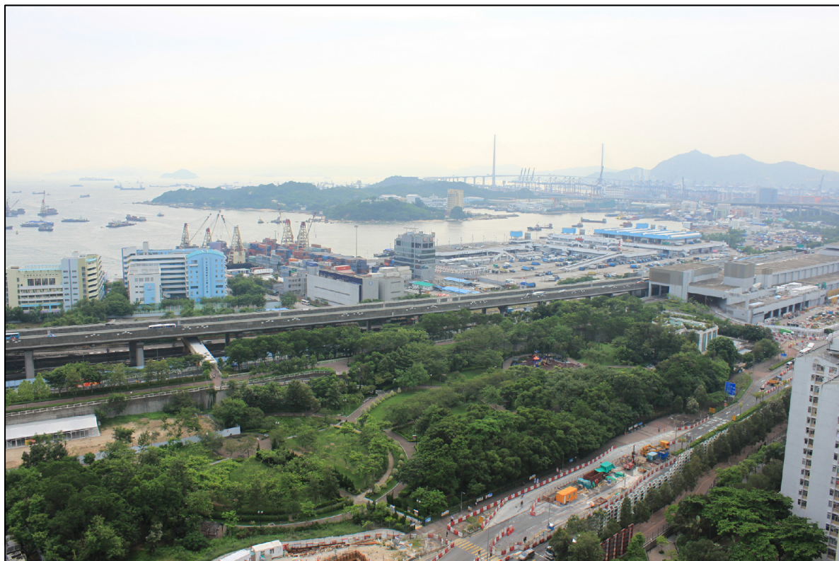
VP2 Metro Harbour View, Middle Level, Existing