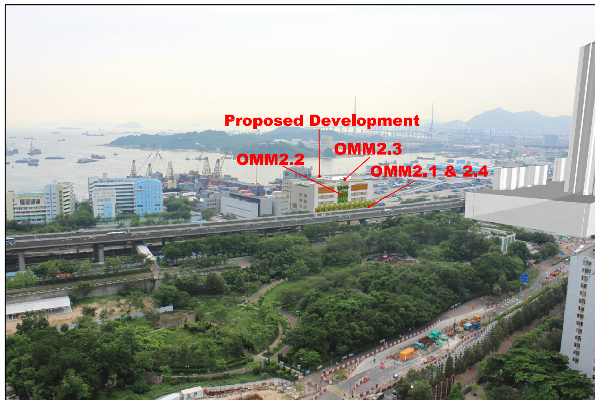
VP2 Metro Harbour View, Middle Level, Year 10 with Mitigation Measures