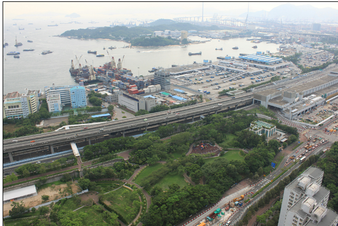
VP2 Metro Harbour View, Top Level, Existing