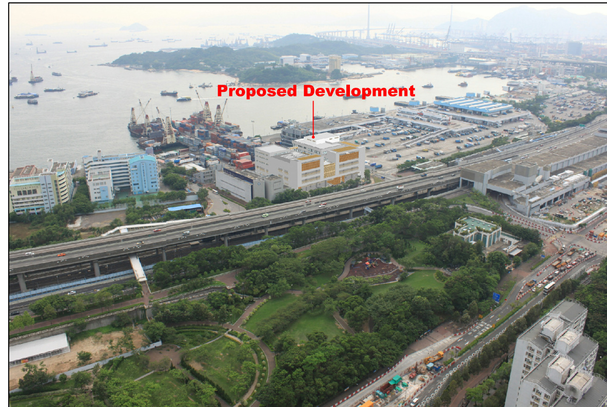
VP2 Metro Harbour View, Top Level, Unmitigated