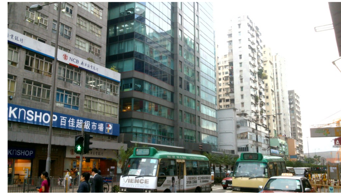
LCA2 - City Mixed Grid Urban