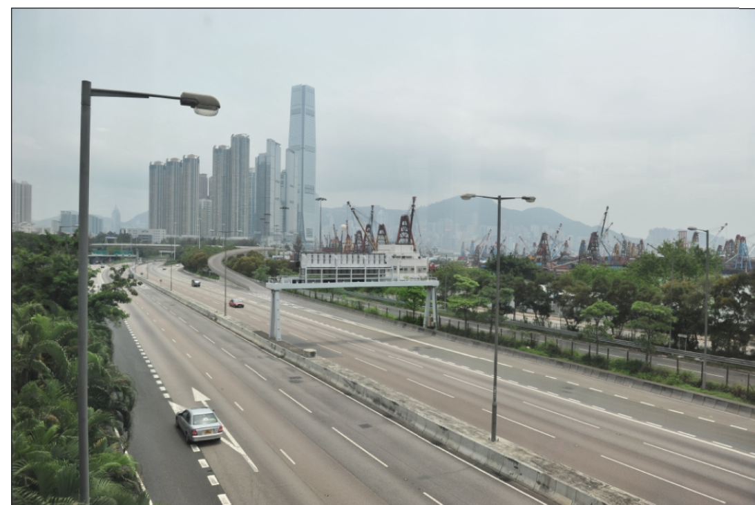
LCA5.1 Transportation Corridor - West Kowloon Highway