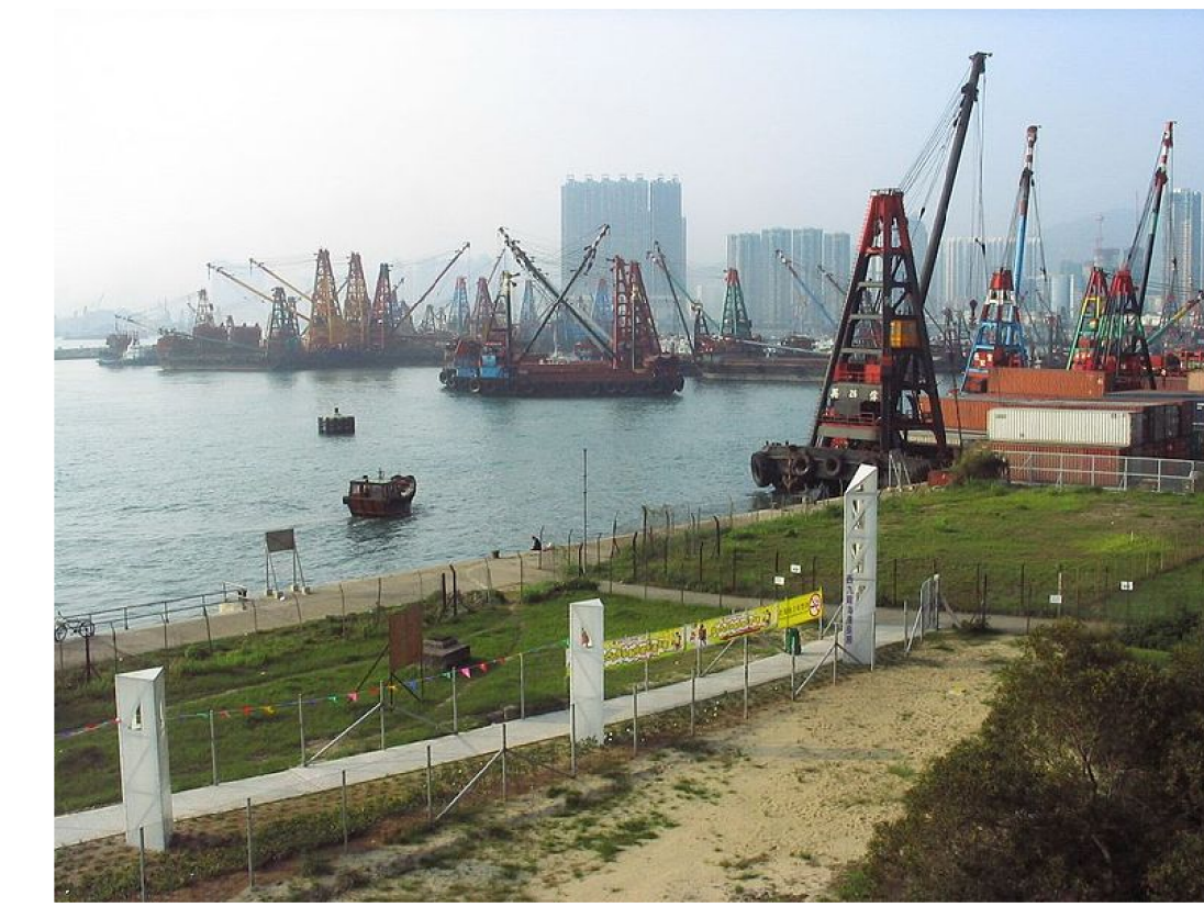
LCA4 - Port+Dock