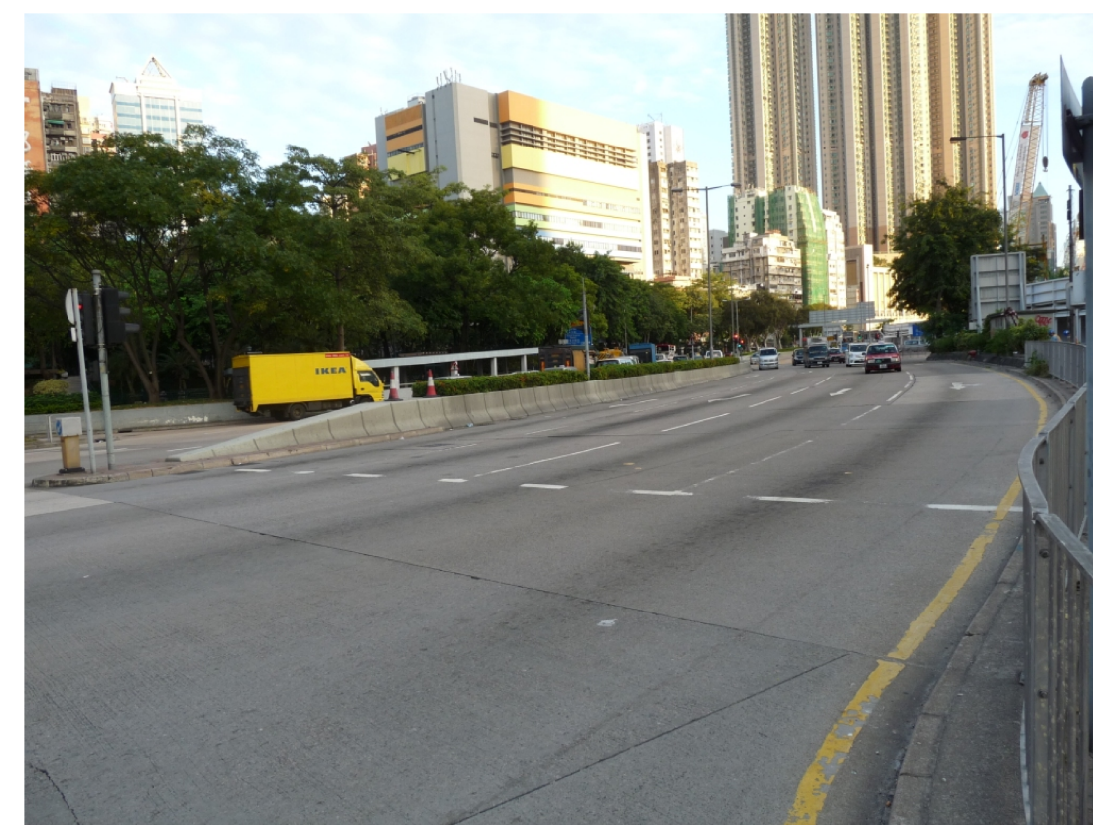
LCA5.2 Transportation Corridor - Canton Road