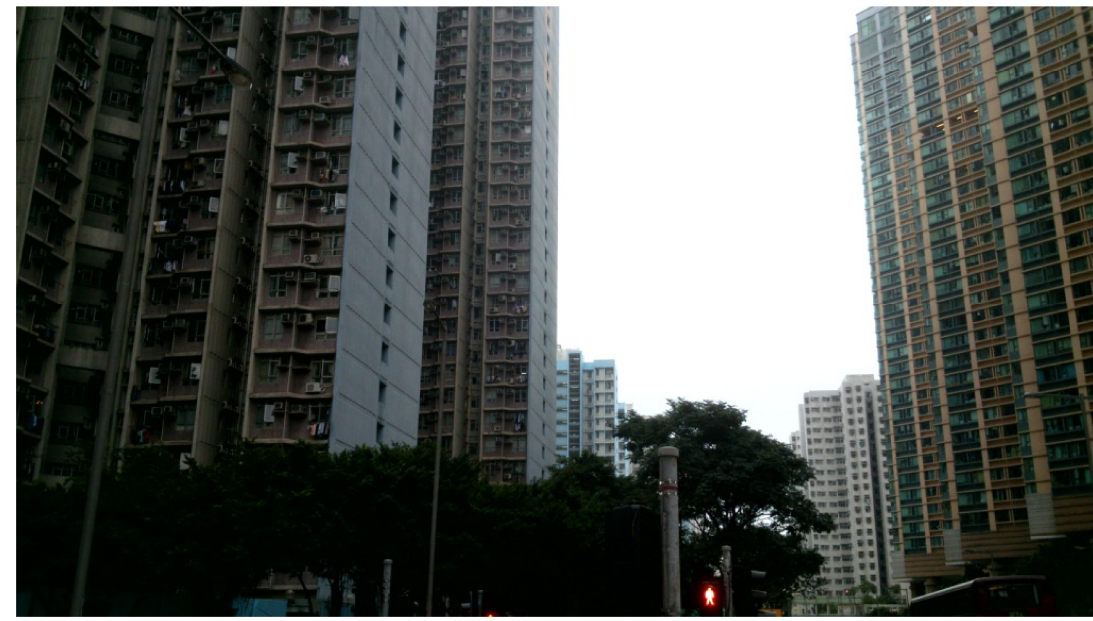
LCA1 Urban Residential