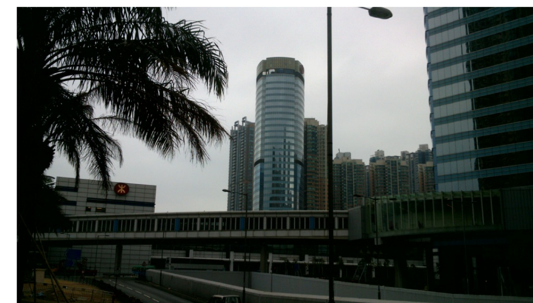
LCA10 Late 20C/Early 21C Commercial/Residential Complex