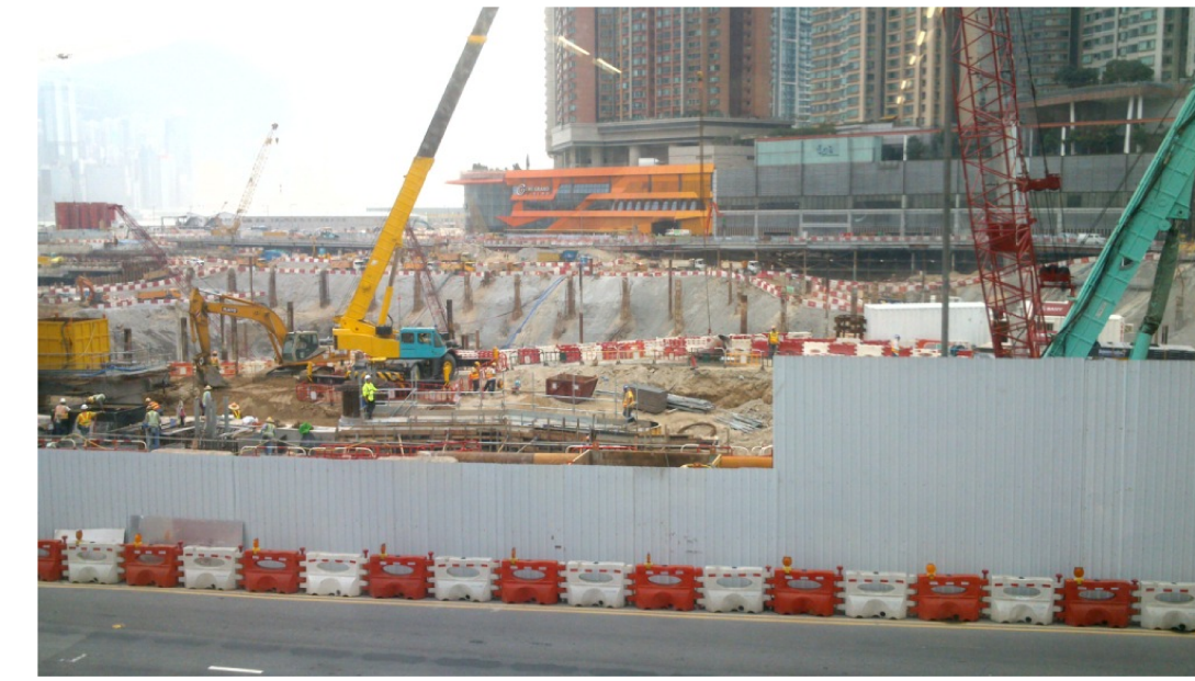
LCA3 - Ongoing Development