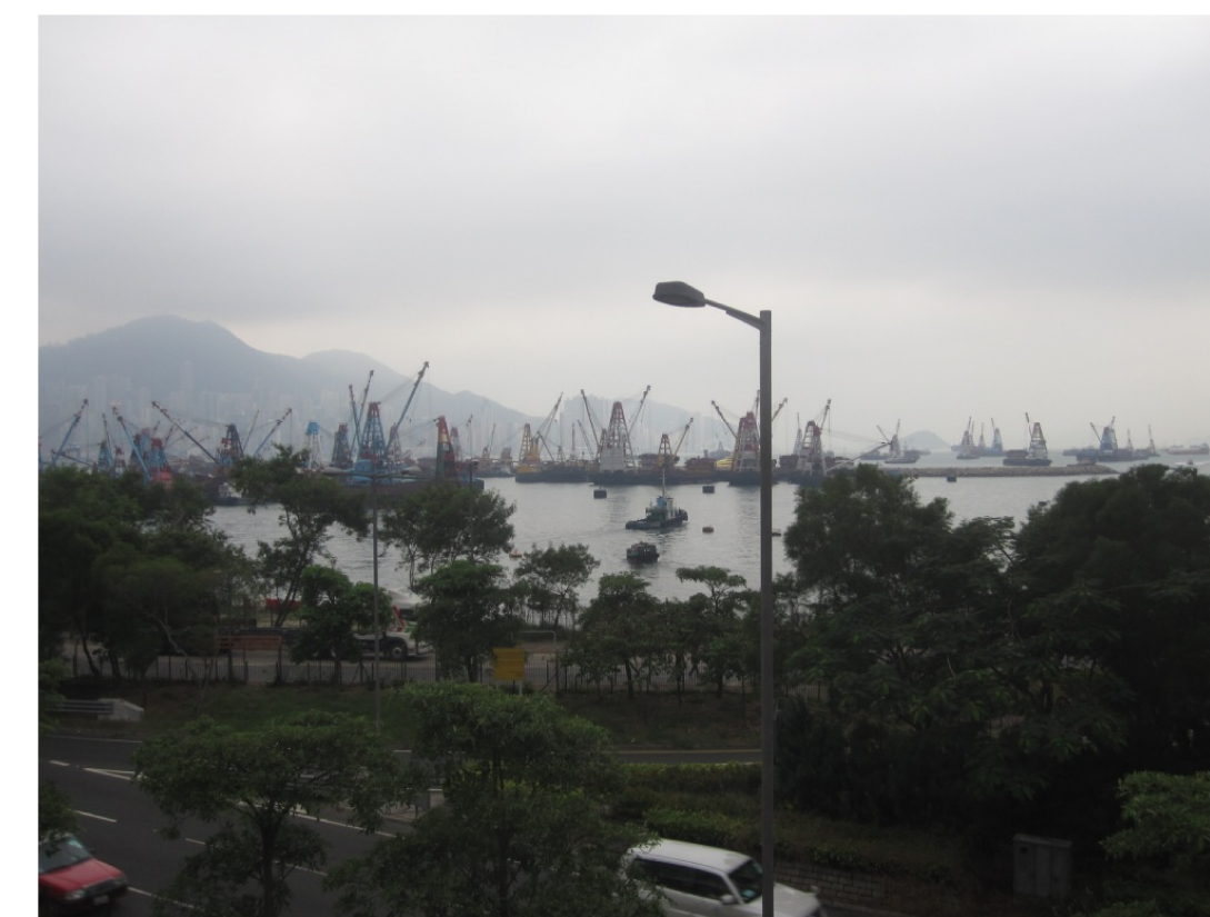
LCA6 Typhoon Shelter