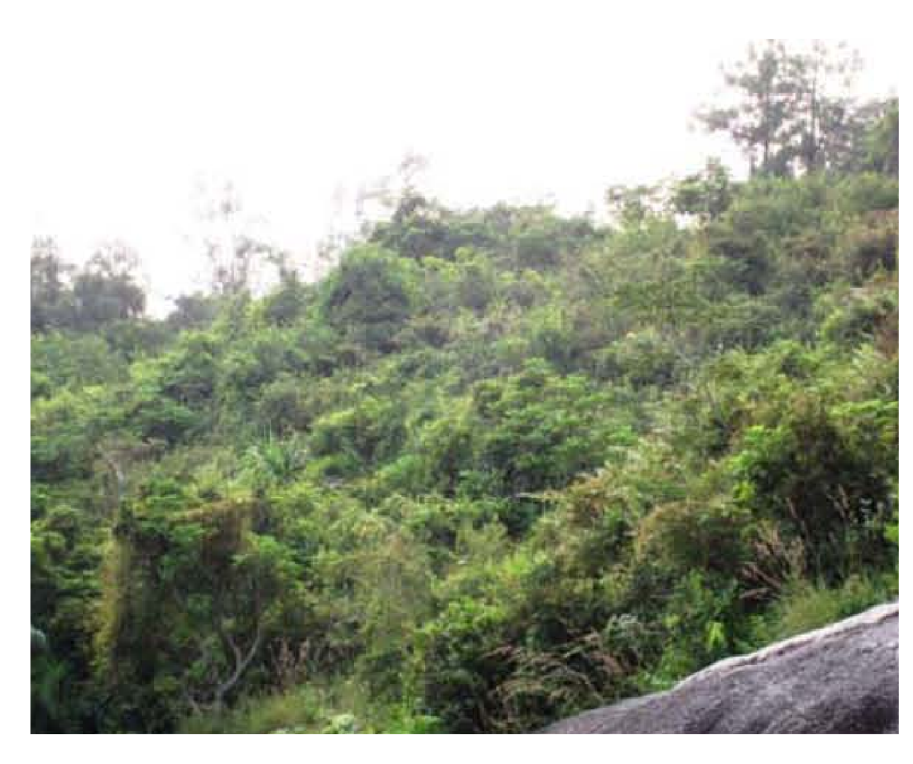
LR2 - Shrubland / LCA2 - Shrubland LCA