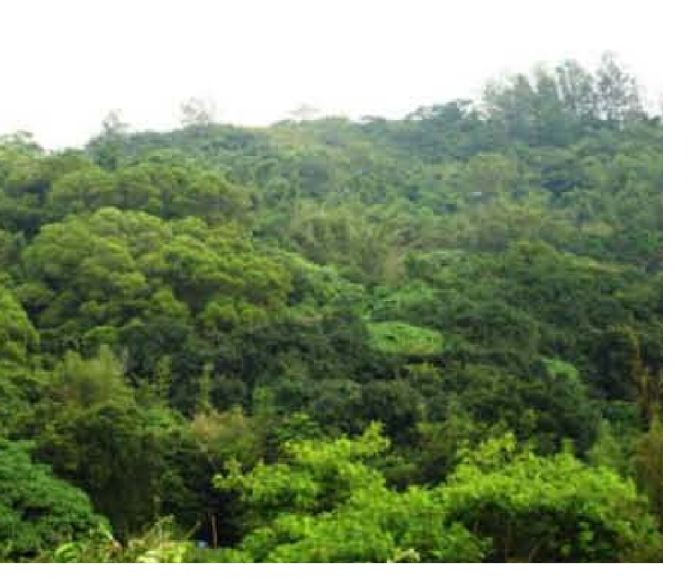
LR3 - Young Woodland

Outlying Islands Sewerage Stage 2 -Upgrading of Cheung Chau Sewage Collection, Treatment and Disposal Facilities