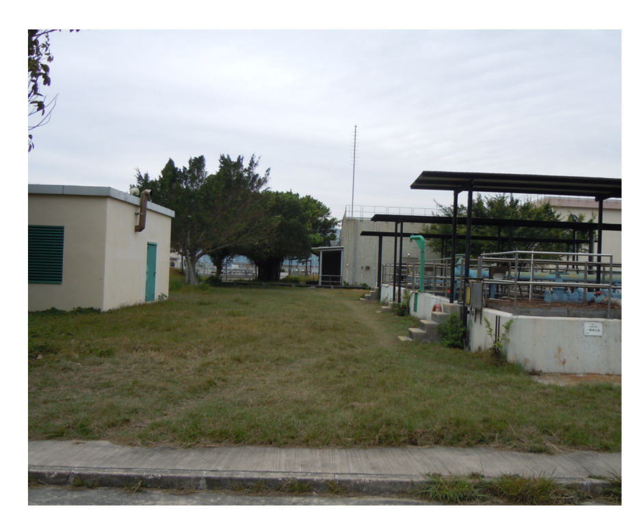
LR1 - Vegetation Within Existing Cheung Chau STW