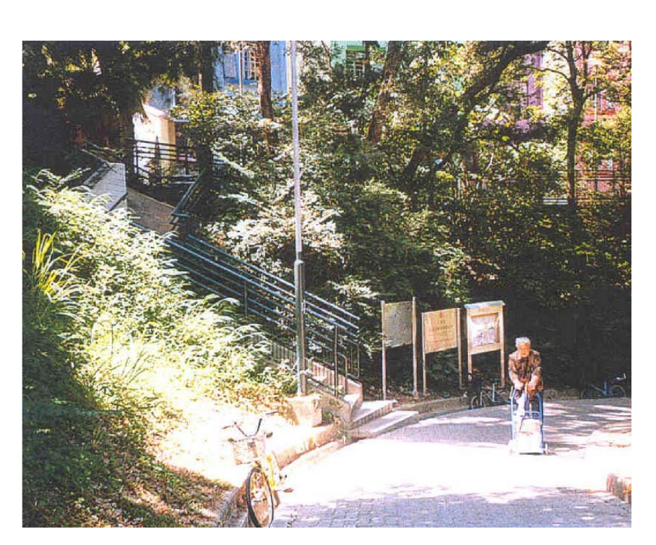
LR6 - Vegetated Slope and Vegetation within Residential Development