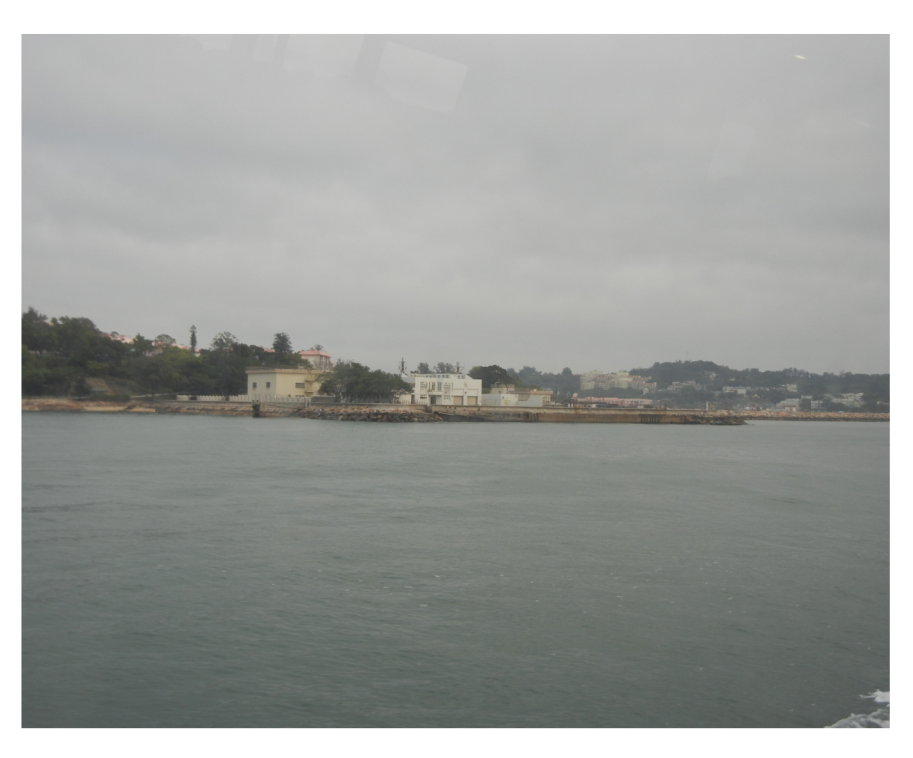
LR5 - Marine / LCA8 - Marine LCA / VSR3 - Adamasta Channel