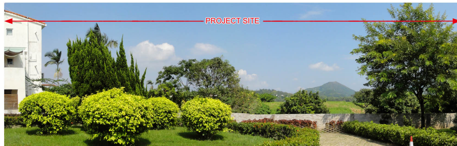
V13 – VIEW FROM NORTHERN FAIRVIEW PARK (VSR NO. R1)