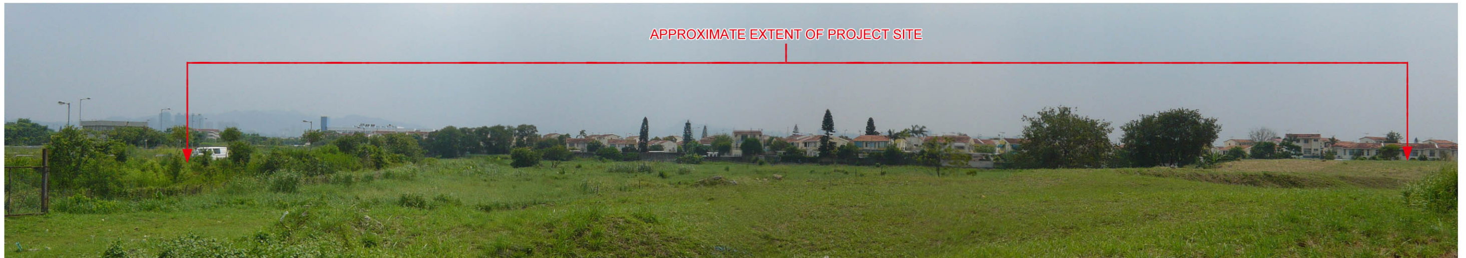
V12 – VIEW FROM COMMERCIAL FARMLAND NORTH OF PROJECT SITE (VSR NO. O3)