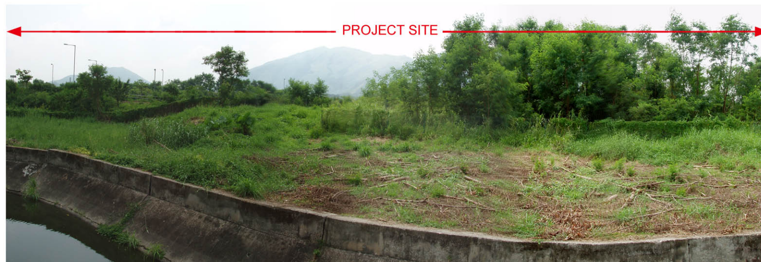
V14 – VIEW FROM NORTH ENTRANCE TO BETHEL HIGH SCHOOL, FAIRVIEW PARK (VSR NO. O2, R1)