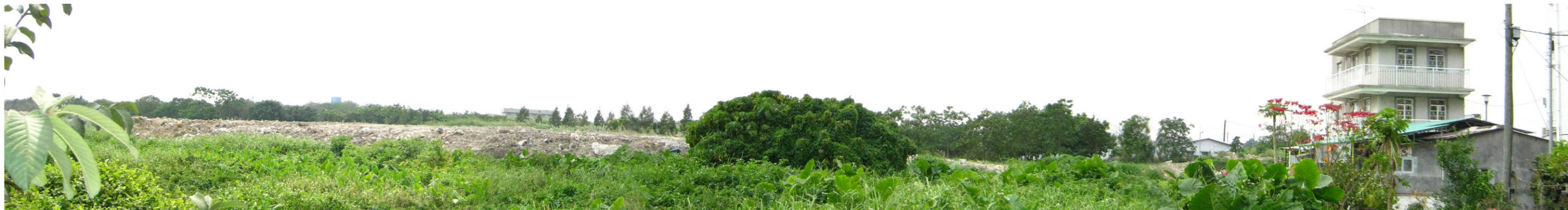
V7 – VIEW FROM CHUK YUEN TSUEN / HANG FOOK GARDEN (VSR NO. R4) - EXISTING SITUATION