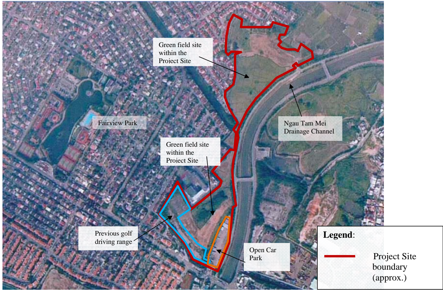
Figure: App 7-2-3

Title: Aerial Photo of the Project Site in Year 2010