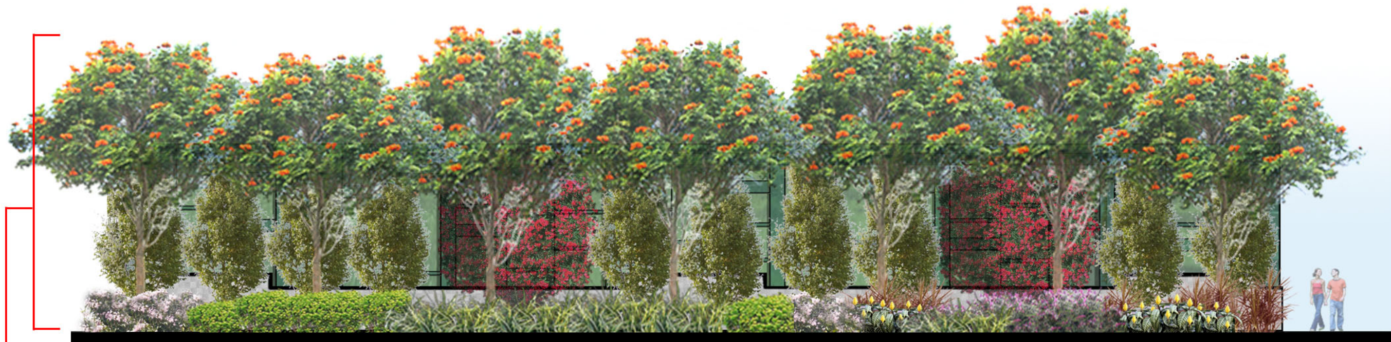
ELEVATION OF NOISE BARRIER WITH LANDSCAPE PLANTING TREATMENT