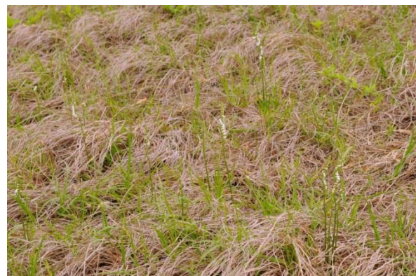
Plate 2.17 Spiranthes hongkongensis (P17)