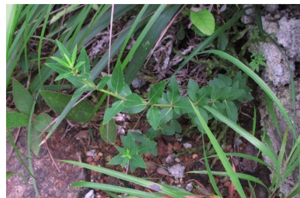
Plate 2.15 Platycodon grandiflorus (P15)