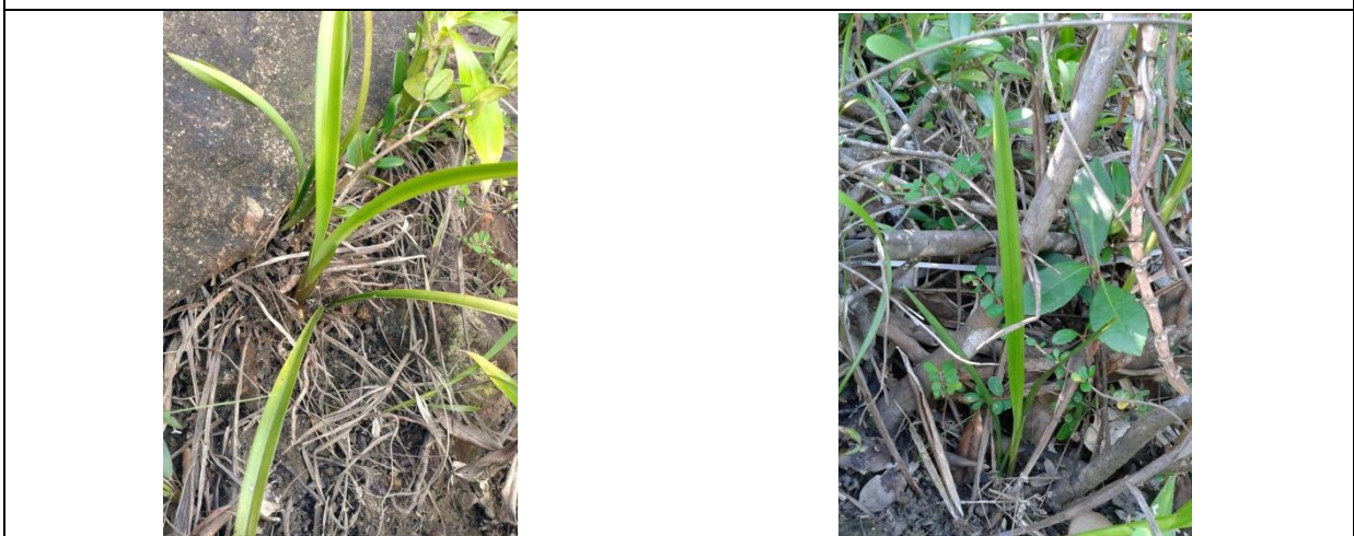
Plate 2.6 Cymbidium ensifolium (P6)