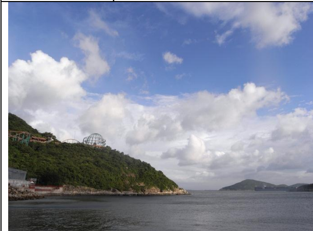
Plate 1.11 Rocky Shore