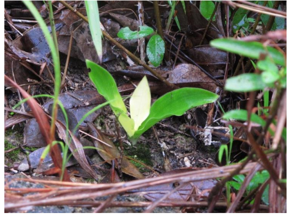
Plate 2.10 Habenaria dentata (P10)