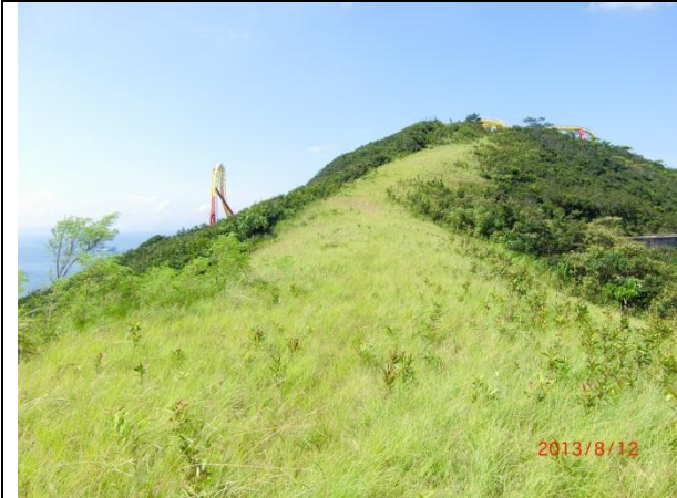
Plate 1.7 Hillside Grassland