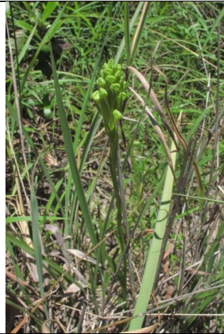
Plate 2.11 Habenaria linguella (P11)