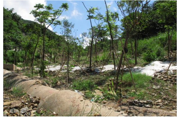
Plate 1.8 Bare Ground (Plantation Reinstatement)