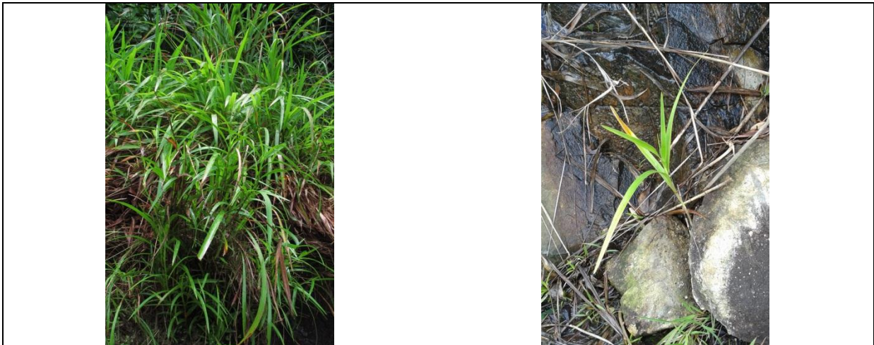
Plate 2.4 Arundina graminifolia (P4)