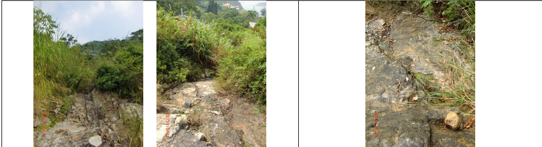
Plate 1.12 Photos of the “Northern Stream”