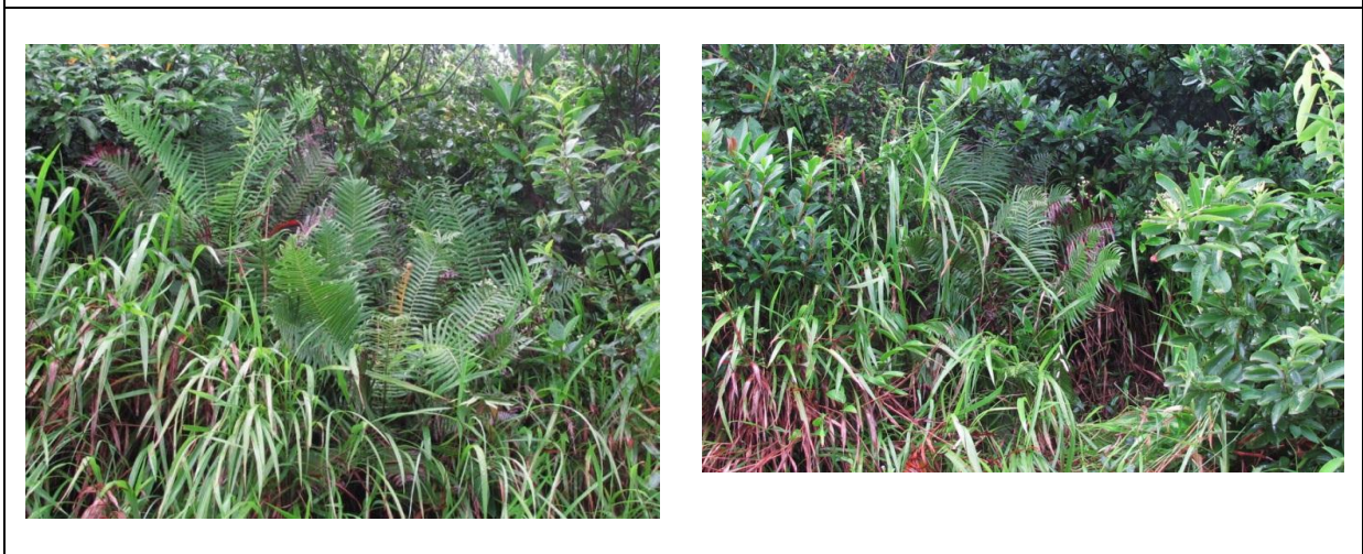
Plate 2.5 Brainea insignis (P5)