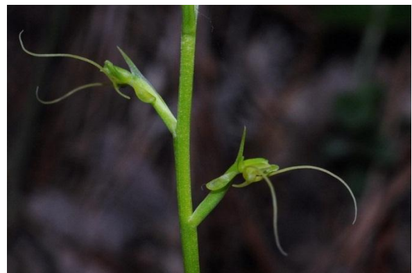
Plate 2.14 Peristylus calcaratus (P14)