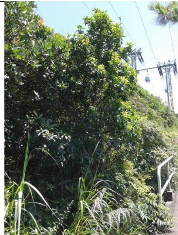
Plate 2.12 Ixonanthes reticulata (P12)