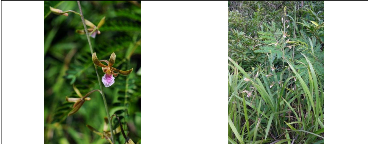
Plate 2.7 Eulophia graminea (P7)