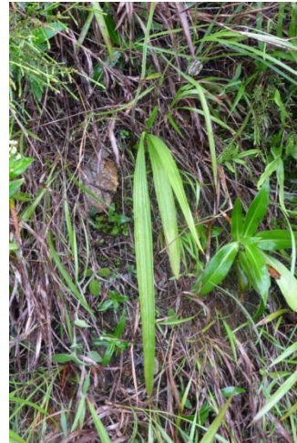
Plate 2.16 Spathoglottis pubescens (P16)