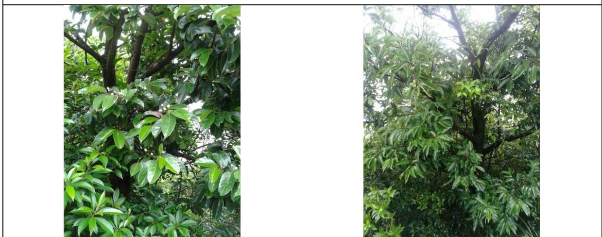
Plate 2.3 Artocarpus hypargyreus (P3)