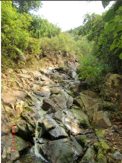
Plate 1.15 Photo of the "Eastern Stream"