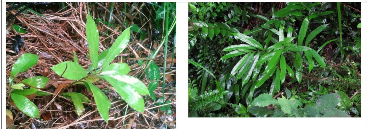
Plate 2.2 Aristolochia thwaitesii (P2)