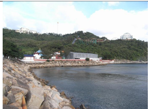
Plate 1.10 Artificial Shore