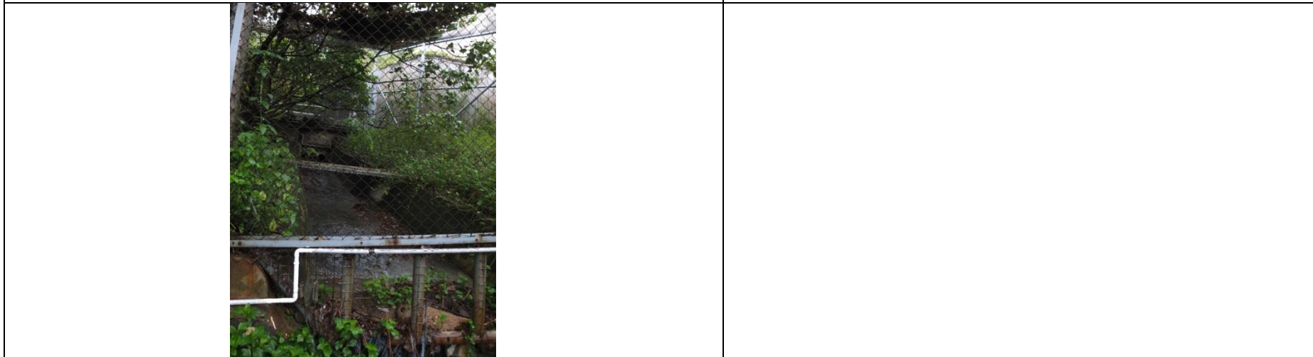
Plate 1.14 Downstream section of “Northern Stream” is modified