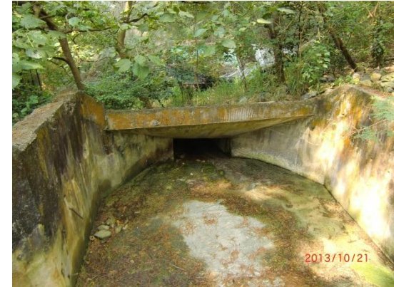
Plate 1.16 Downstream section of "Eastern Stream" is modified by concrete lining and covered