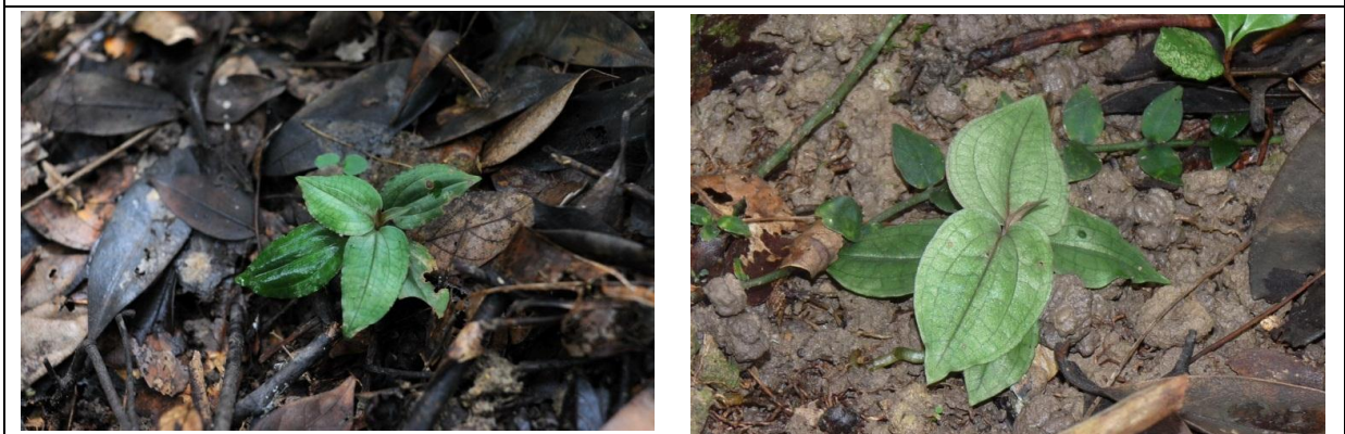
Plate 2.9 Goodyera viridiflora (P9)