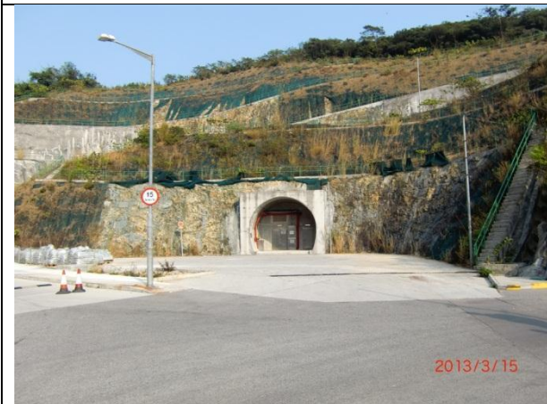
Plate 1.9 Developed Area