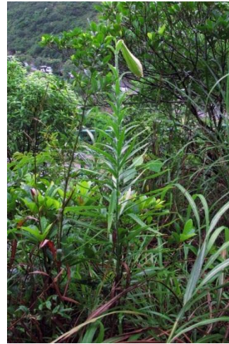
Plate 2.13 Lilium brownii (P13)