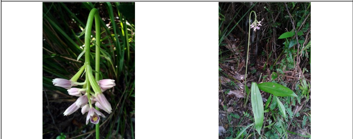
Plate 2.8 Geodorum densiflorum (P8)