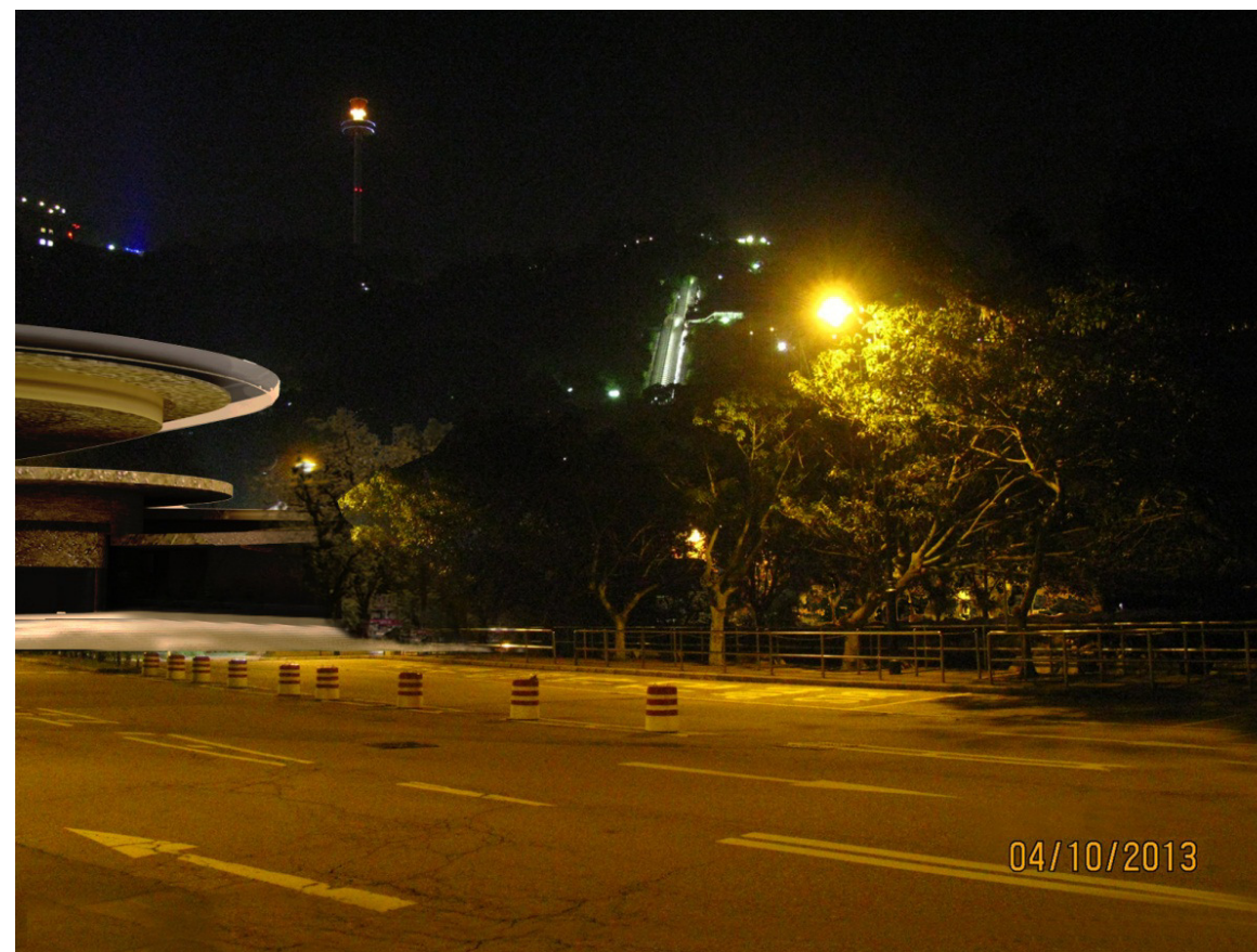
Vantage Point F: Year 10 of operation with mitigation measures (nighttime)