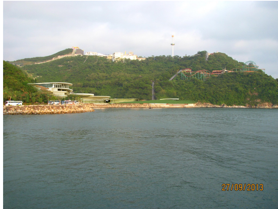
Vantage Point D: Day 1 of operation without mitigation measures