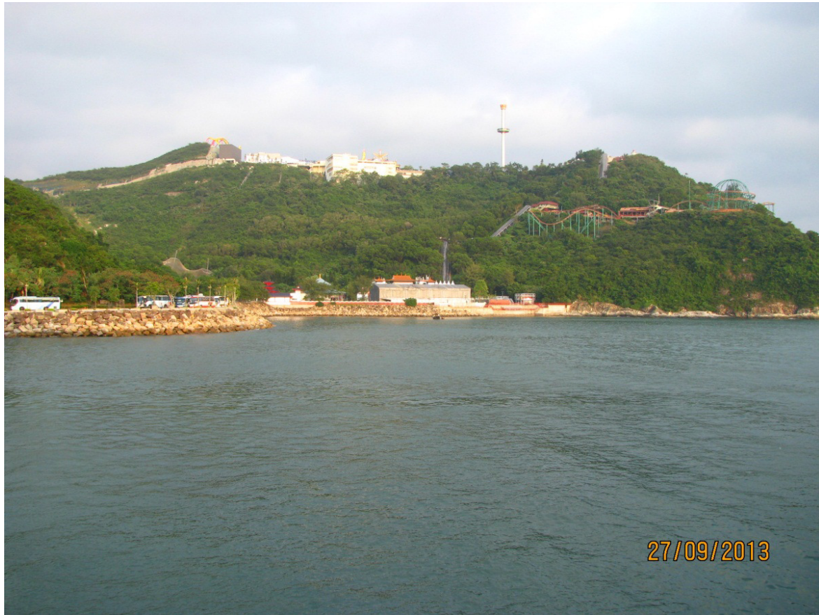
Vantage Point D: Existing view