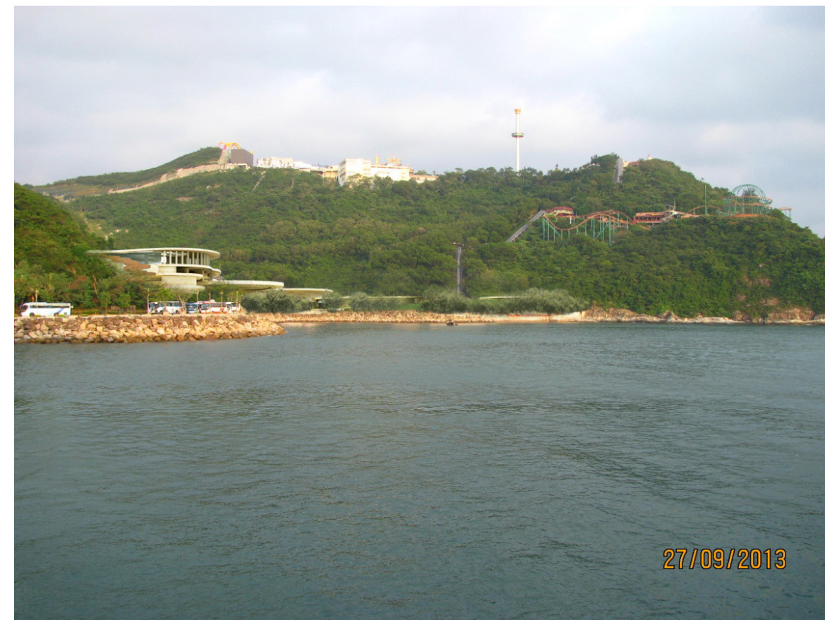
Vantage Point D: Year 10 of operation with mitigation measures