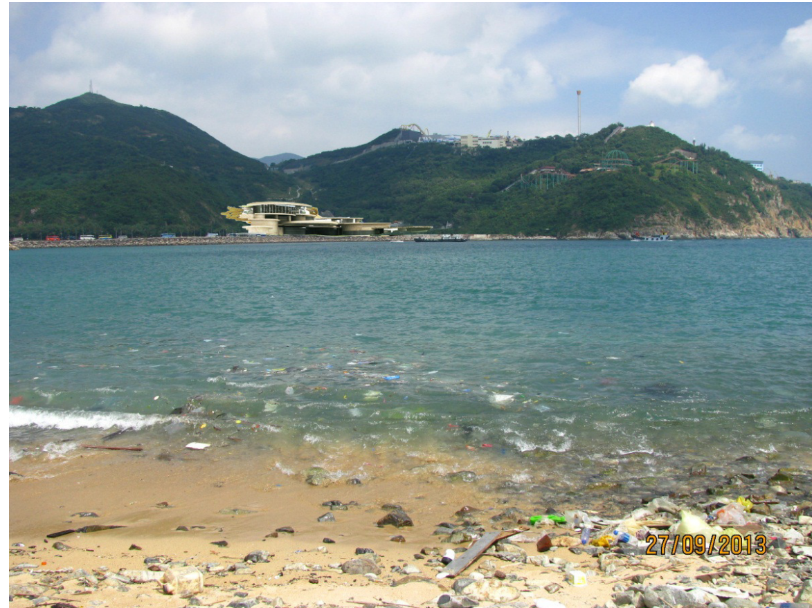
Vantage Point B: Day 1 of operation without mitigation measures