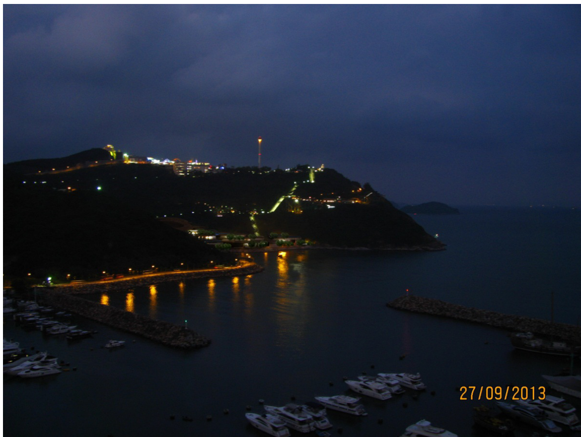
Vantage Point E: Day 1 of operation with mitigation measures (nighttime)