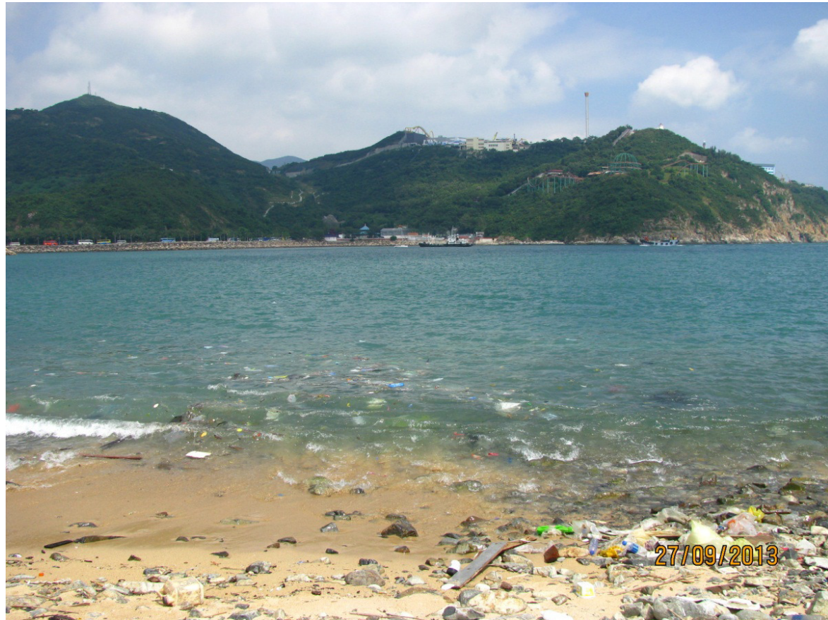
Vantage Point B: Existing view