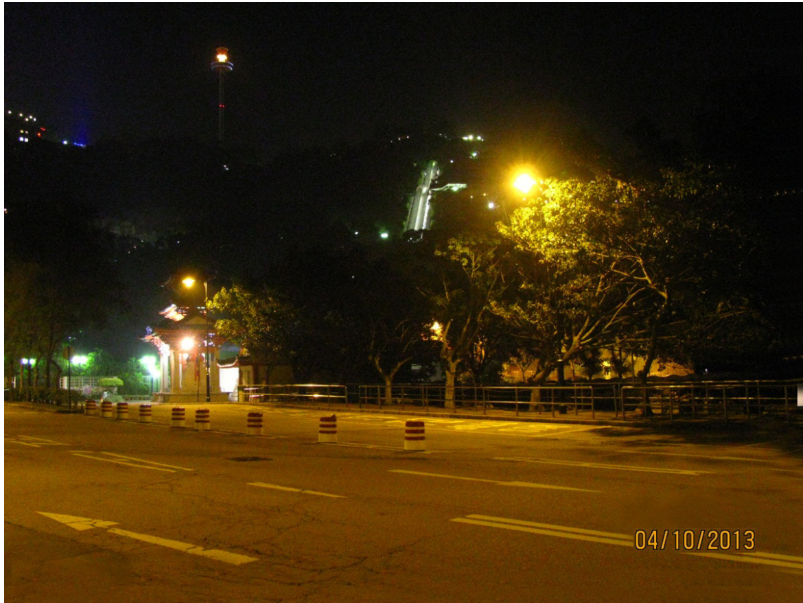
Vantage Point F: Existing view (nighttime)