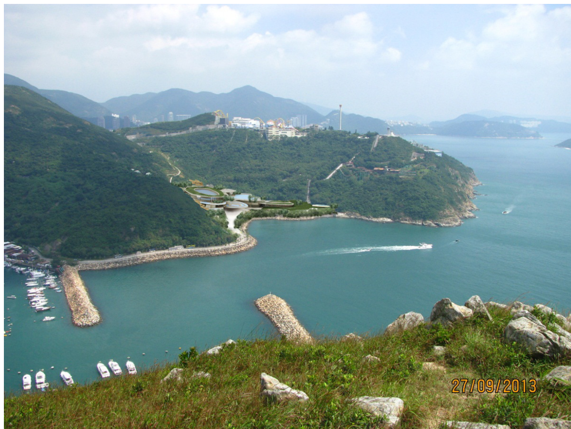
Vantage Point A: Day 1 of operation with mitigation measures