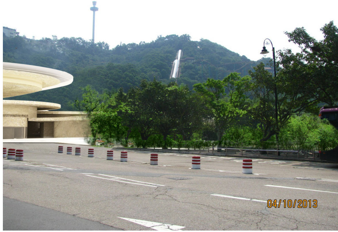
Vantage Point F: Year 10 of operation with mitigation measures (daytime)