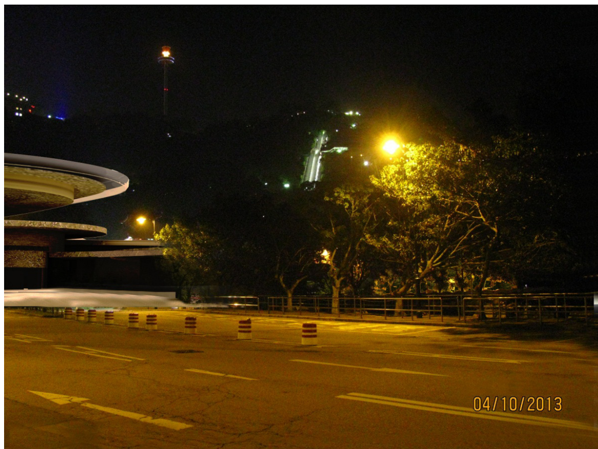
Vantage Point F: Day 1 of operation with mitigation measures (nighttime)