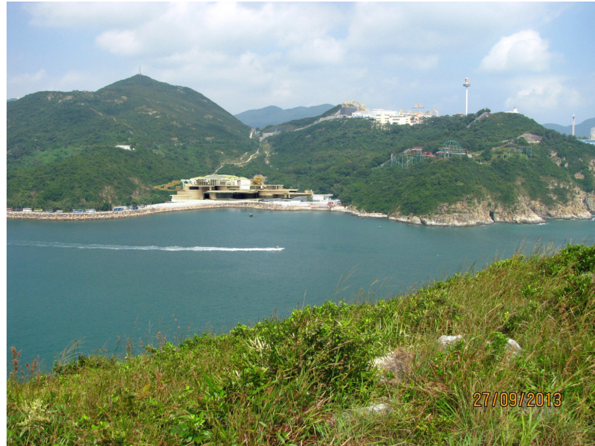
Vantage Point C: Day 1 of operation without mitigation measures