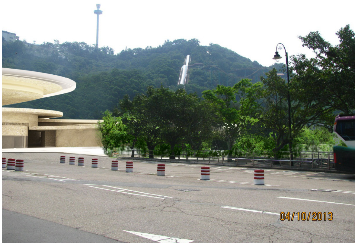
Vantage Point F: Day 1 of operation with mitigation measures (daytime)