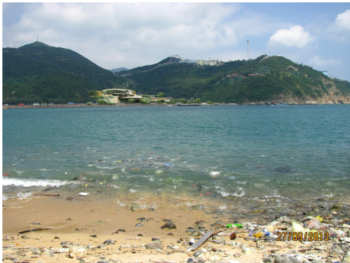
Vantage Point B: Day 1 of operation with mitigation measures