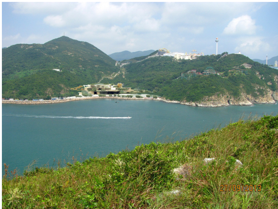
Vantage Point C: Day 1 of operation with mitigation measures