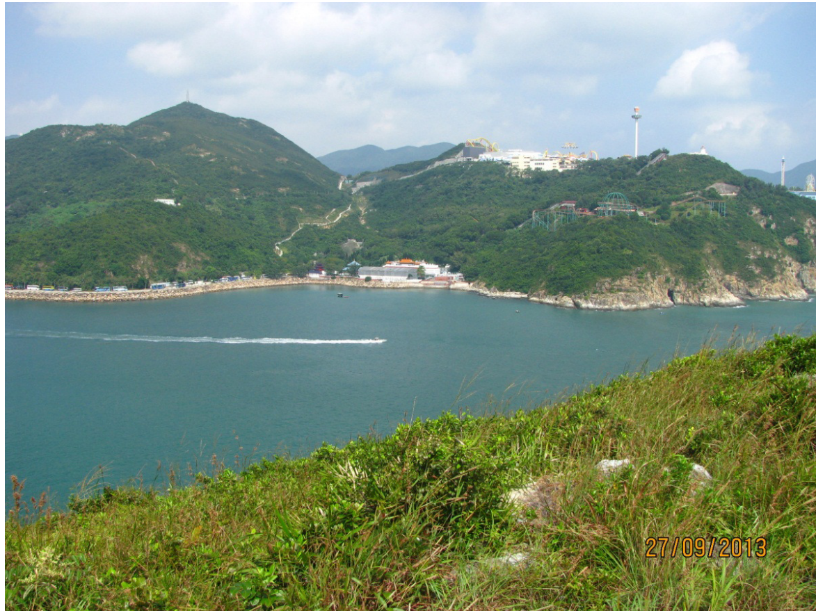
Vantage Point C: Existing view