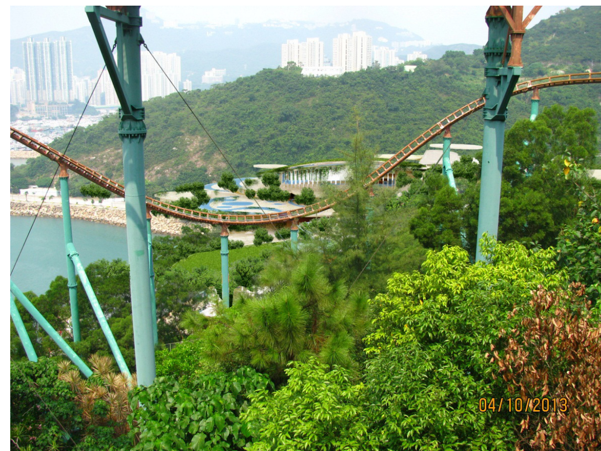
Vantage Point G: Year 10 of operation with mitigation measures (daytime)