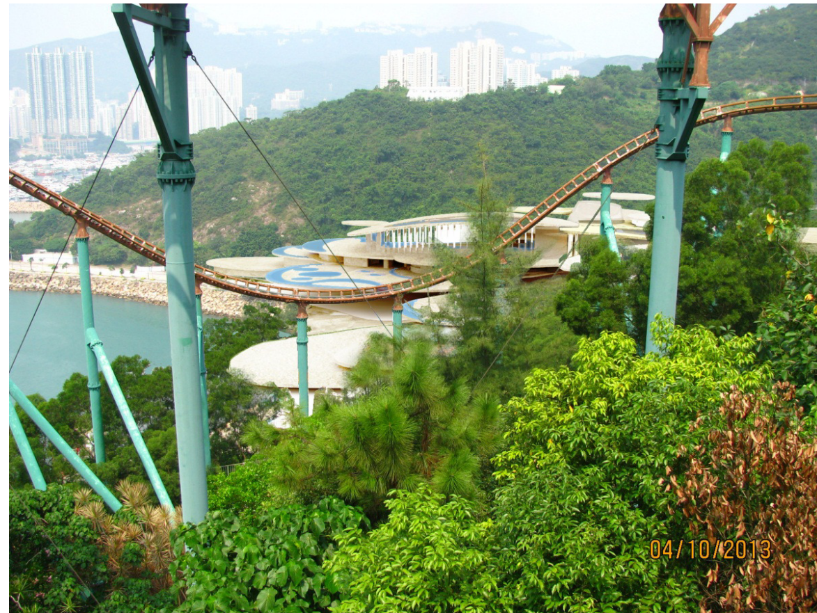
Vantage Point G: Day 1 of operation without mitigation measures (daytime)