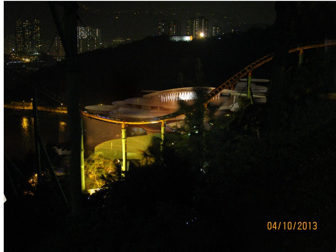
Vantage Point G: Day 1 of operation without mitigation measures (nighttime)