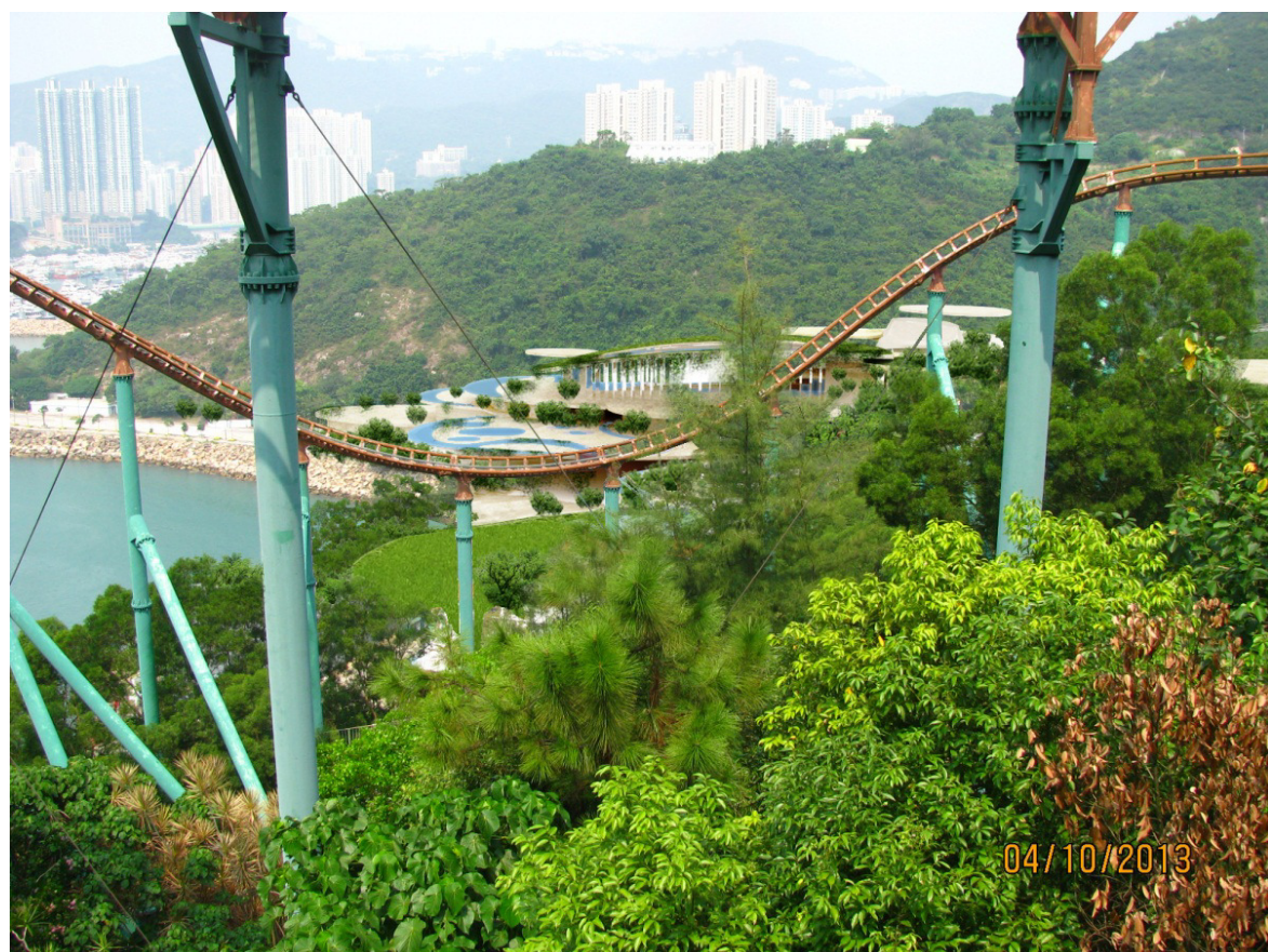
Vantage Point G: Day 1 of operation with mitigation measures (daytime)