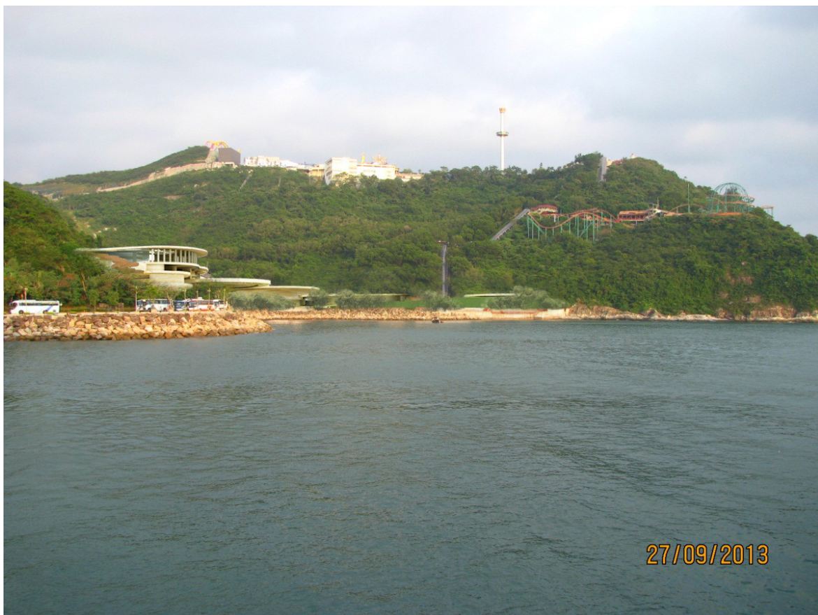
Vantage Point D: Day 1 of operation with mitigation measures