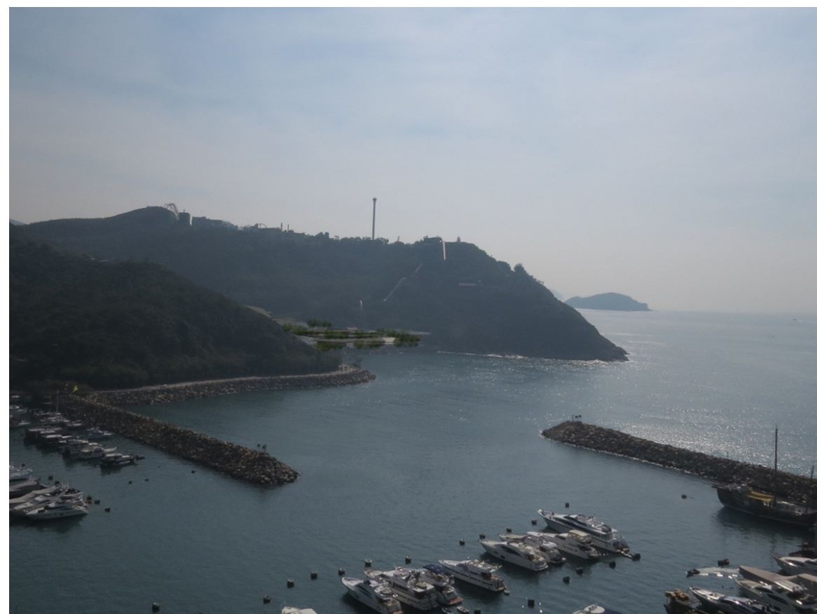
Vantage Point E: Day 1 of operation with mitigation measures (daytime)