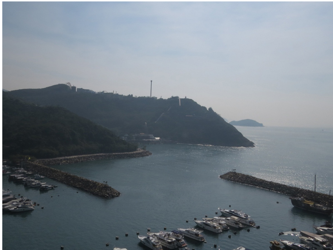
Vantage Point E: Existing view (daytime)