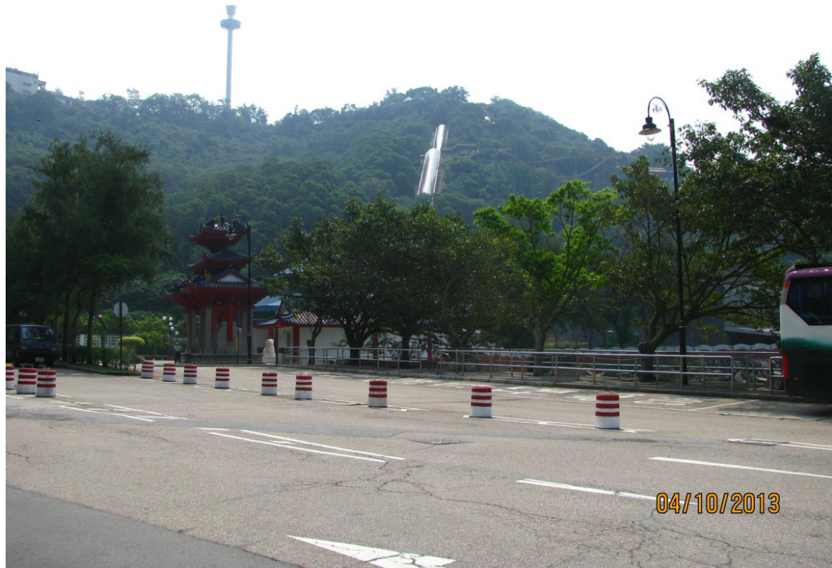
Vantage Point F: Existing view (daytime)