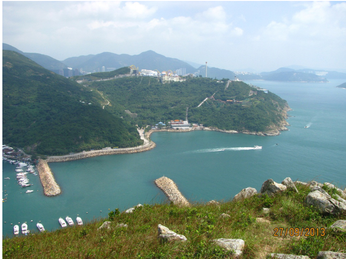
Vantage Point A: Existing view