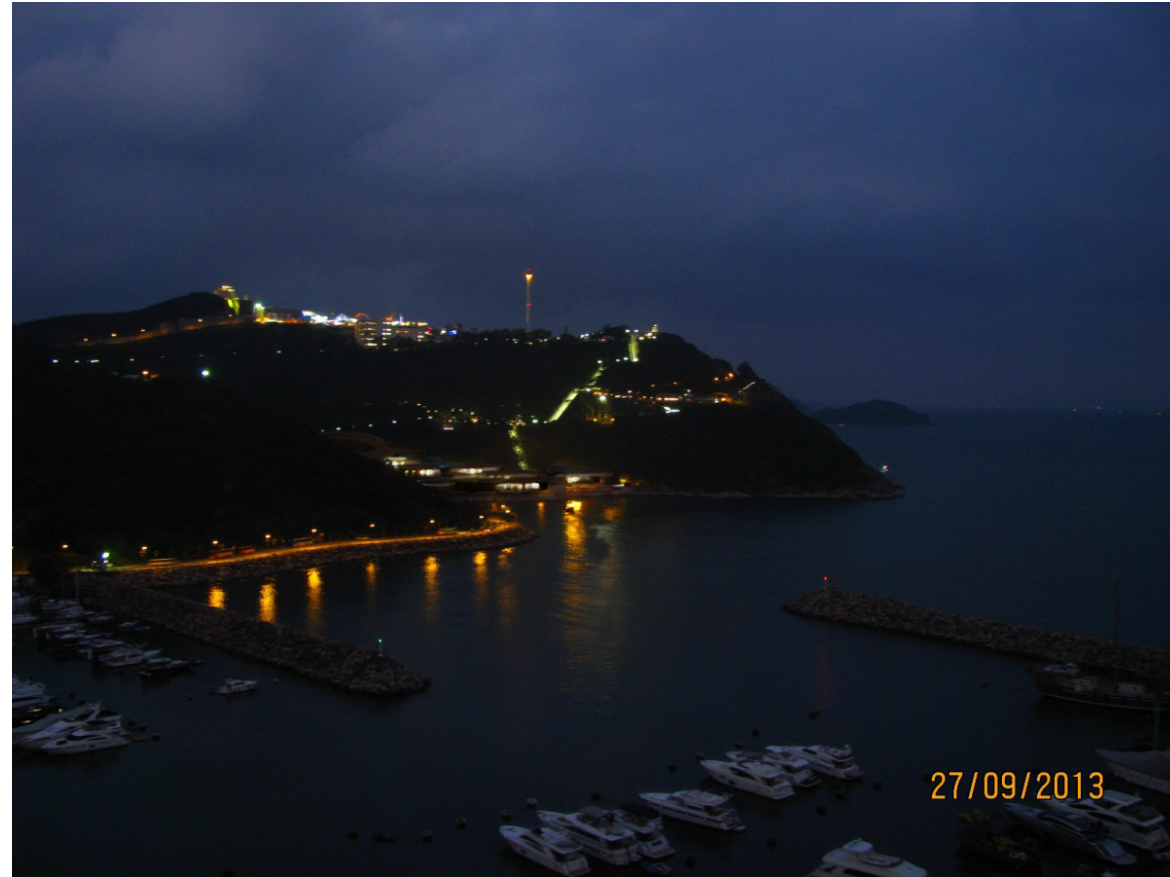
Vantage Point E: Day 1 of operation without mitigation measures (nighttime)