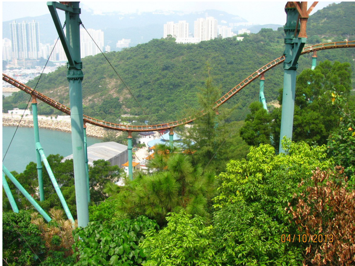
Vantage Point G: Existing view (daytime)