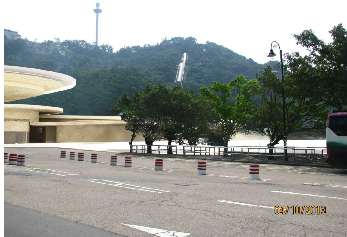
Vantage Point F: Day 1 of operation without mitigation measures (daytime)