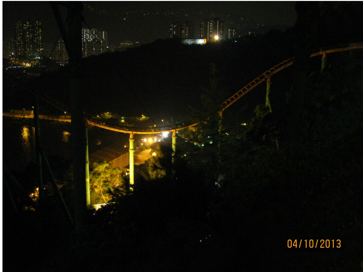
Vantage Point G: Existing view (nighttime)