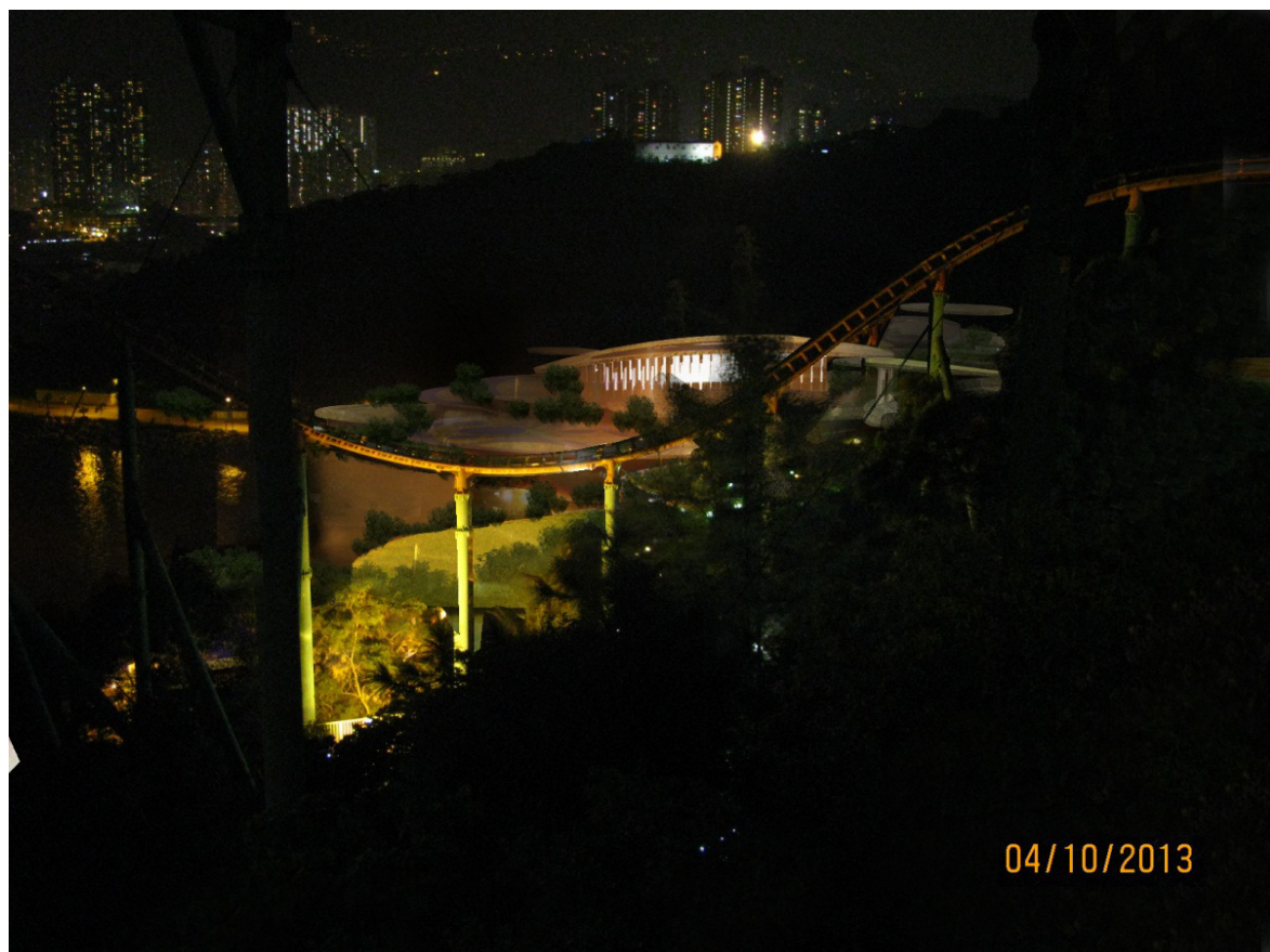
Vantage Point G: Day 1 of operation with mitigation measures (nighttime)