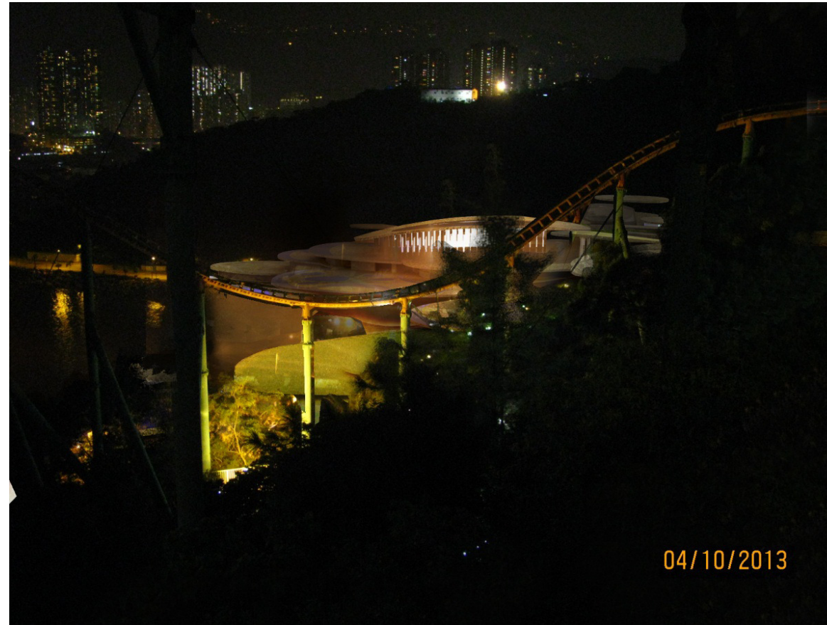
Vantage Point G: Day 1 of operation without mitigation measures (nighttime)