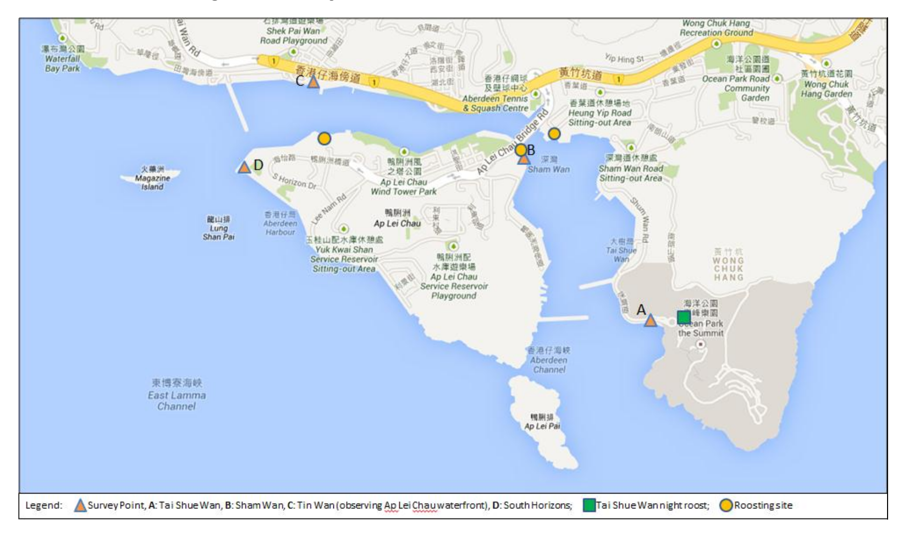
Figure 1 Survey locations along Aberdeen Channel