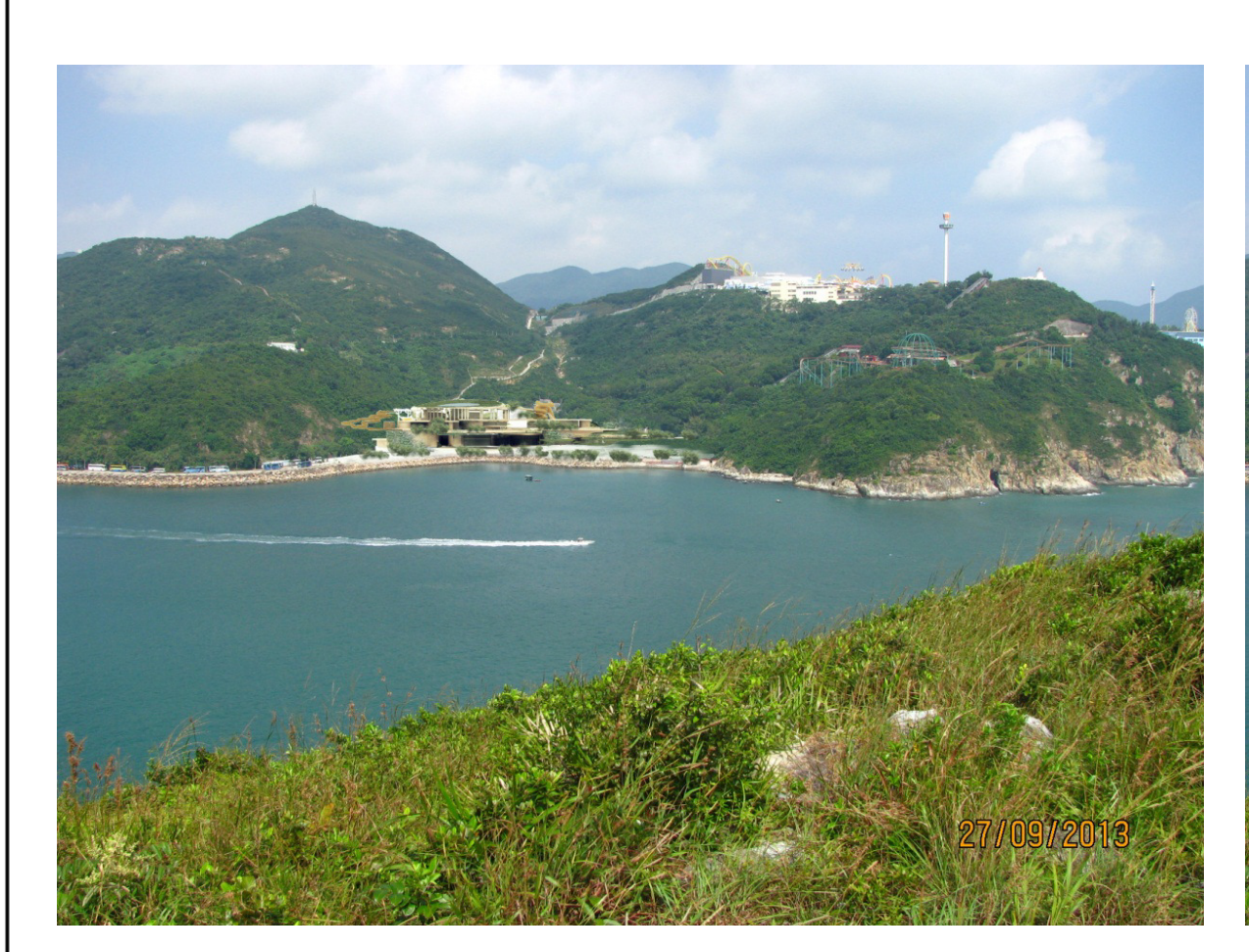
Vantage Point C: Day 1 of operation with mitigation measures