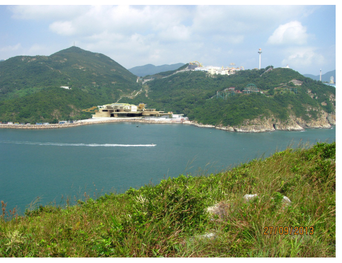
Vantage Point C: Day 1 of operation without mitigation measures