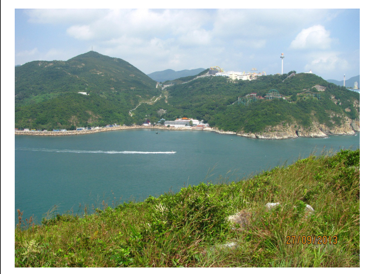
Vantage Point C: Existing view