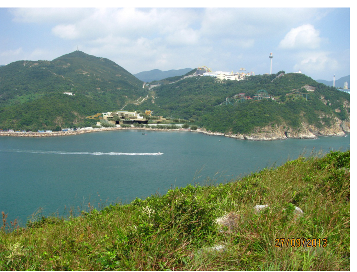
Vantage Point C: Year 10 of operation with mitigation measures