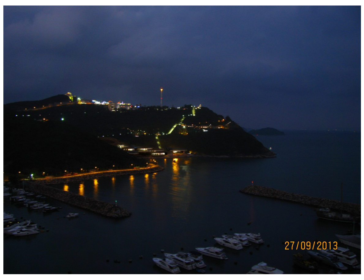
Vantage Point E: Day 1 of operation without mitigation measures (nighttime)