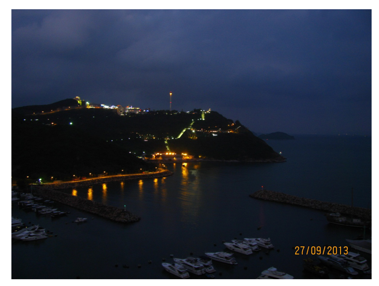
Vantage Point E: Existing view (nighttime)