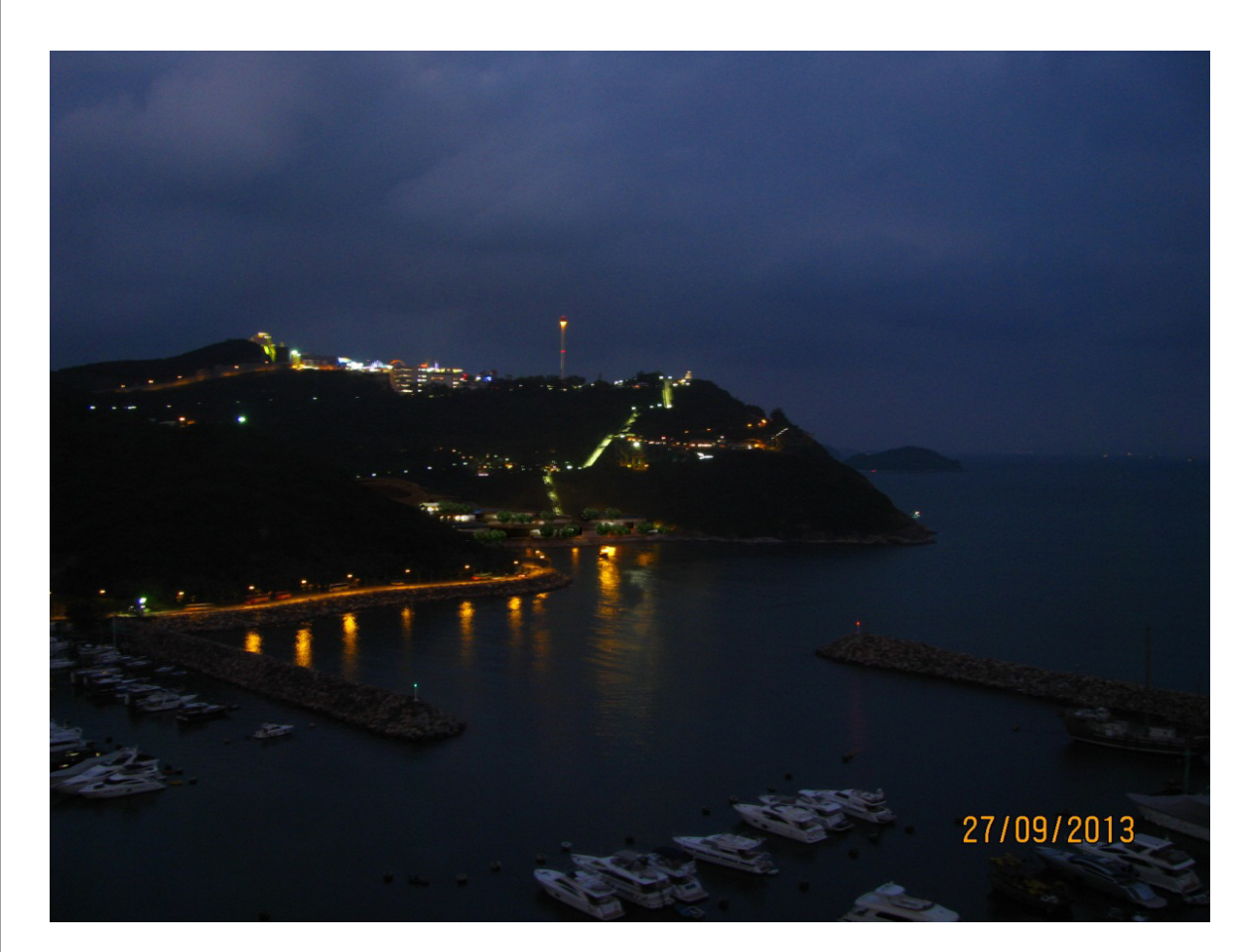
Vantage Point E: Day 1 of operation with mitigation measures (nighttime)