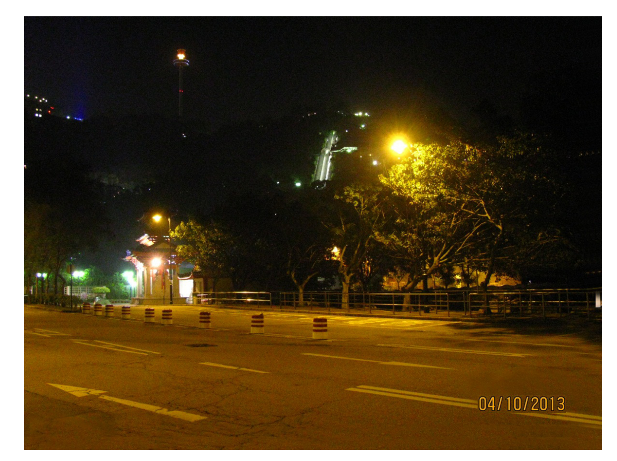
Vantage Point F: Existing view (nighttime)