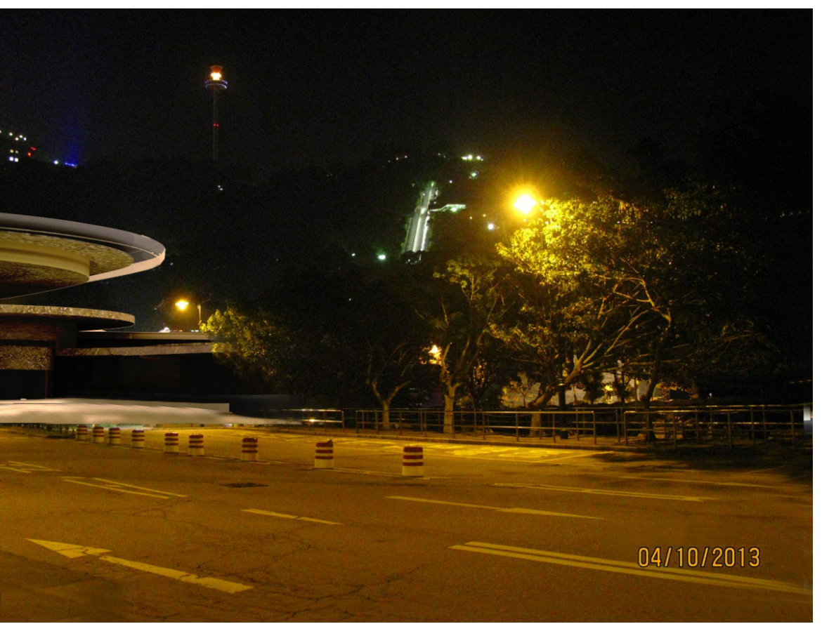
Vantage Point F: Day 1 of operation without mitigation measures (nighttime)