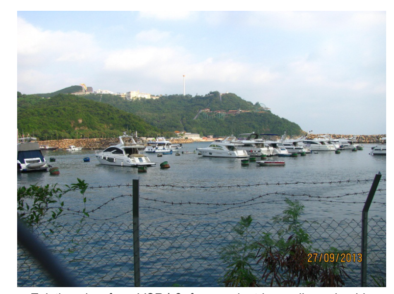
Existing view from VSR4.2: from pedestrian walkway beside roundabout at the end of Ap Lei Chau Praya Road