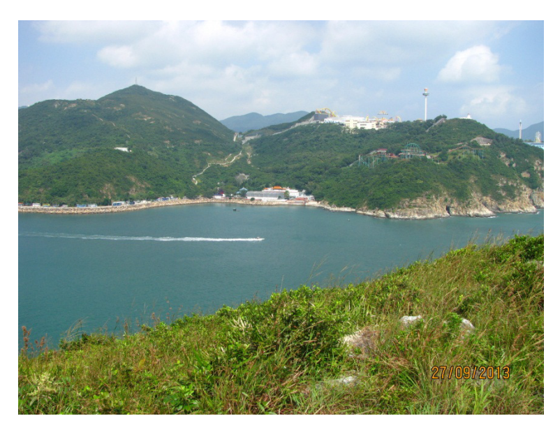
Existing view from VSR3.4: from the hill top of Ap Lei Pai