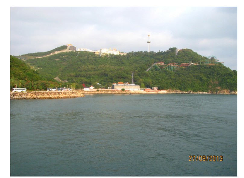
Existing view from VSR4.3: from the end of the southern breakwater in Aberdeen South Typhoon Shelter