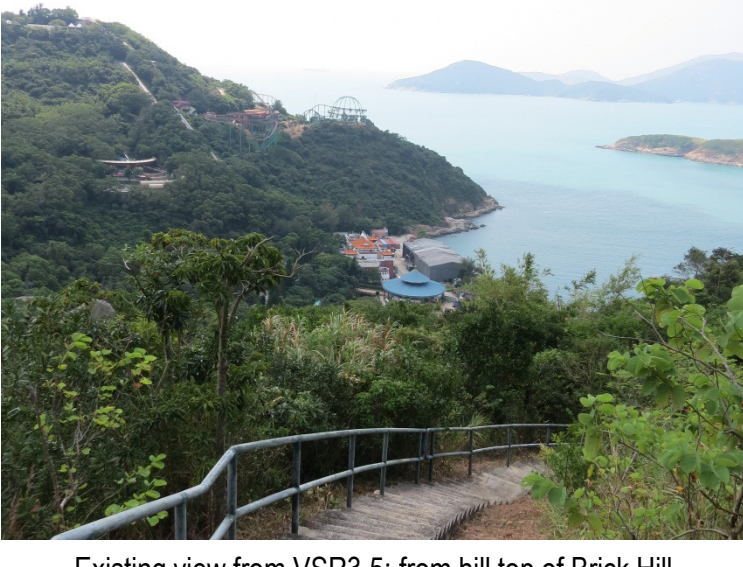
Existing view from VSR3.5: from hill top of Brick Hill