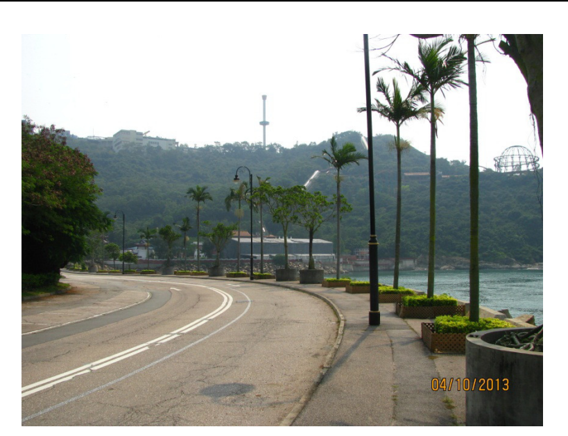
Existing view from VSR4.1: from pedestrian walkway of Shum Wan Road