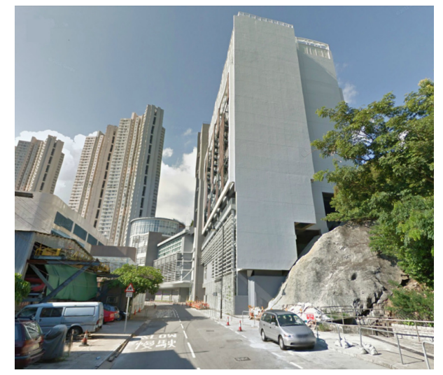
Victoria Shanghai Academy