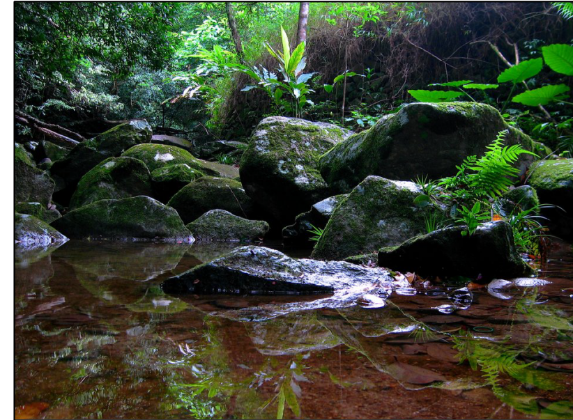
LR5.1 Natural Stream at the east boundary of the ARQ