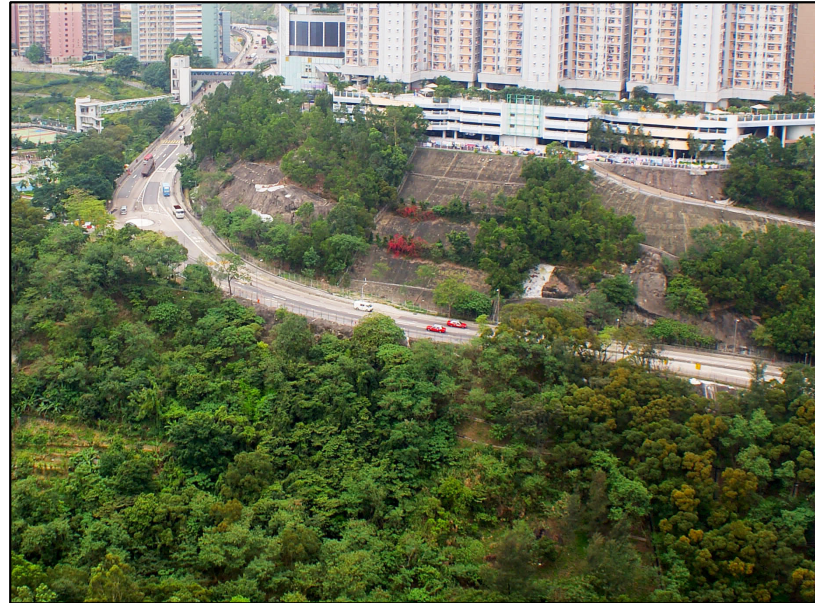
LR3.1 Engineered Slope along with Semi-natural Dense Hillside Vegetation