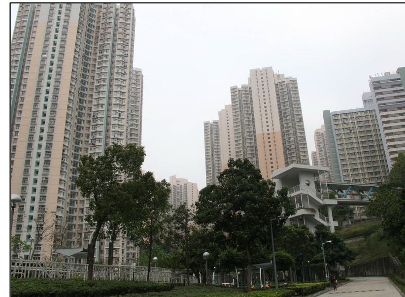
LR6 Urban Development Area