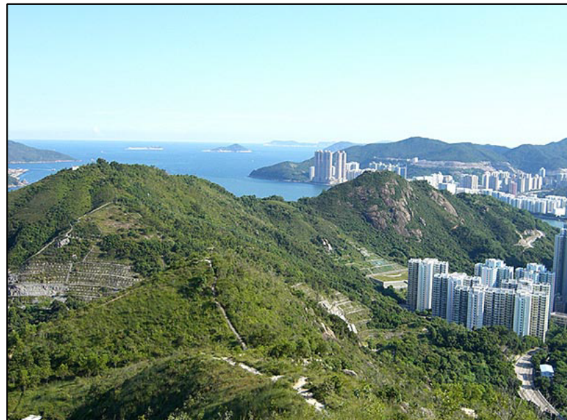
LR4 Hillside Grassland / Shrubland