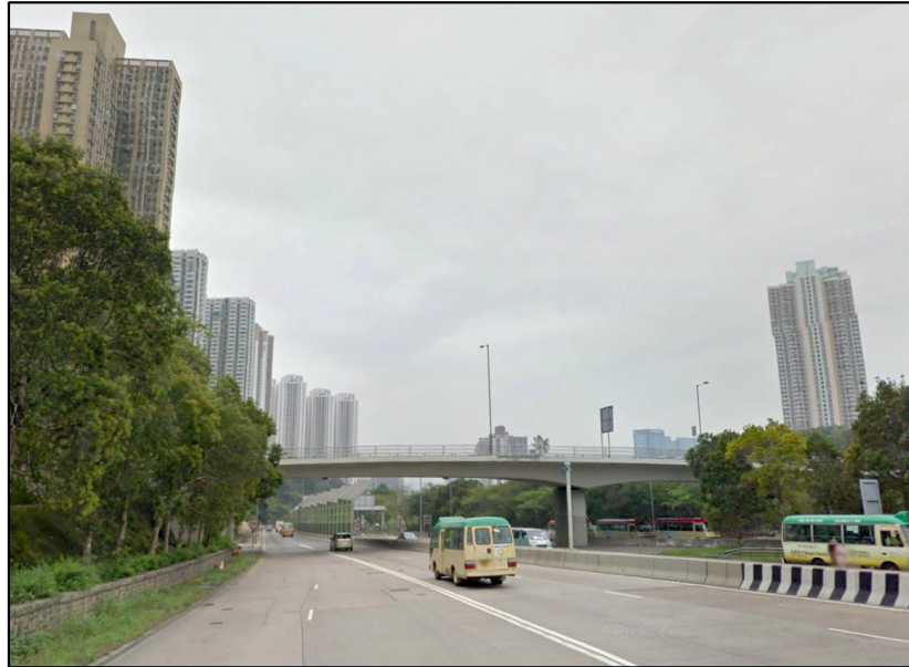
LR1 Major Transport Route