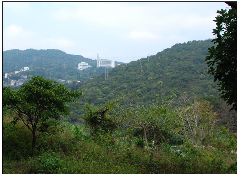
LR2 Hillside Woodland