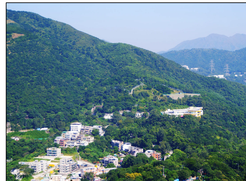
LR7 Rural Development Area