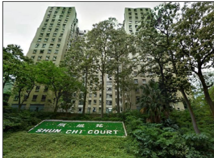
R1.5 SHUN CHI COURT