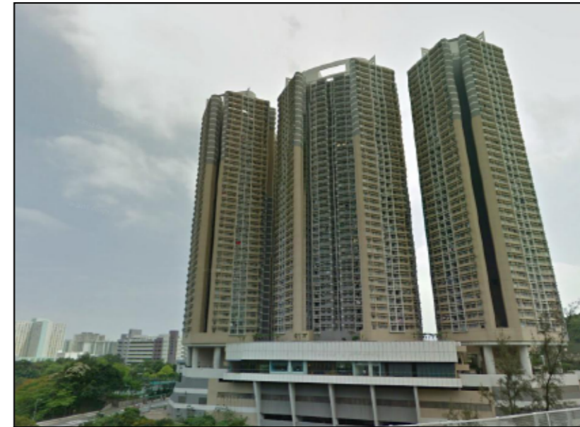
R1.7 SHUN LEE DISCIPLINED SERVICES QUARTERS