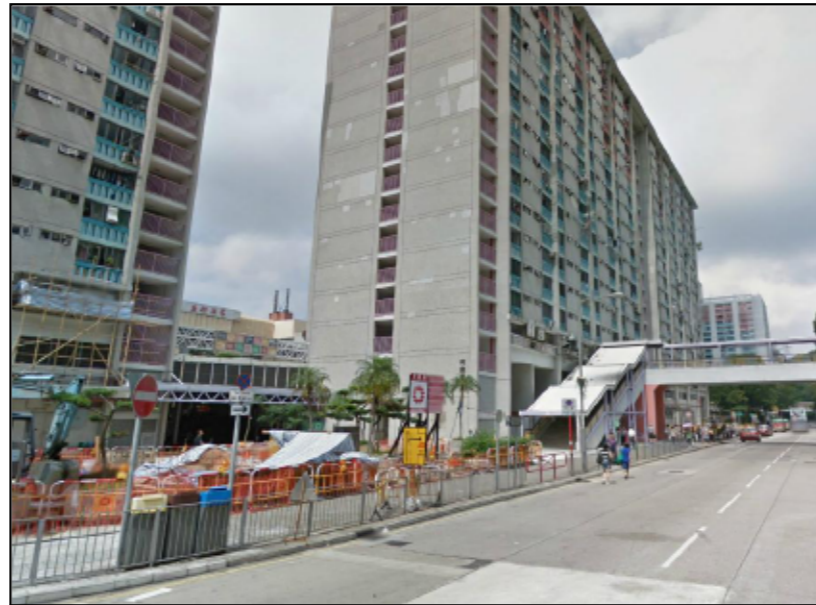
R1.4 SHUN LEE ESTATE