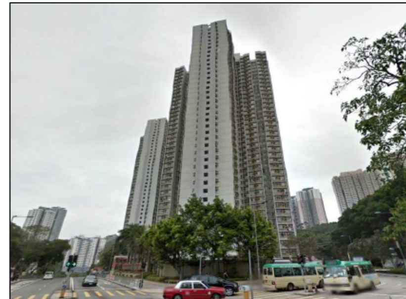
R1.8 HIU LAI COURT