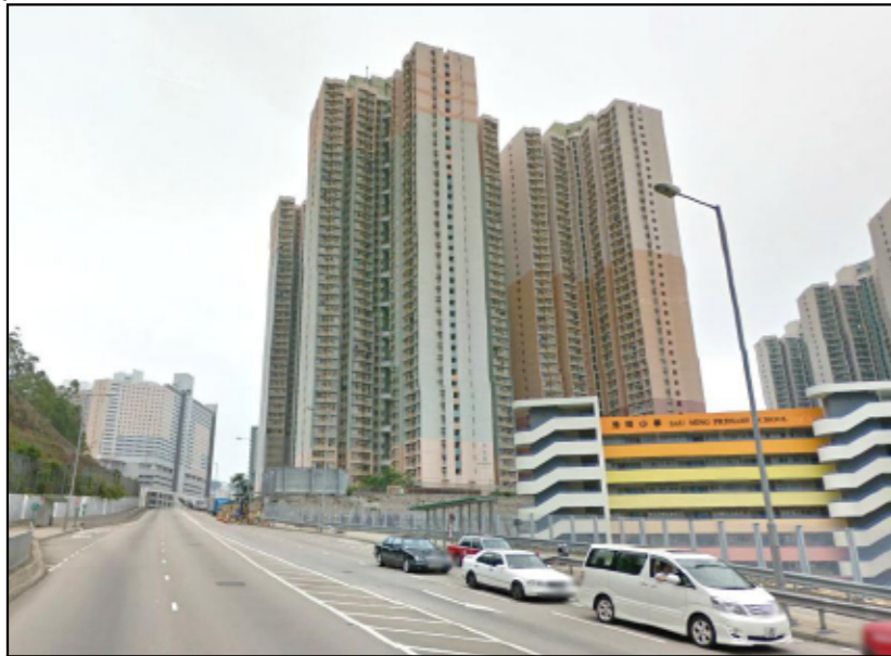
R1.1 SAU MAU PING ESTATE