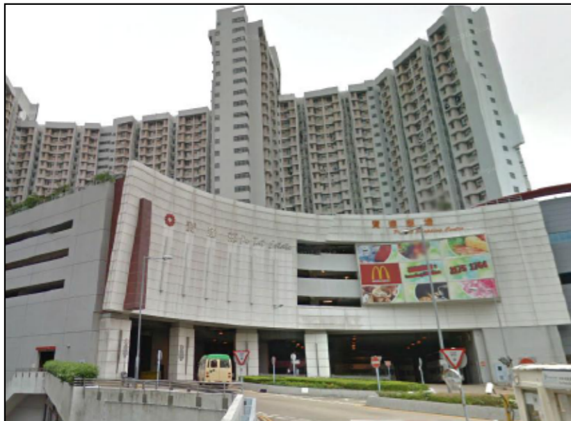
R1.2 PO TAT ESTATE