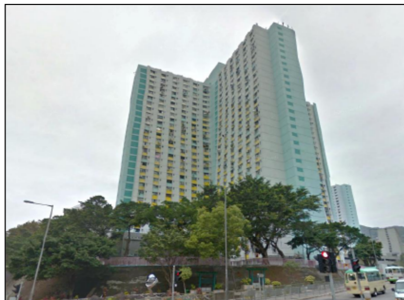
R1.6 SHUN ON ESTATE