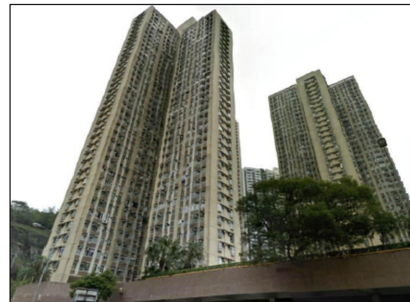
R1.9 HING TIN ESTATE AND HONG WAH COURT