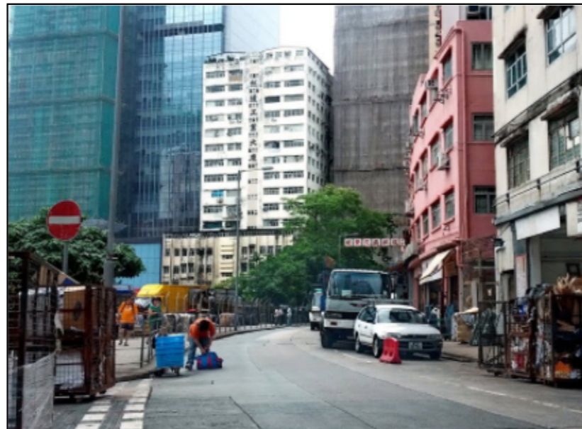
R2.7 MEDIUM-RISE RESIDENTIAL DEVELOPMENTS AT SAN PO KONG