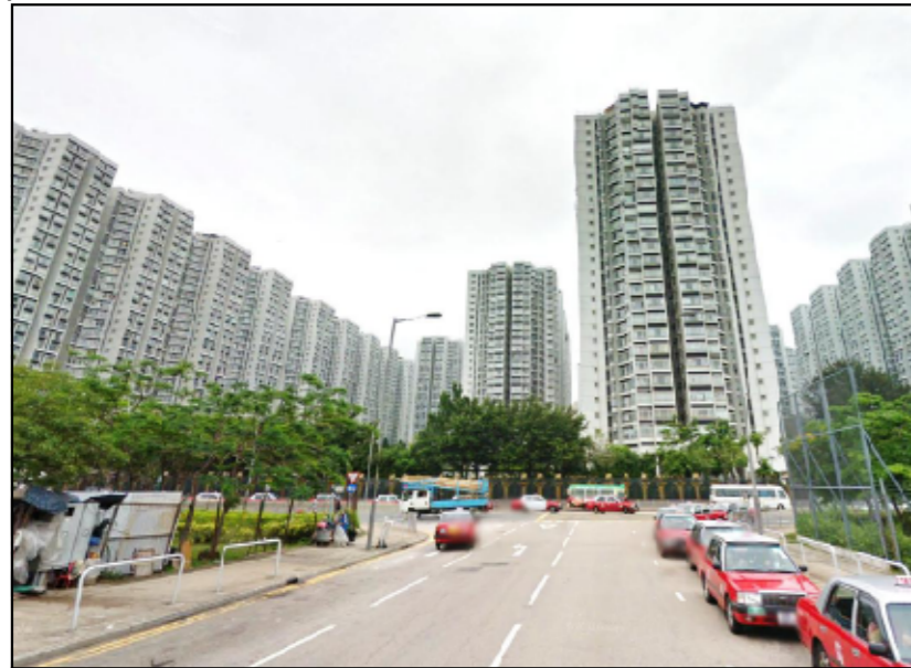
R2.3 LAGUNA CITY