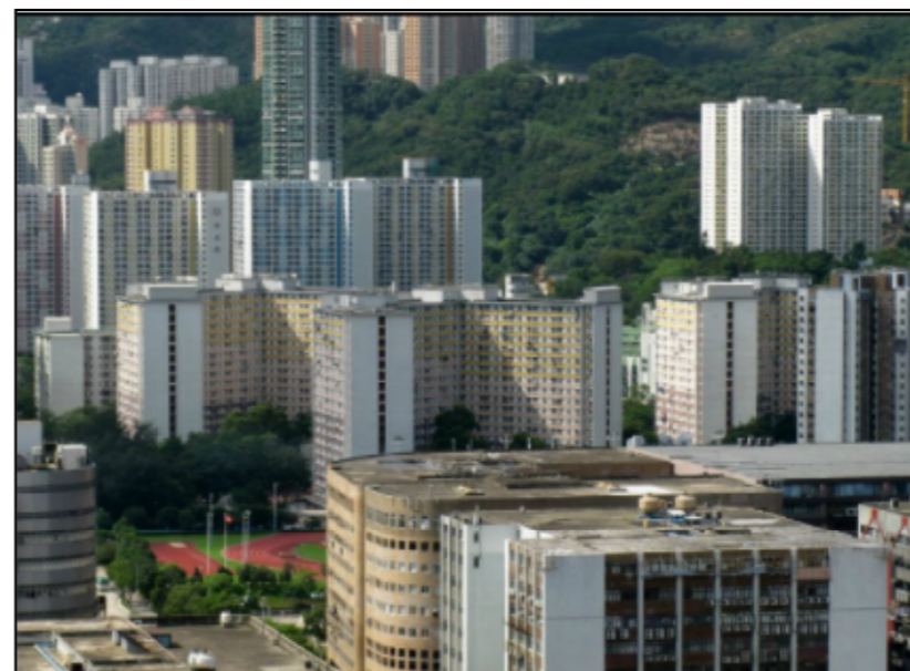
R2.11 KAI YIP ESTATE