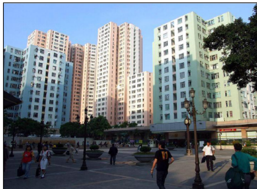
R2.5 TELFORD GARDEN