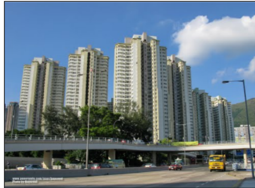
R2.9 RHYTHM GARDEN