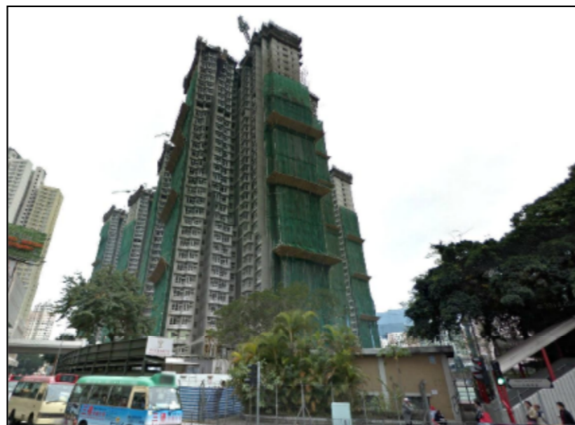
R2.8 LOWER NGAU TAU KOK ESTATE