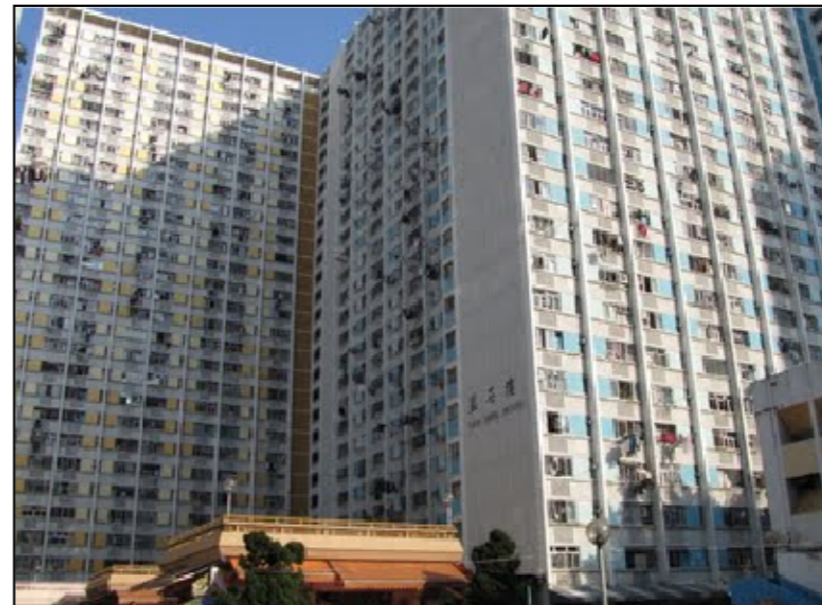
R2.10 PING SHEK ESTATE AND CHOI HUNG ESTATE