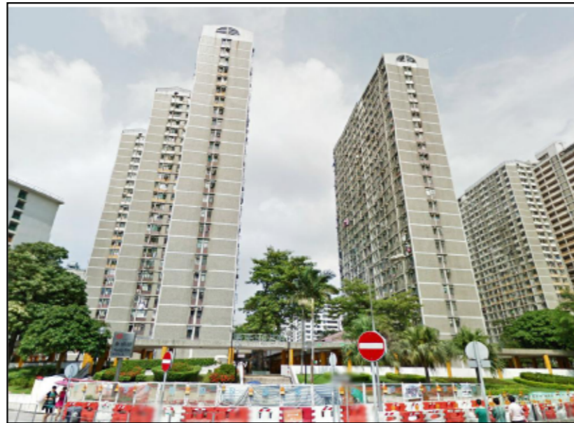
R2.6 TUNG TAU ESTATE