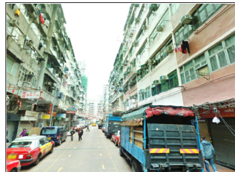
RC4.1 RESIDENTIAL AND COMMERCIAL DEVELOPMENTS IN TSIM SHA TSUI AND JORDAN