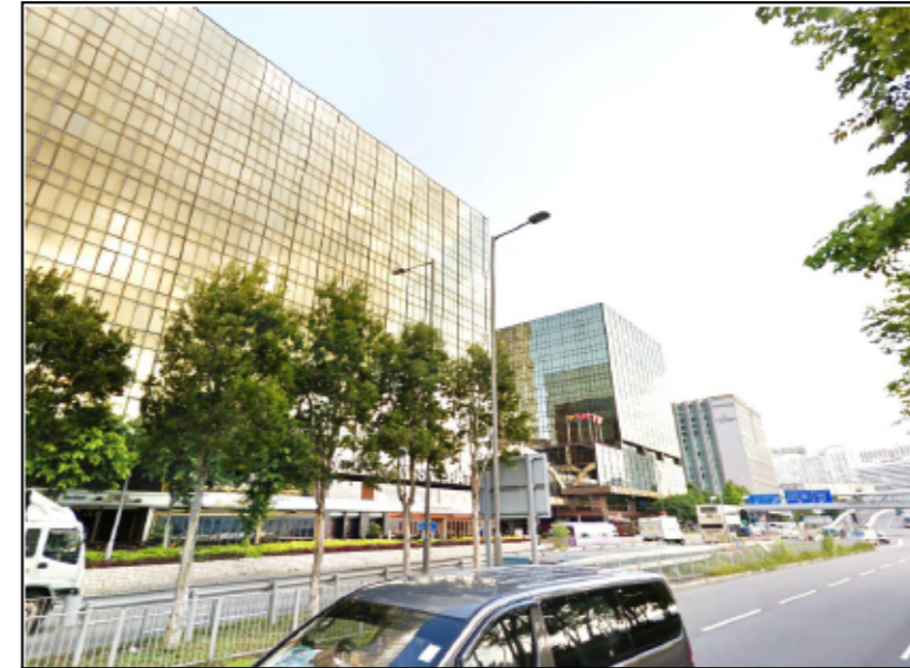
C4.1 COMMERCIAL DEVELOPMENTS ALONG SALISBURY ROAD