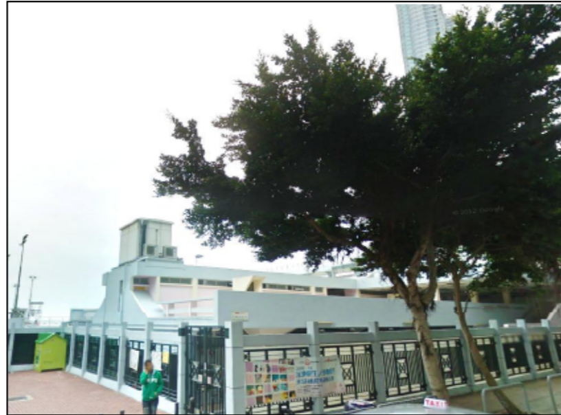
03.2 TAI WAN SHAN PARK AND SWIMMING POOL