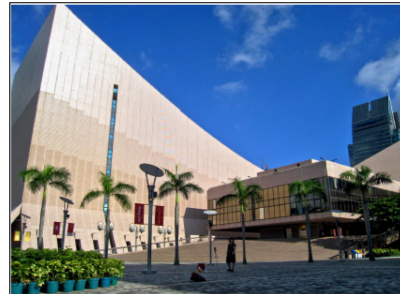
GIC4.1 ART AND CULTURAL PRECINCT AT TSIM SHA TSUI