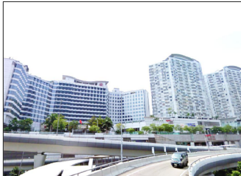
RC3.2 MIX USE AT THE METROPOLIS