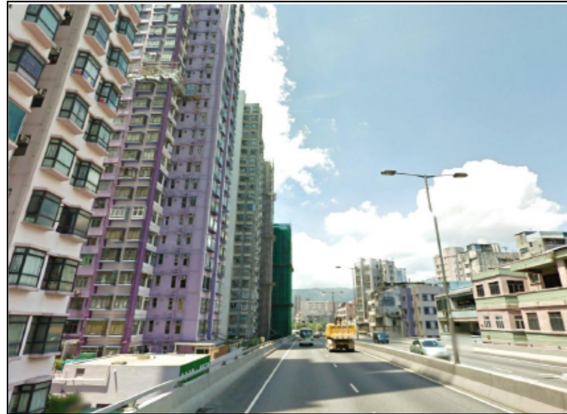
RC3.1 RESIDENTIAL AND COMMERCIAL DEVELOPMENTS ALONG CHATHAM ROAD NORTH