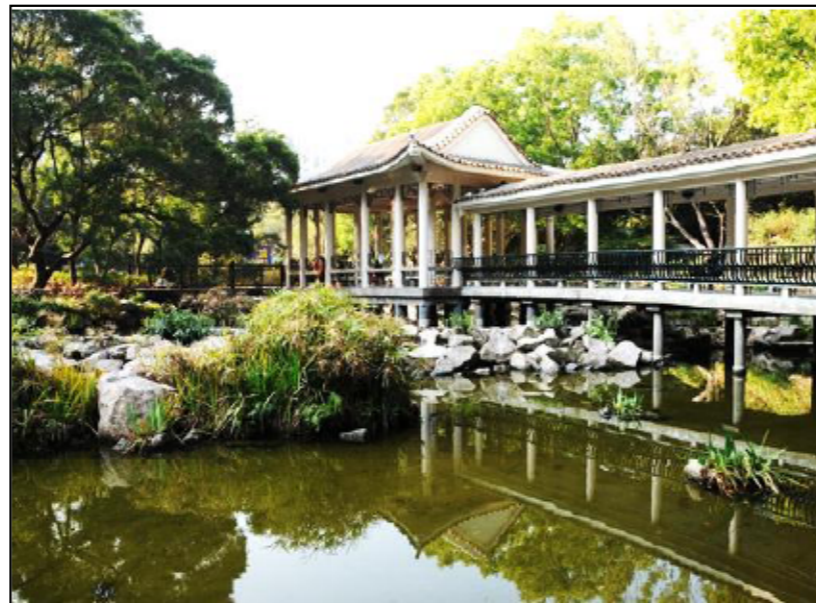
03.3 HUTCHISON PARK