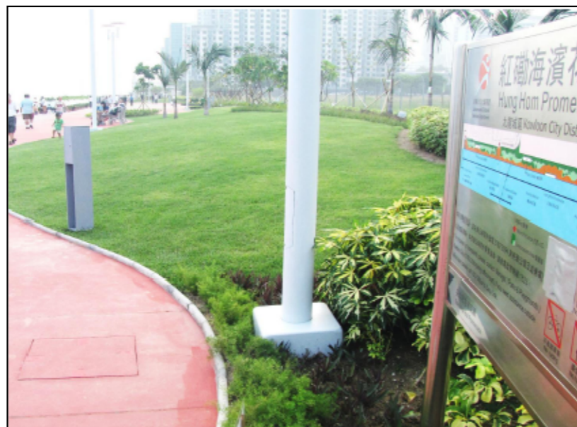
03.4 HUNG HOM PROMENADE