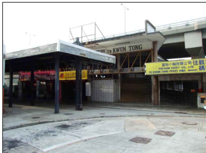
OU6.4 NORTH POINT FERRY PIER