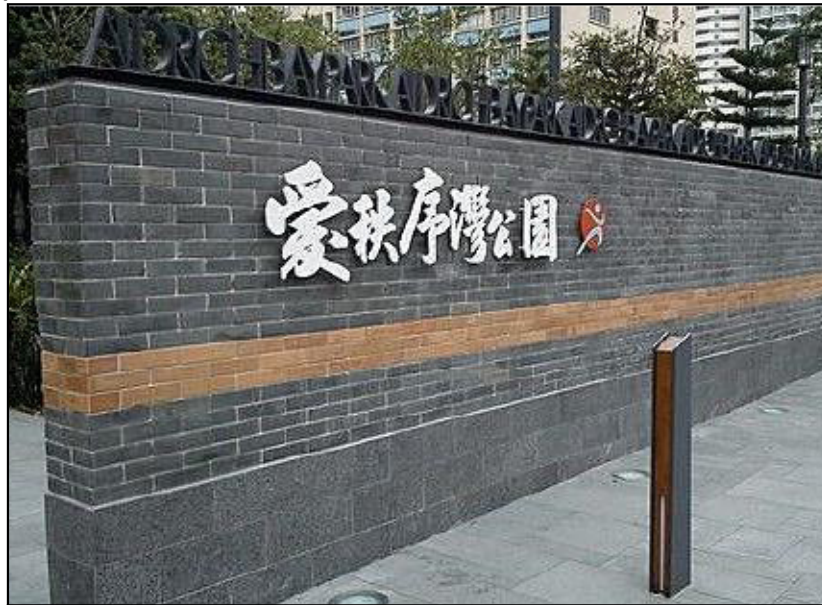
06.3 ALDRICH BAY PARK AND PROMENADE