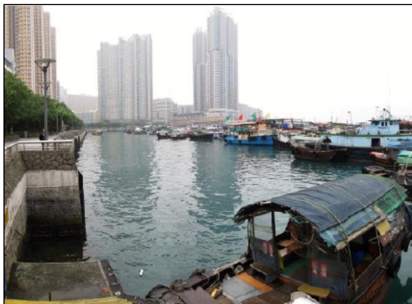
OU6.1 SHAU KEI WAN TYPHOON SHELTER