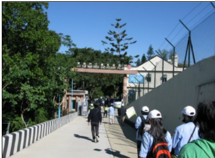
06.4 LEI YUE MUN PARK AND HOLIDAY VILLAGE