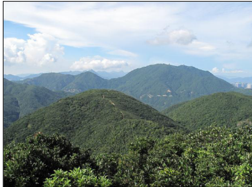
OU6.2 HIKERS AT MOUNT BUTLER