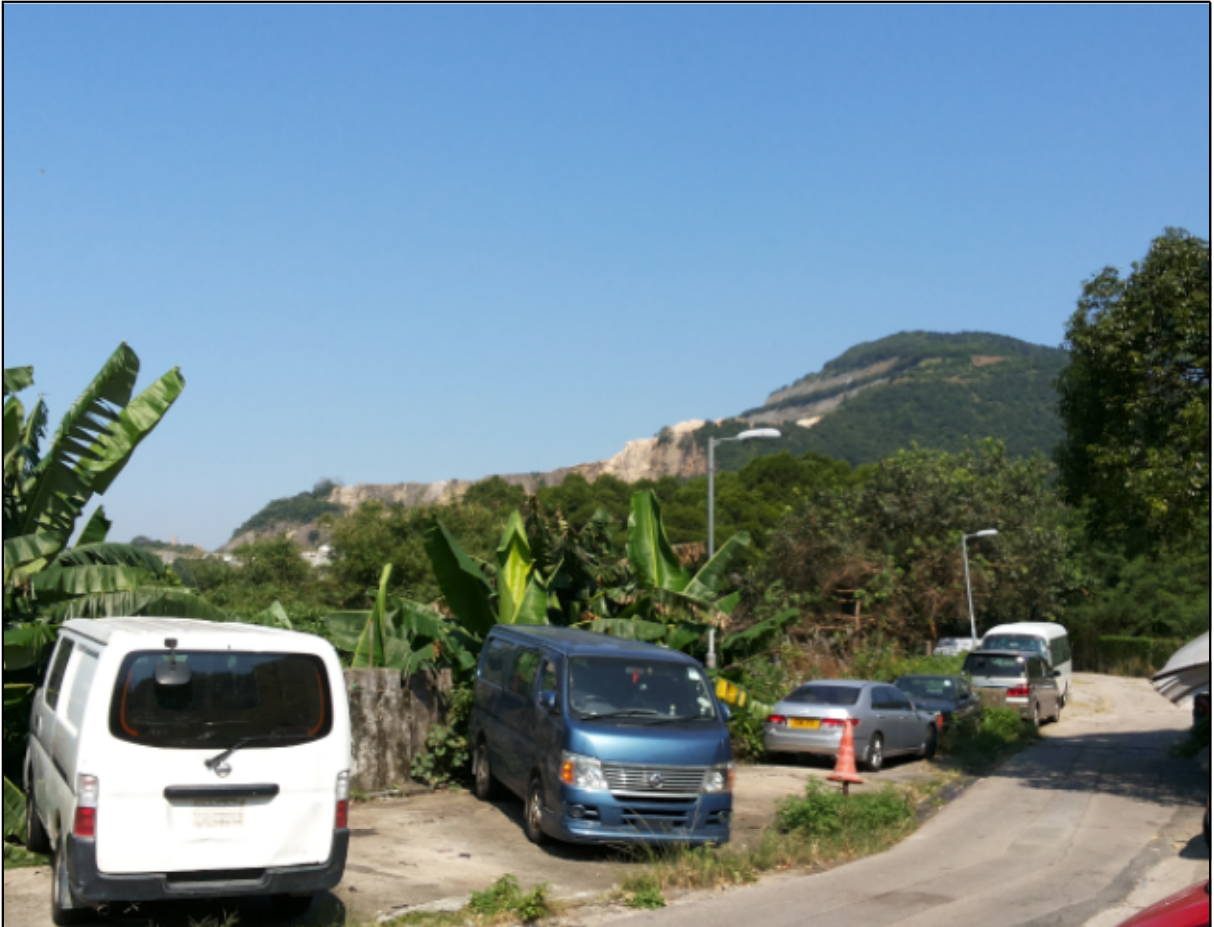
L7 - VIEWING FROM R1.15 (MA YAU TONG VILLAGE)