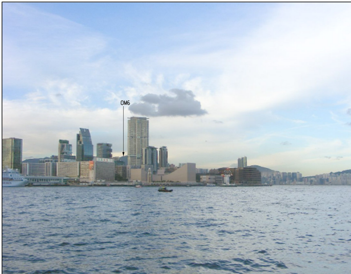
DAY 1 WITH MITIGATION MEASURES