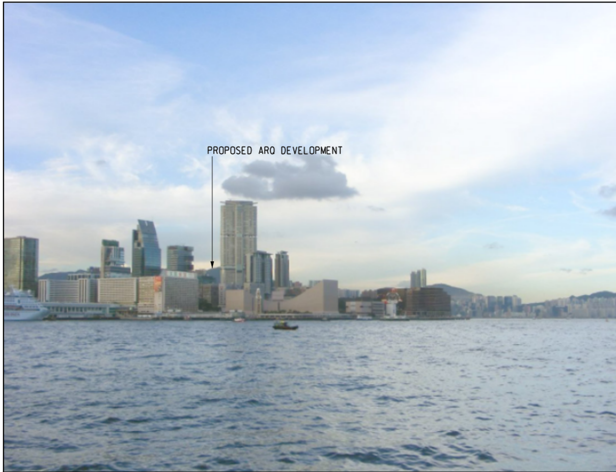
EXISTING CONDITION SVP1 FROM CENTRAL FERRY PIERS (OU5.2)