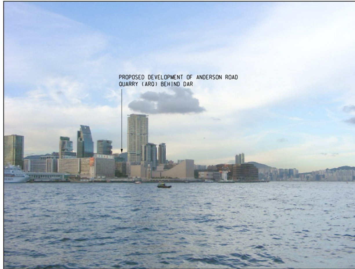
DAY 1 WITHOUT MITIGATION MEASURES