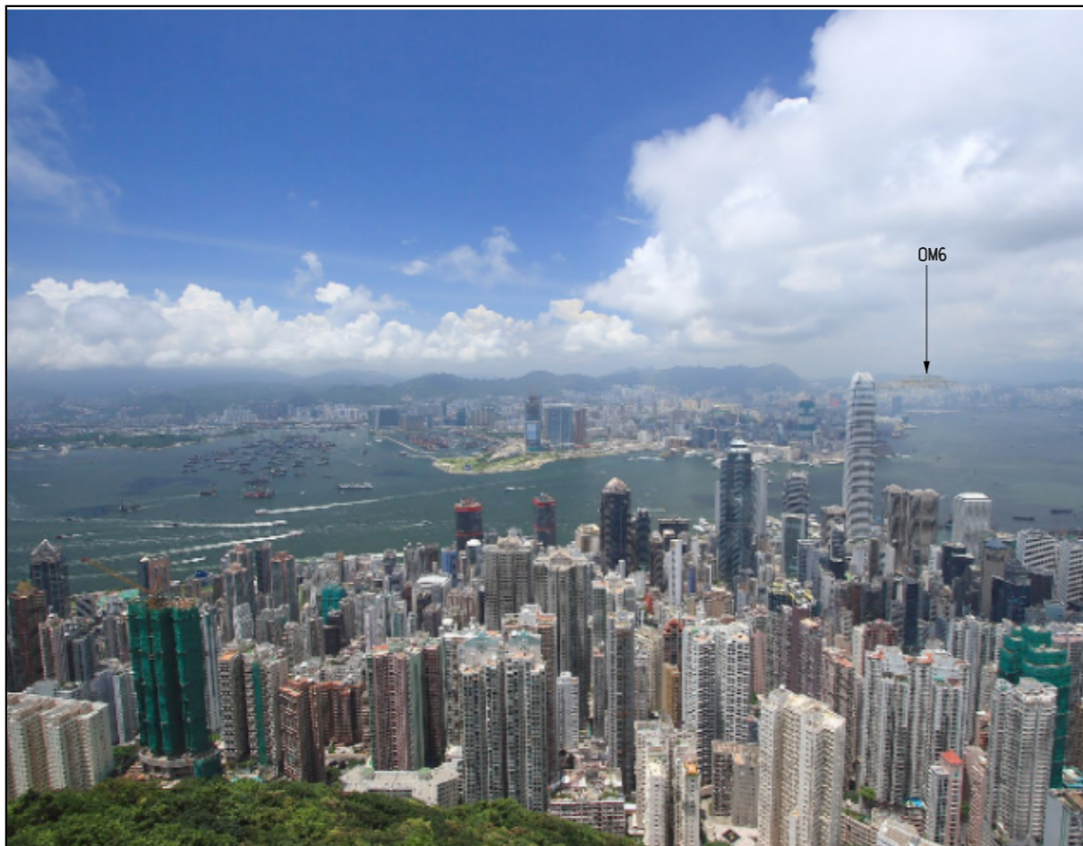
DAY 1 WITH MITIGATION MEASURES