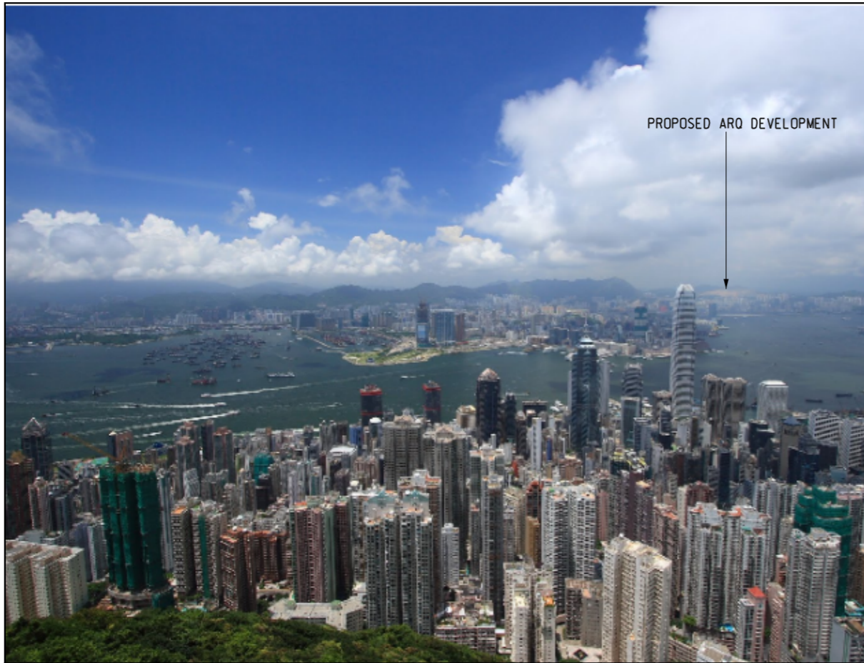
EXISTING CONDITION SVP2 FROM THE PEAK (OU5.2)