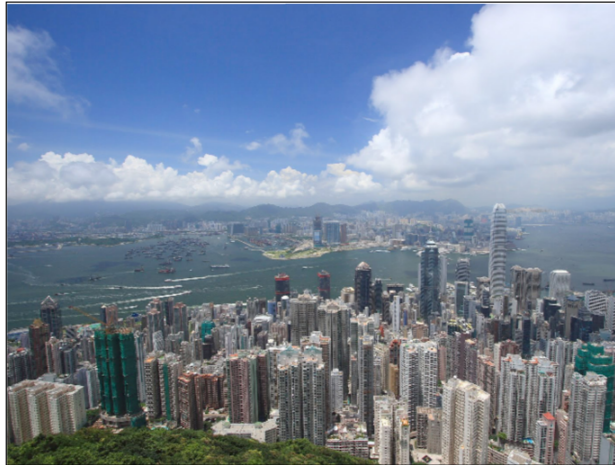
DAY 1 WITHOUT MITIGATION MEASURES