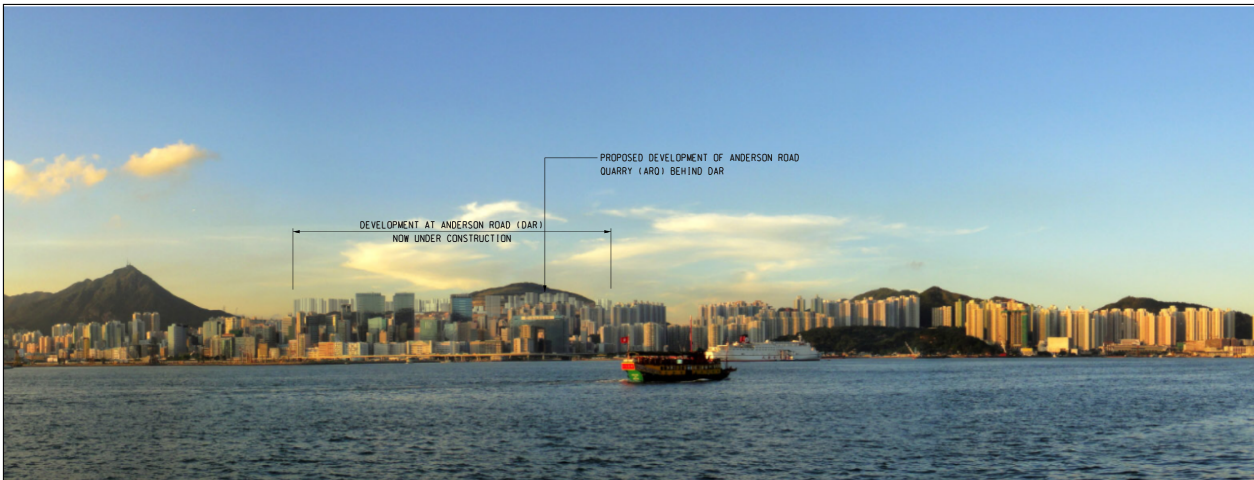
DAY 1 WITHOUT MITIGATION MEASURES