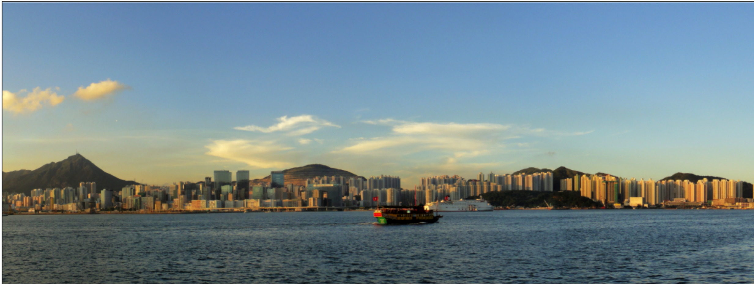
EXISTING CONDITION SVP4 FROM QUARRY BAY PARK (06.1)