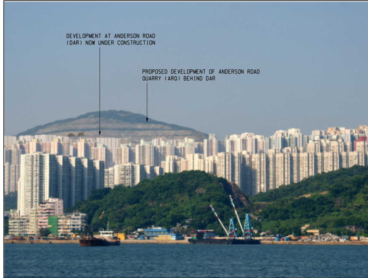
DAY 1 WITHOUT MITIGATION MEASURES