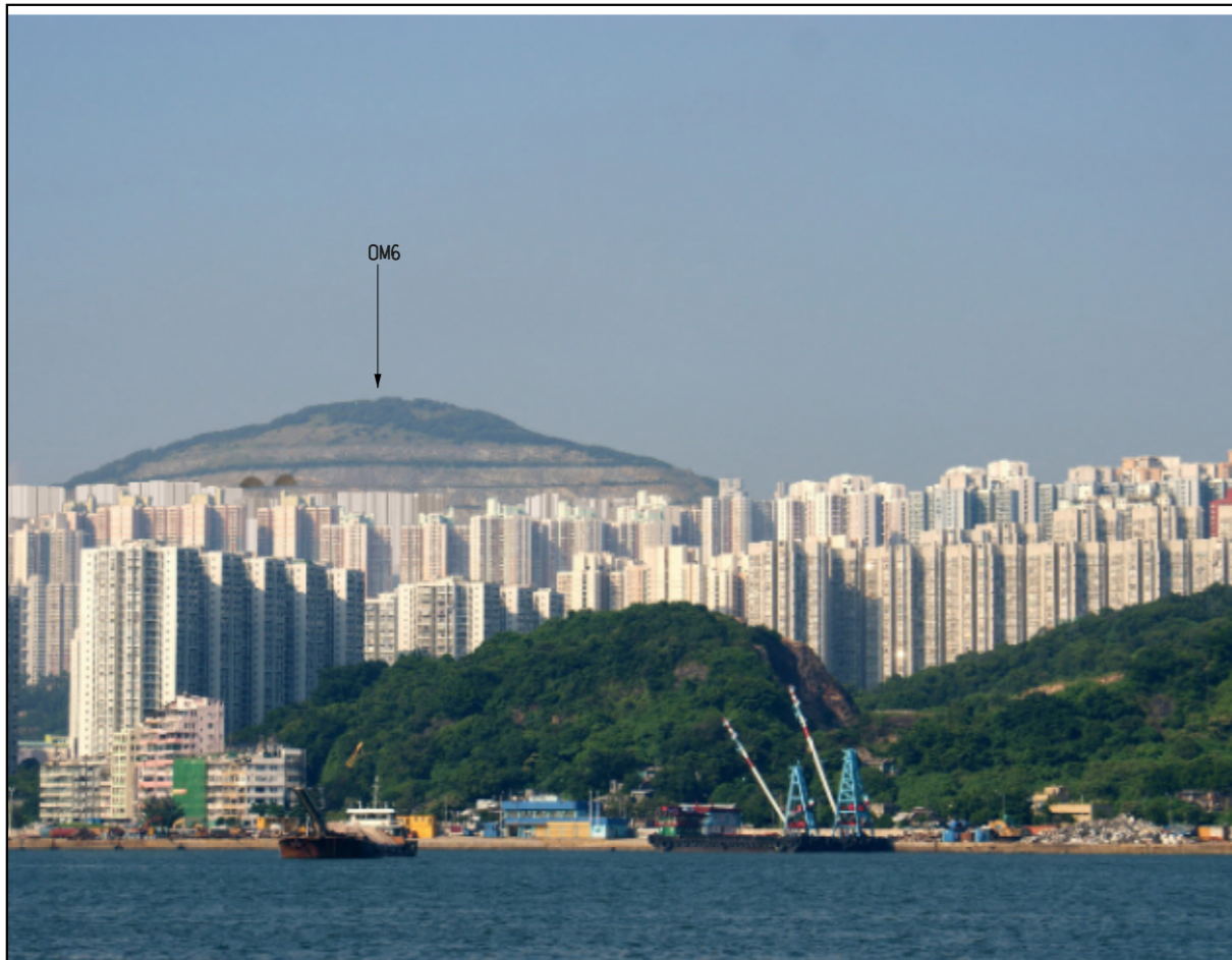
DAY 1 WITH MITIGATION MEASURES