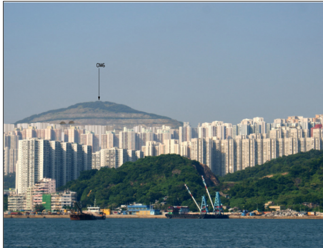
YEAR 10 WITH MITIGATION MEASURES