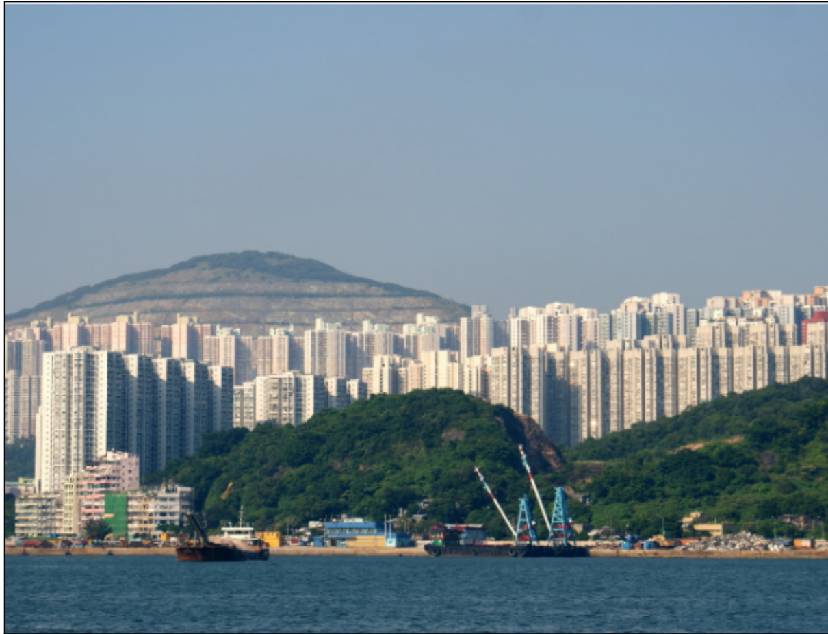
EXISTING CONDITION SVP5 FROM ALDRICH BAY PARK AND PROMENADE (06.3)