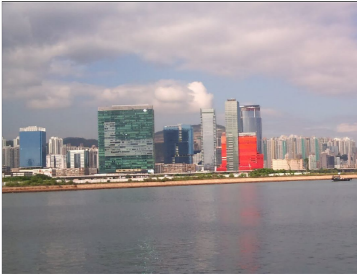
EXISTING CONDITION DVP1 FROM RESIDENTS OF SKY TOWERS, GRAND WATERFRONT TOWERS AND WYLER GARDENS (R3.1)