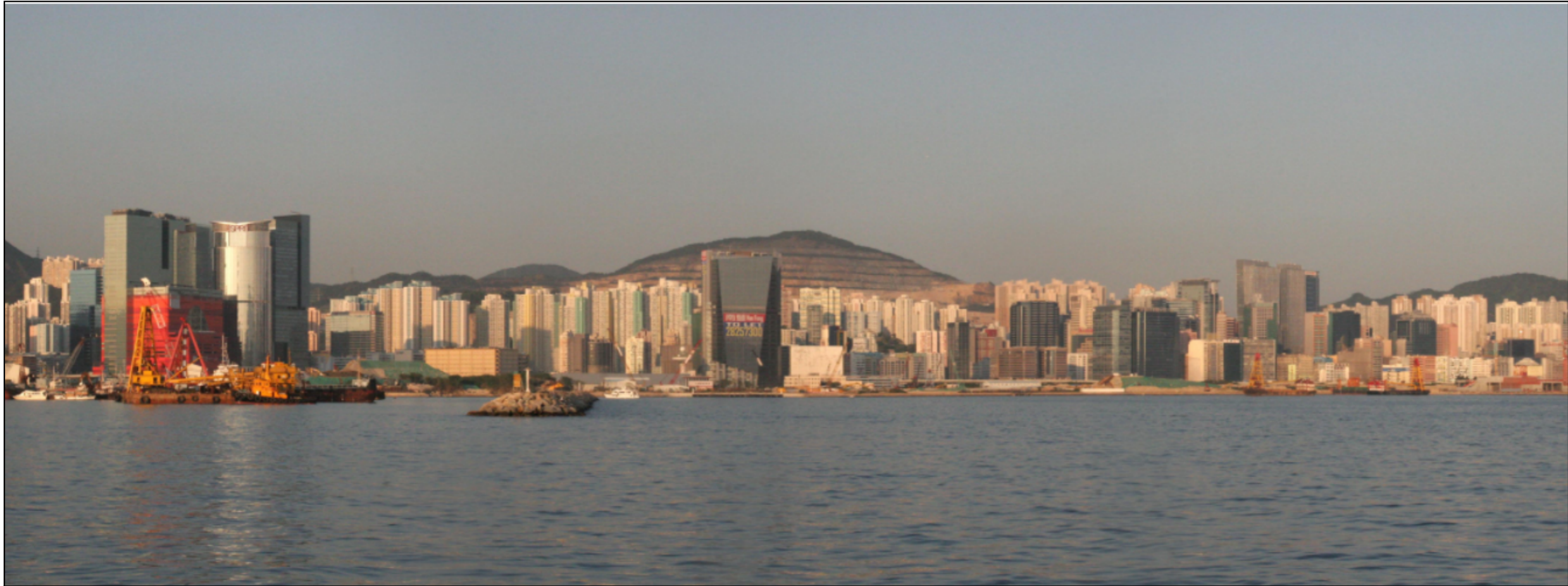
EXISTING CONDITION DVP2 FROM LAGUNA VERDE (R3.2)