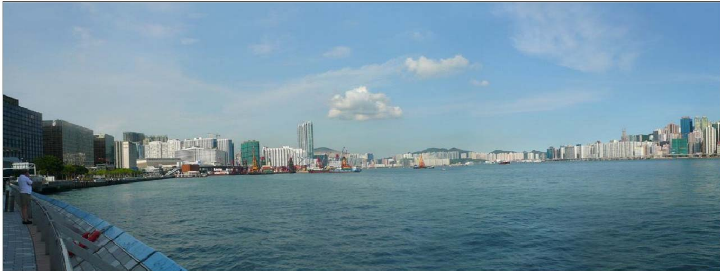
EXISTING CONDITION DVP4 FROM TSIM SHA TSUI PROMENADE (O4.1)