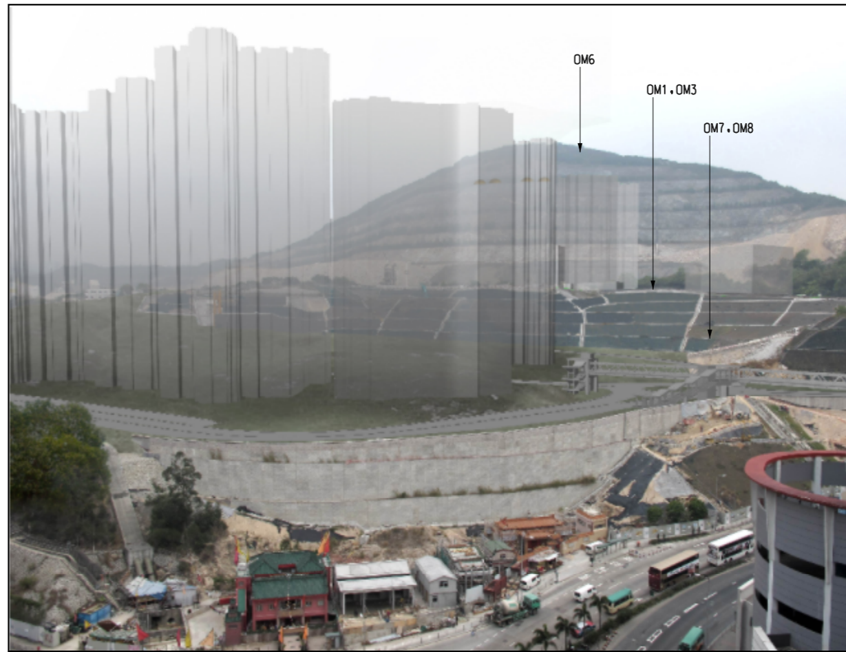
YEAR 10 WITH MITIGATION MEASURES