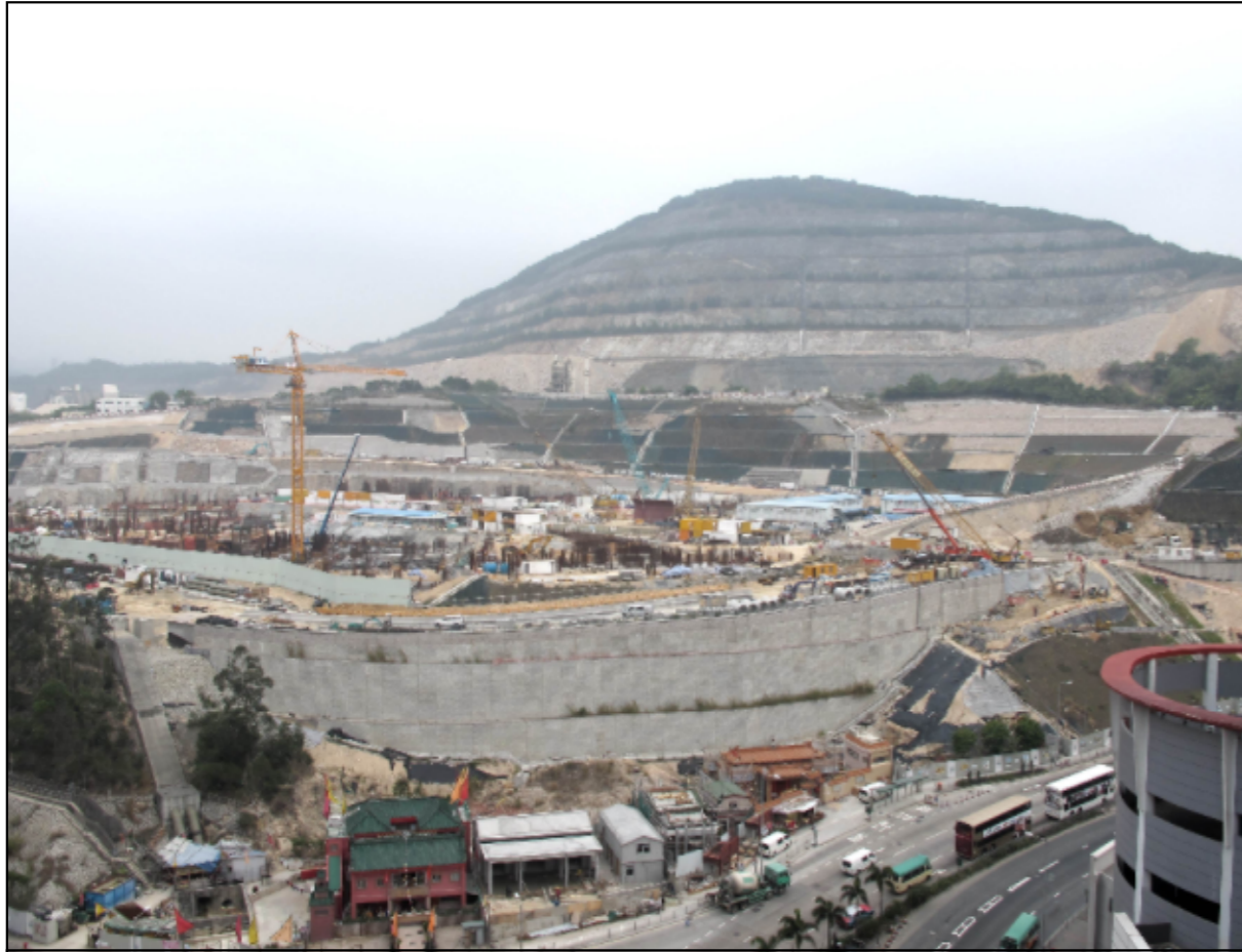
EXISTING CONDITION LVP1 FROM SAU MAU PING ESTATE, SAU FAI HOUSE (R1.1)