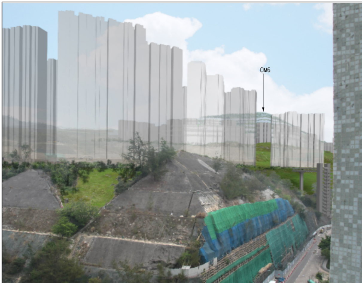
DAY 1 WITH MITIGATION MEASURES