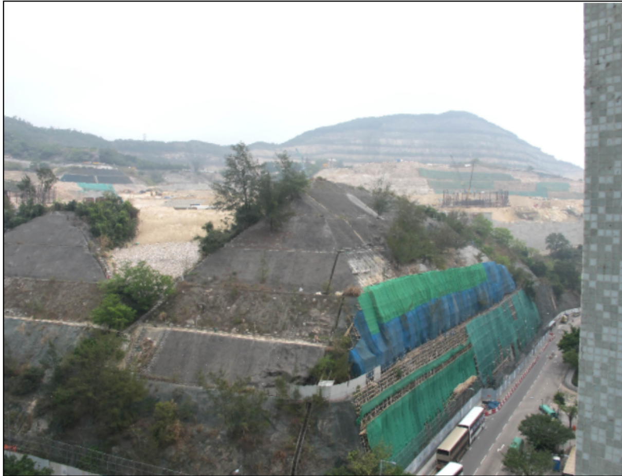
EXISTING CONDITION LVP3 FROM SHUN TIN ESTATE (R1.3)