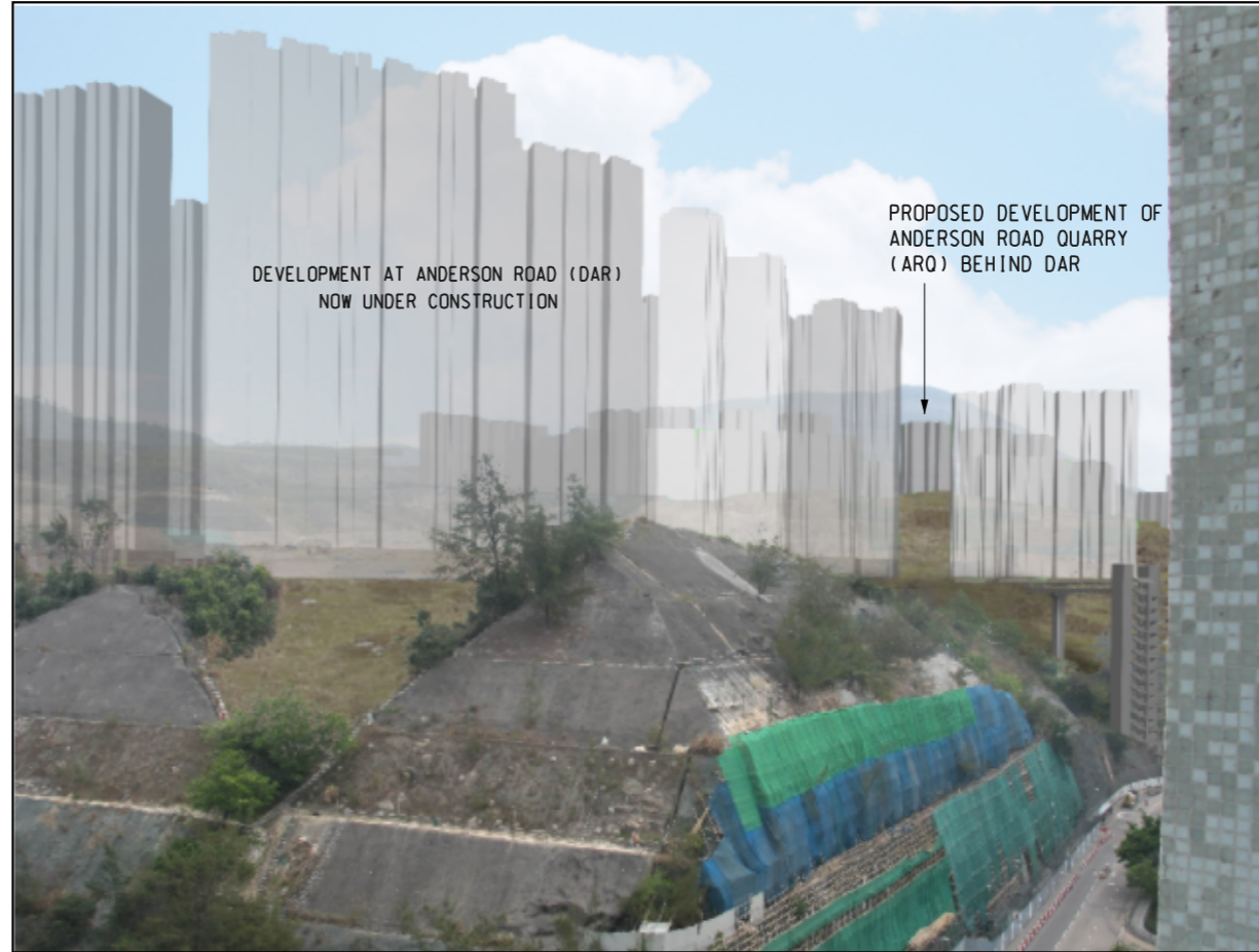
DAY 1 WITHOUT MITIGATION MEASURES