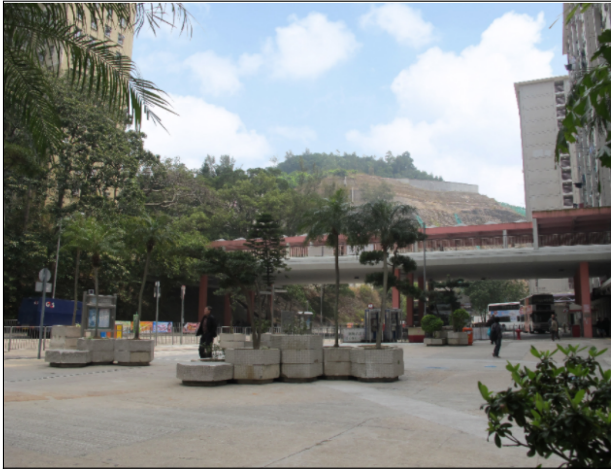
EXISTING CONDITION LVP4 FROM SHUN LEE ESTATE (R1.4)