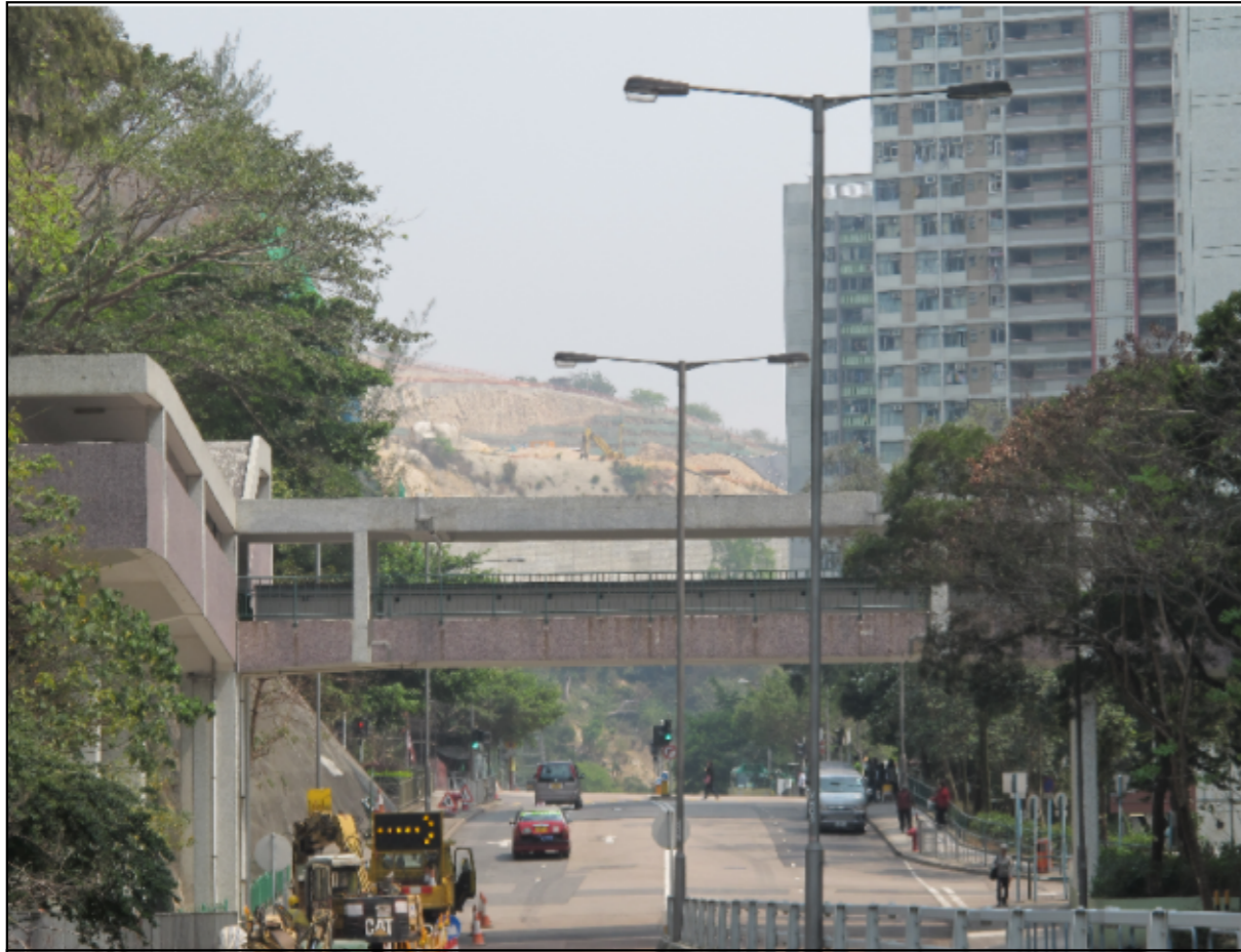
EXISTING CONDITION LVP5 FROM SHUN LEE ESTATE PARK (01.5)