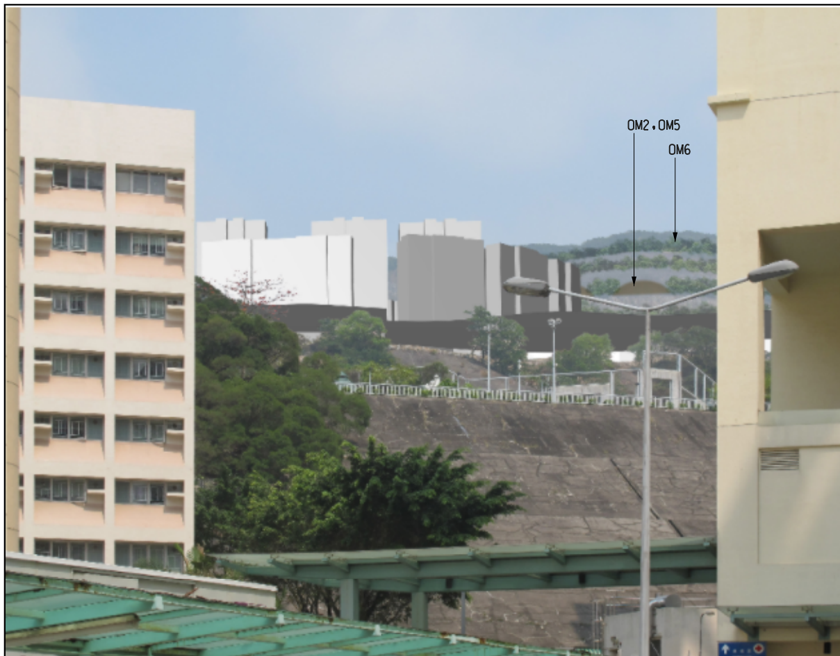
DAY 1 WITH MITIGATION MEASURES