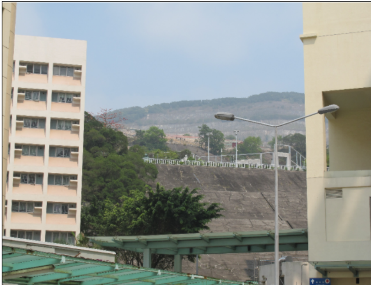
EXISTING CONDITION LVP7 FROM UNITED CHRISTIAN HOSPITAL (GIC1.1)