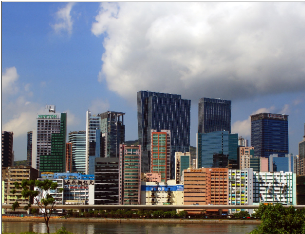
EXISTING CONDITION LVP9 FROM PLANNED CRUISE TERMINAL AND RUNWAY PARK (P2.2)