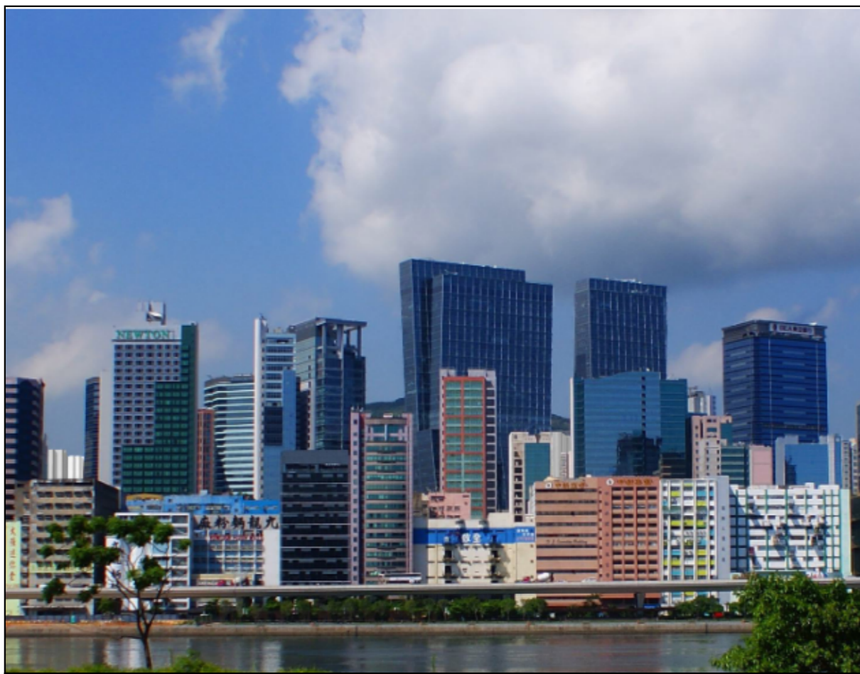
DAY 1 WITH MITIGATION MEASURES