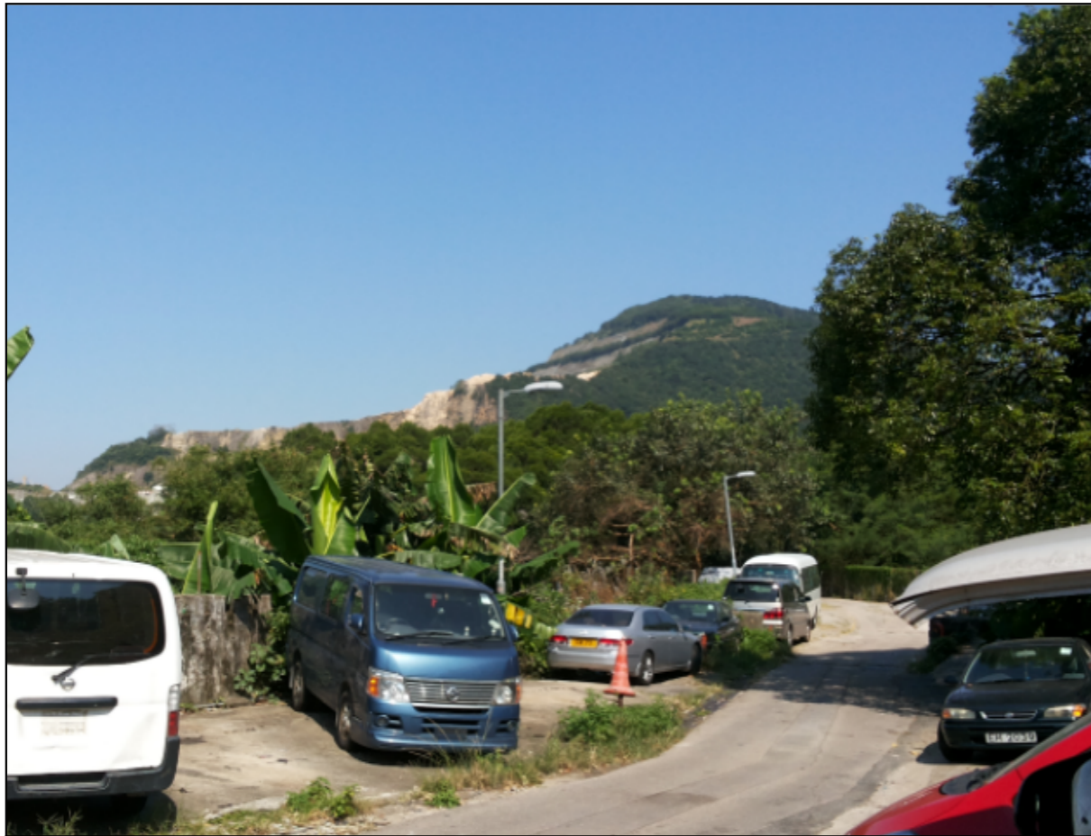
EXISTING CONDITION LVP11 FROM MA YAU TONG VILLAGE (R1.15)