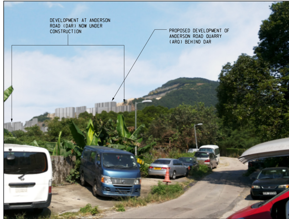
DAY 1 WITHOUT MITIGATION MEASURES