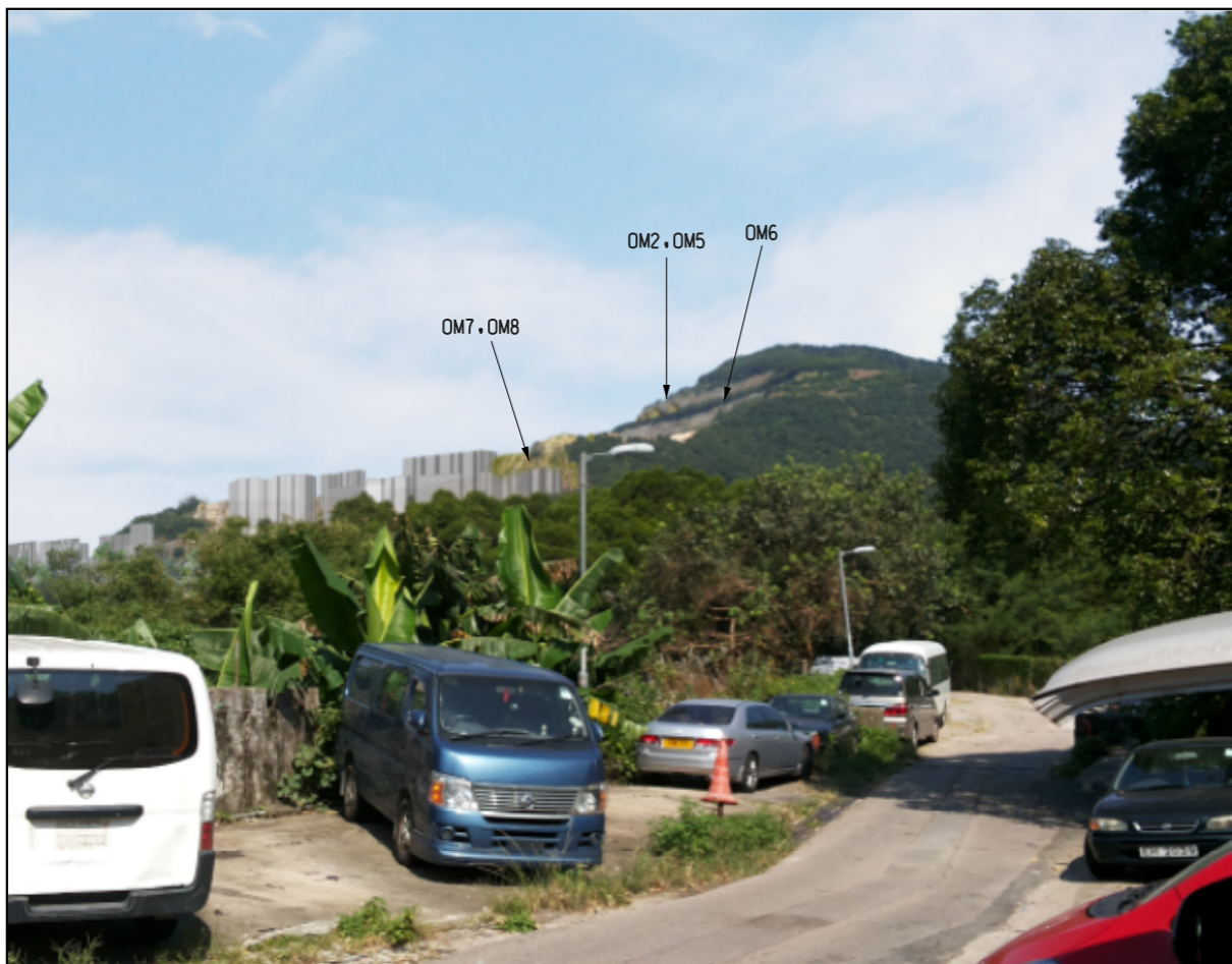
DAY 1 WITH MITIGATION MEASURES