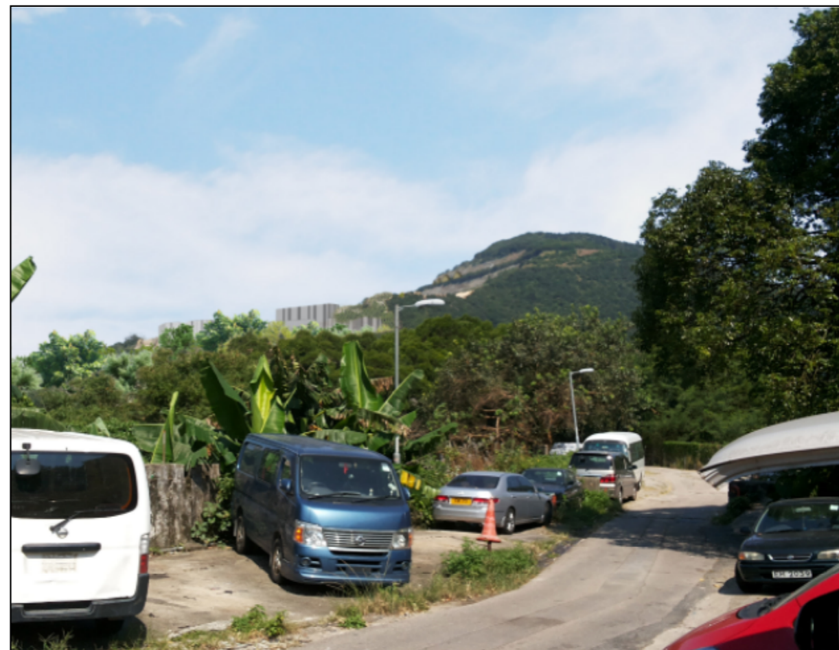
YEAR 10 WITH MITIGATION MEASURES