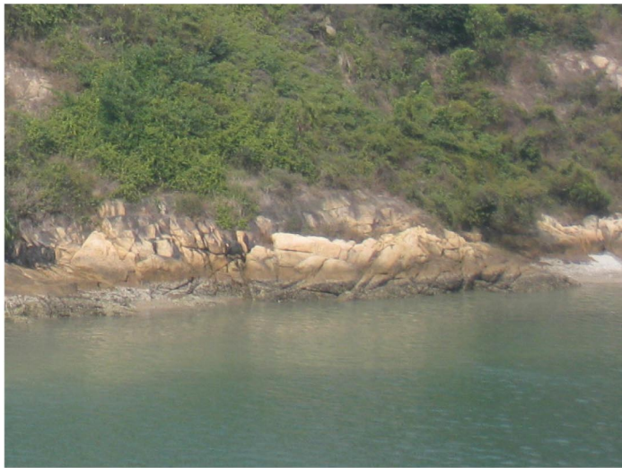
CLK/LR5 - Natural Coastline