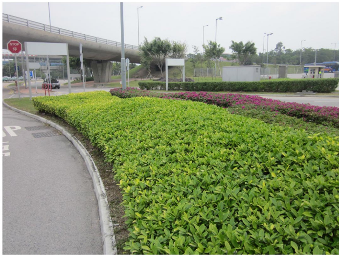
CLK/LR4a - Roadside Vegetation - Amenity Planting