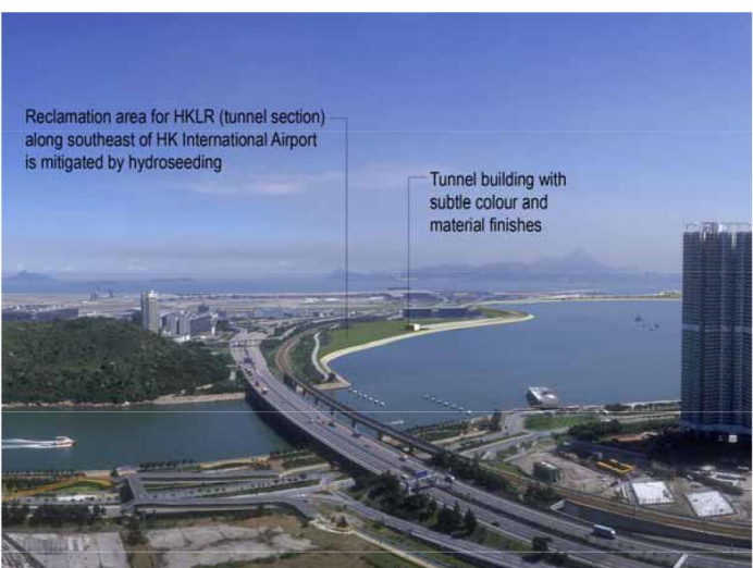
CLK/LR6 - Amenity/Compensatory Planting on HKBCF/ HKLR

Copyright in this document and all proprietary rights in the information it contains belong to the AA. It is a condition of the supply of this document, in whatever form, that the recipient shall hold it in confidence and shall not duplicate or otherwise reproduce it in whole or in part, nor disclose its contents without the written consent of the AA.