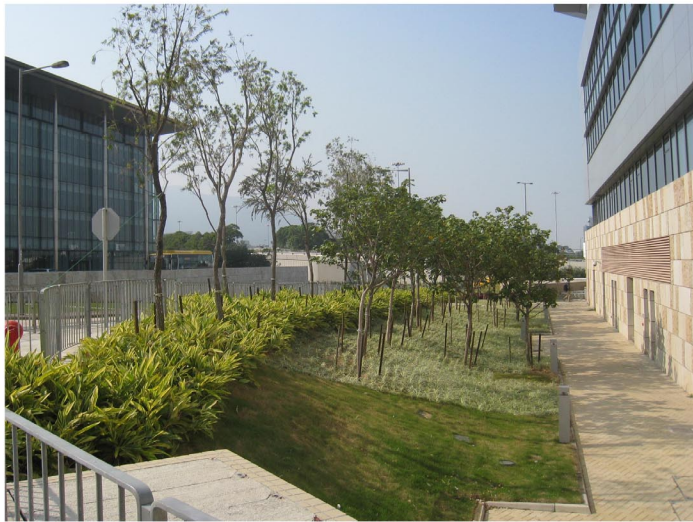
CLK/LR3 - Landscaped areas around Existing Airport Buildings