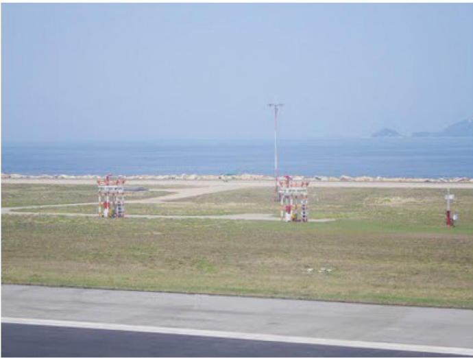
CLK/LR2 - Grass/Turf Areas Around Runways and Verges