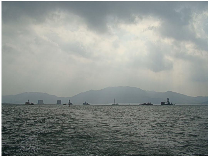
CLK/LR1 - Coastal Waters of North Lantau