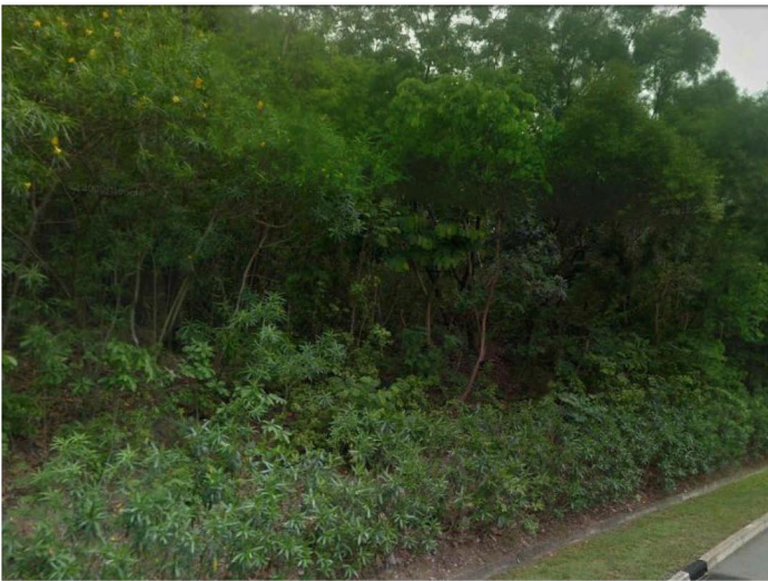
CLK/LR4b - Roadside Vegetation on Modified Slopes