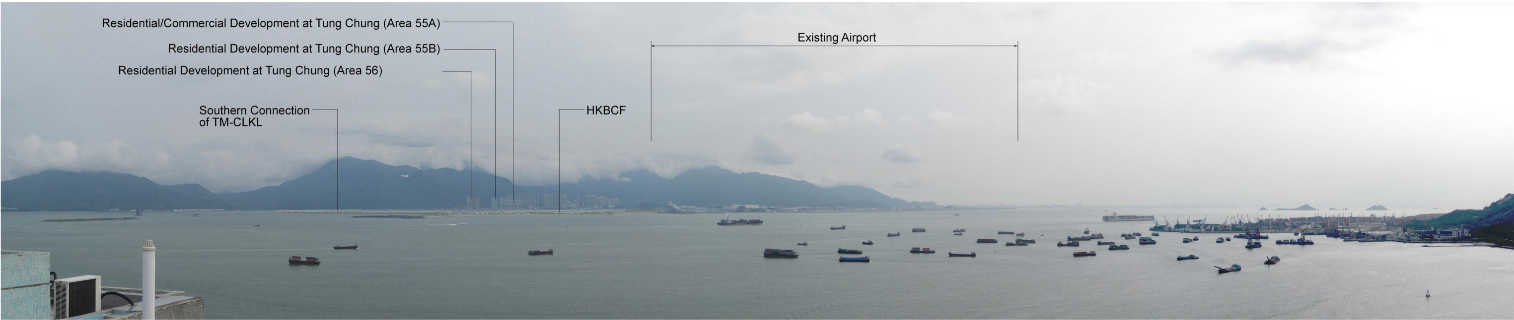
Planned Baseline Conditions in 2016 Before Commencement of the 3RS (with Committed and Approved Projects: HKBCF, HKLR, the Southern Connection of TM-CLKL, Residential/Commercial Development at Tung Chung (Area 55A), Residential Development at Tung Chung (Area 55B) and Residential Development at Tung Chung (Area 56))