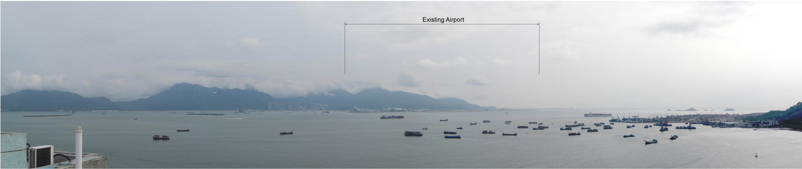
Existing Baseline Conditions in June 2013